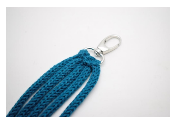
5. Cut the yarn and weave in ends.