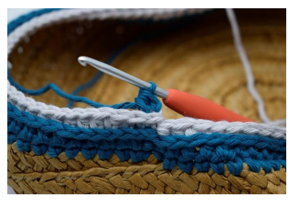
3. Like so.