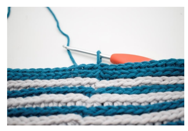
1. Ch 1.