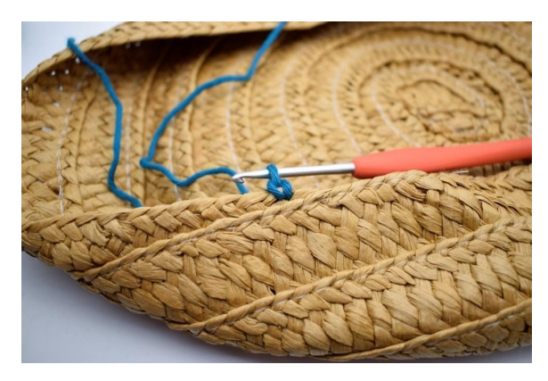
1. Use color A. Loop the yarn through a st/loop in the edge of the bag base.