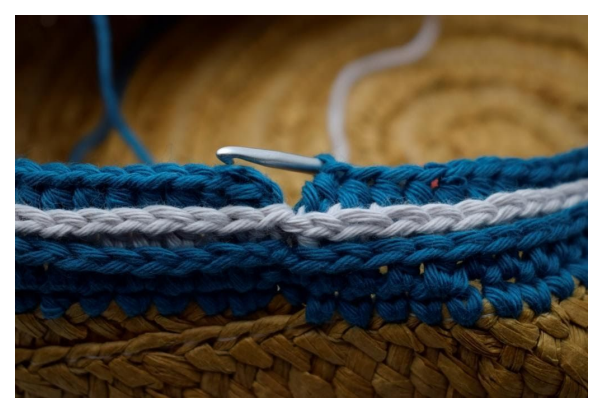
4. Repeat the hdc in the b-bl of the sts until end of round.