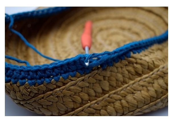
4. Catch your loop.