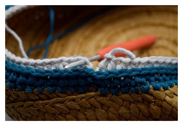
7. Join your round with a sl st from the back. Slip your loop off the hook, thread the hook from the back through the 2nd ch from the beginning.