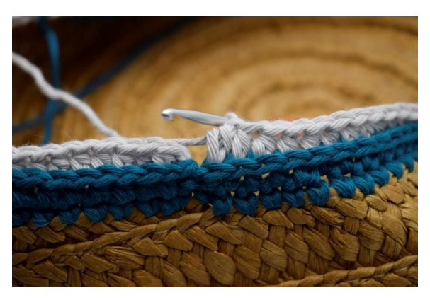
6. Repeat this all the way around.