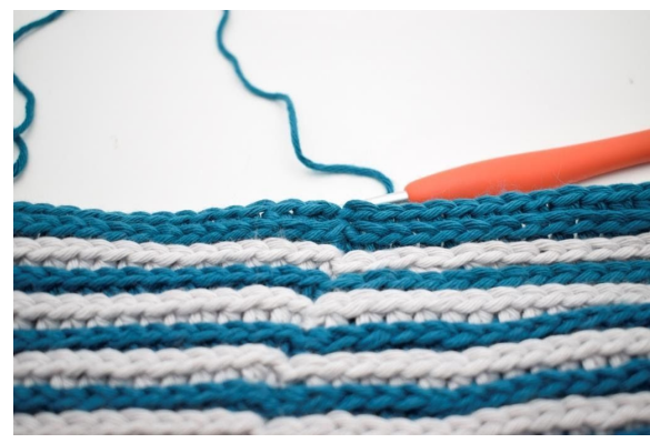
2. then sc into b-bl of every st of the round. Join round with a sl st from the back. (114).