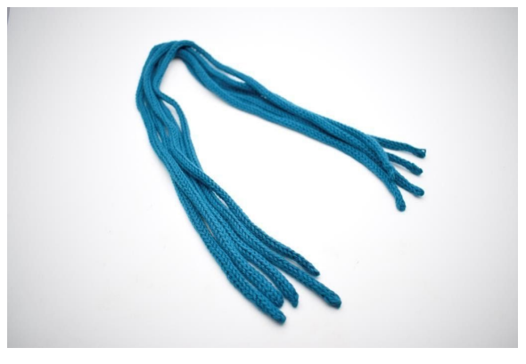
1. Using the knitting mill and the Rainbow 8/4 yarn, make 5 i-cords of about 65 cm each.

Using the knitting mill and the Rainbow 8/4 yarn, make 5 i-cords of about 65 cm each. Sew them together and attach them as pictured below: