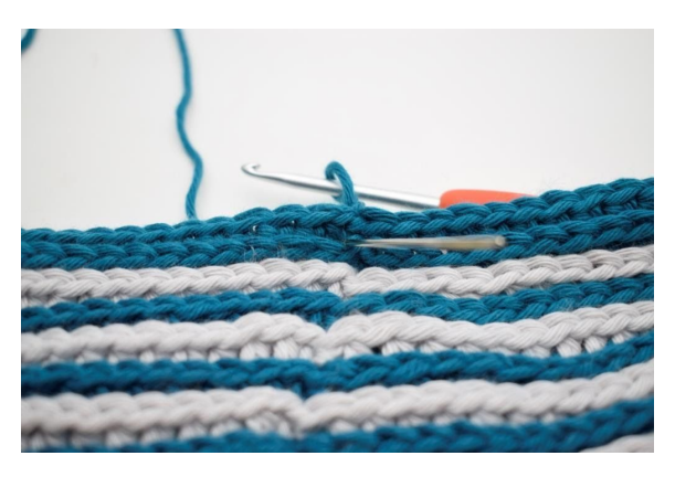
2. SPsc into the next st. A SPsc is a sc that is worked into the st below the one you would normally work in. The needle shows where to work your first SPsc.