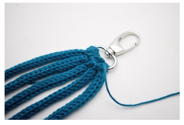
4. Sew the cords around the d-ring.