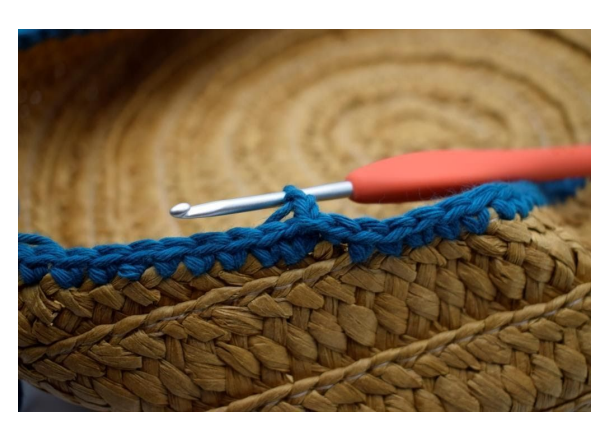
1. Ch 2.