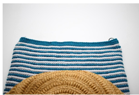
2. Cut yarn and weave in ends.