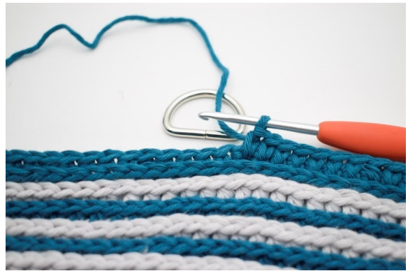
5. SPsc into the next 5 sts, working around a d-ring to attach it.