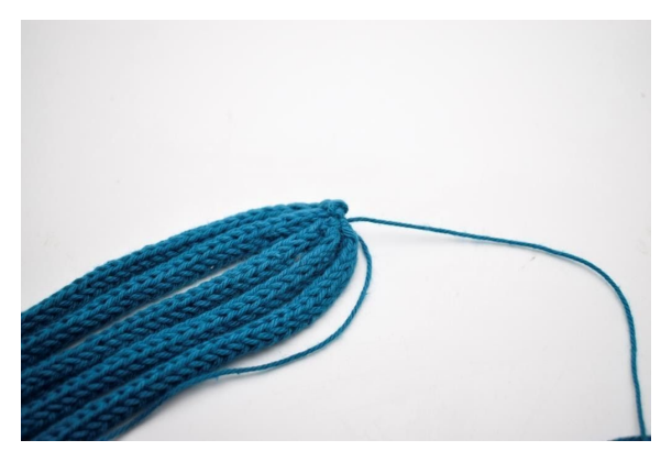
2. Sew the ends of the 5 i-cords together.