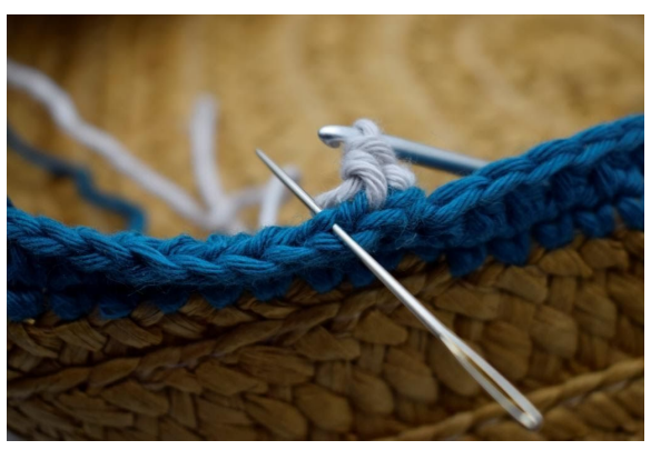
4. Make a hdc in the b-bl of the next st.