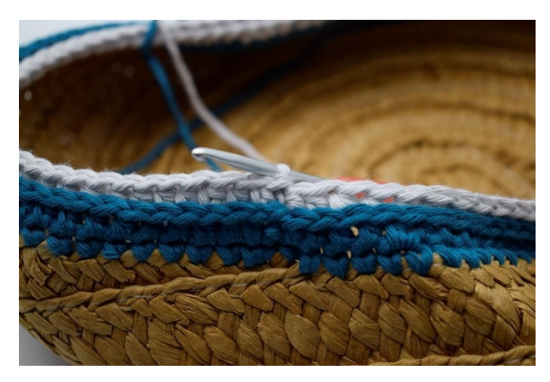
9. Like so. (114)