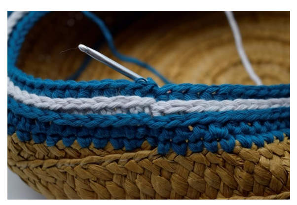
6. Like so. (114)