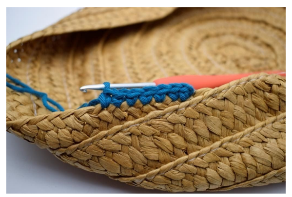
2. Ch 1, then sc into every st/loop around the bag base.