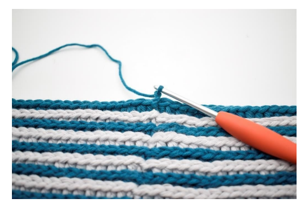
1. Continue in color A. Ch 1,