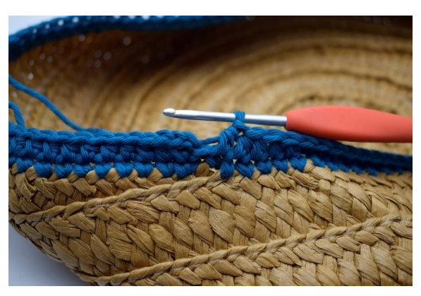
2. Hdc in every st of the round.