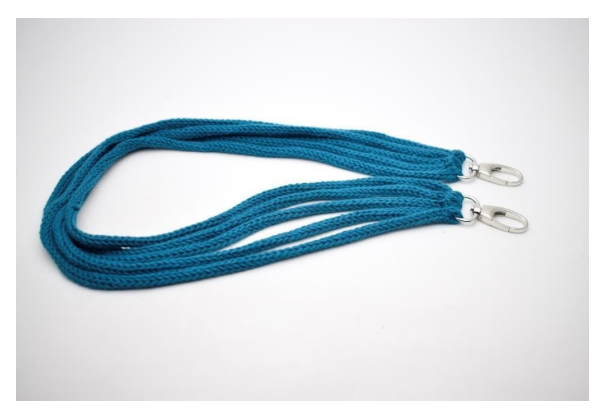
6. Repeat the same steps for the other end.