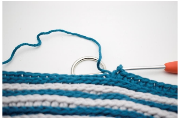
8. SPsc into the next 5 sts, working around another d-ring to attach it.