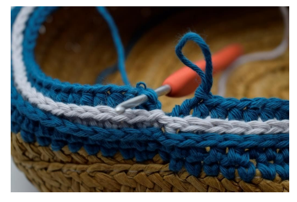
5. Join round with a sl st from the back.