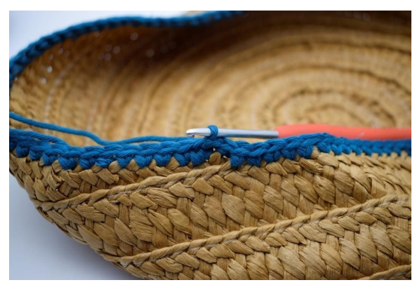
3. Finish round with a sl st. (114)