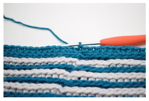
10. SPsc into the next 26 sts. Join the round with a sl st. (114).