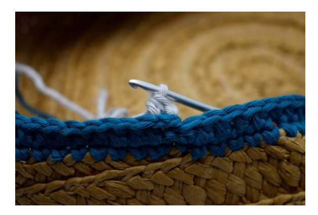
3. Like so.