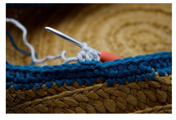
5. Like so.