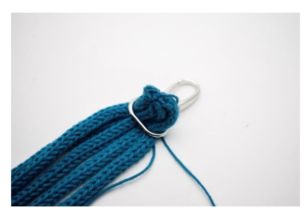
3. Thread the cords through the d-ring of the carabiner.