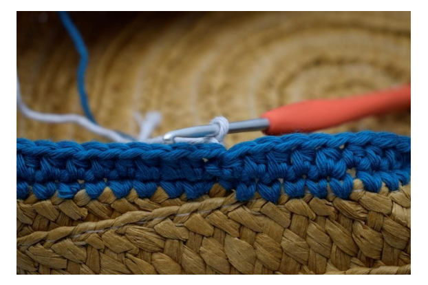
1. Switch to color B. Ch 2.