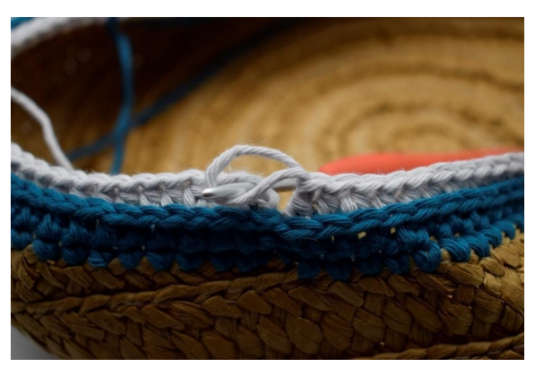
8. Catch your loop and pull through the st.