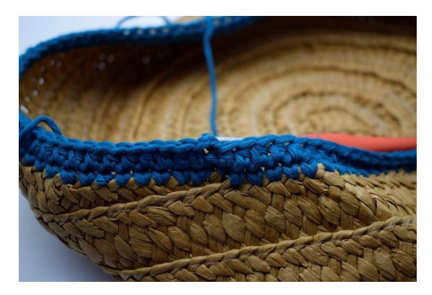
5. Pull the loop through the st. You have now made a sl st from the back. (114)