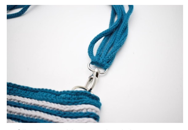
7. Clip the carabiners to the d-rings crocheted to the bag.