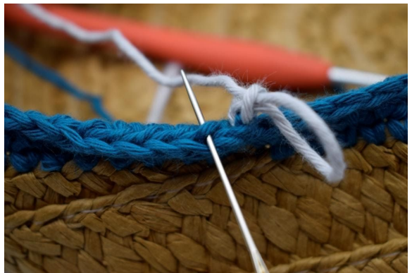
2. Now make a hdc in the b-bl. The bottom back loop is the loop that is shown when you tip your work a bit towards you. It it just behind the two loops you normally work through. The needle in the picture shows where you should make your first hdc.