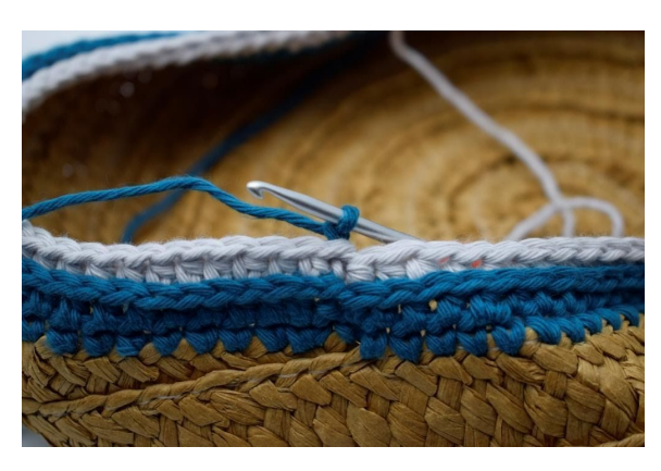
1. Switch to color A.