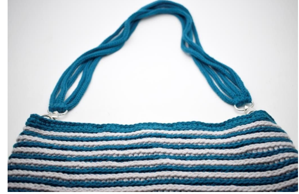
8. Like so.