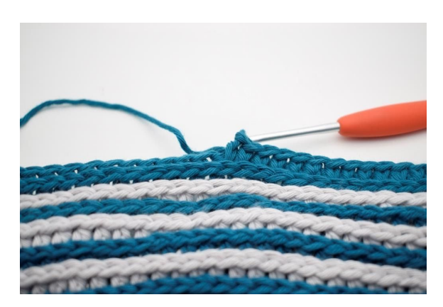
7. SPsc into the next 52 sts.