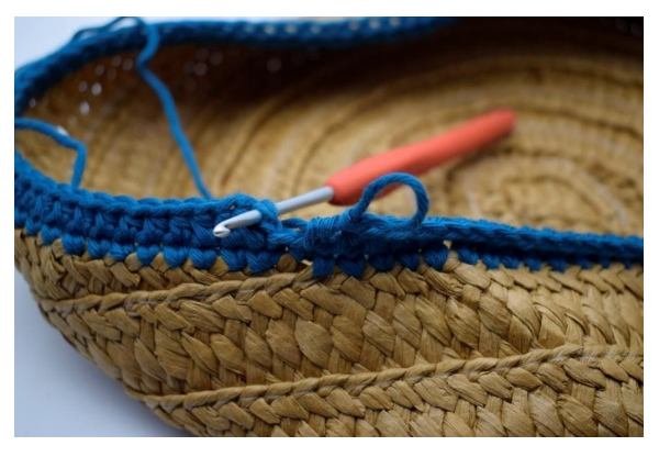
3. Join round with a sl st from the back. Lift the loop off the hook and thread the hook through the 2nd ch from the beginning of the round as shown in the picture.