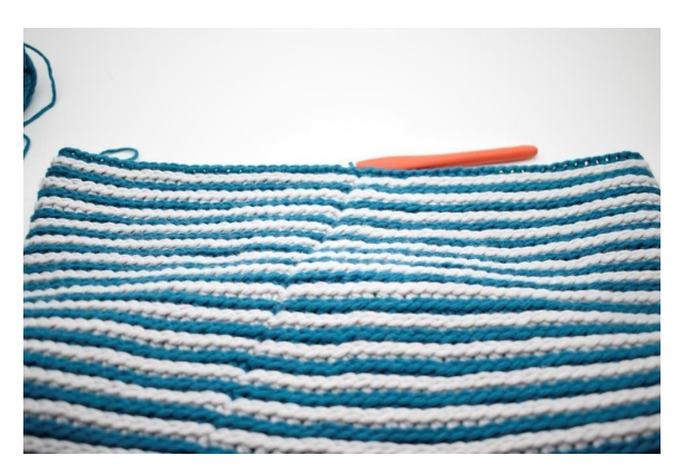
1. Repeat rounds 3 and 4 until you have 34 rounds in total.