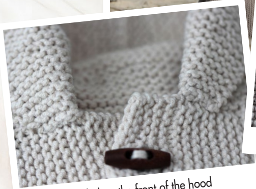
Folded on the front of the hood