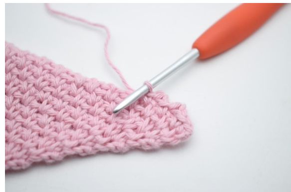
12. Like so.