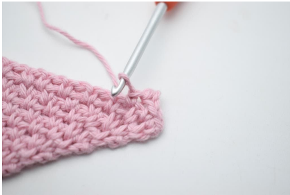
7. Like so.