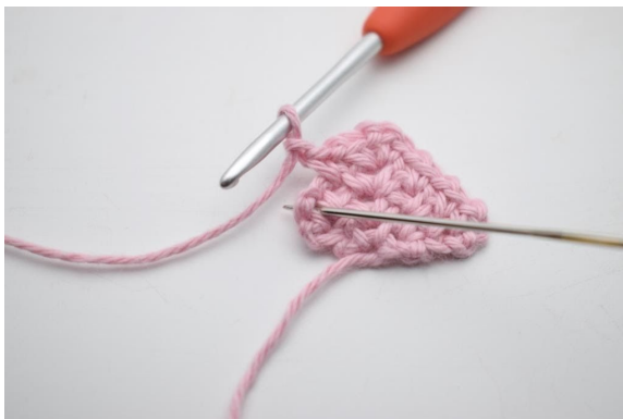
17. Sc into the next ch-sp from last row.