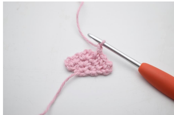
10. Ch 1.