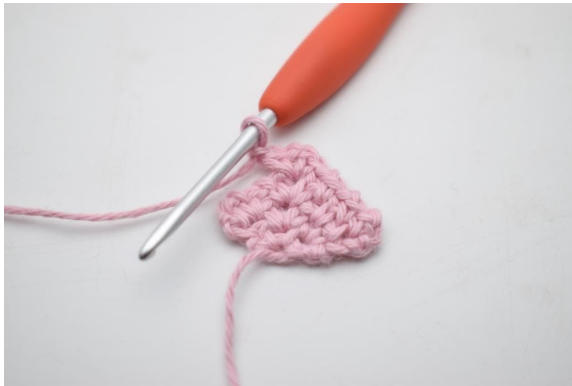
13. Ch 1.