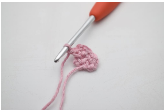
7. Ch 1.