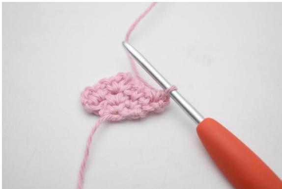
3. Like so.