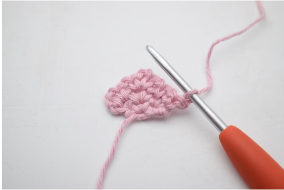
1. Turn and ch 1.