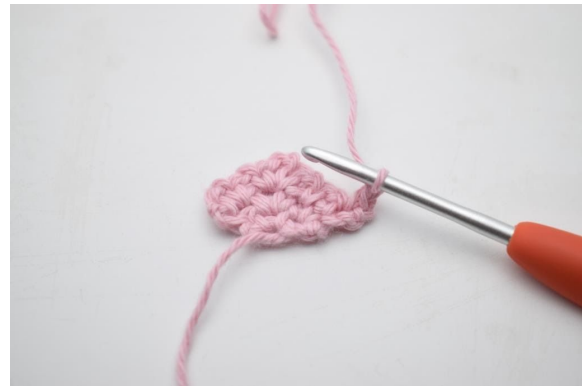
4. Ch 1.