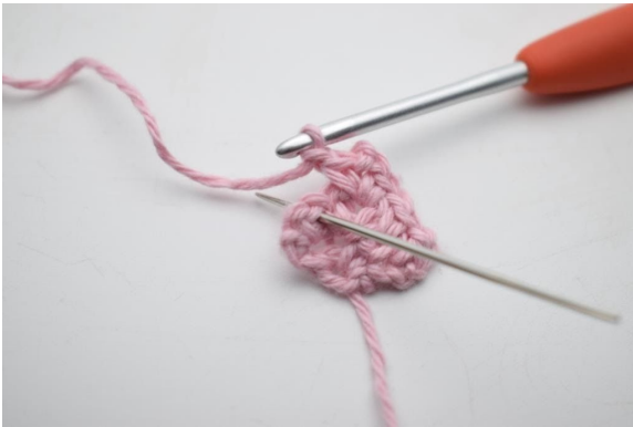
11. Sc into the ch-sp from last row.