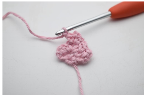
10. Ch 1.