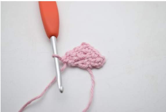
15. Like so.