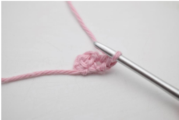
3. Like so.