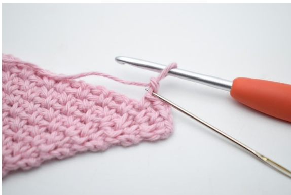
9. Make 1 sl st in the 2nd st from the hook