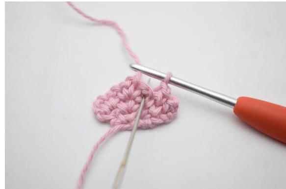
8. Sc into the next ch-sp from last row.