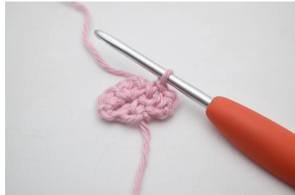
6. Like so.