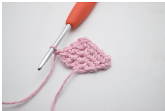
19. Ch 1.