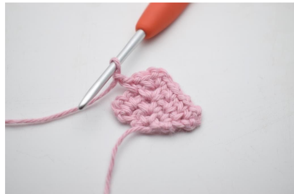
16. Ch 1.