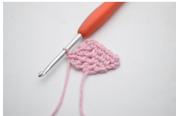
18. Like so.