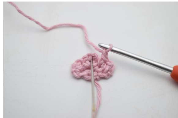
8. In the ch2-sp from last row, work 1 sc, ch 2, 1 sc..