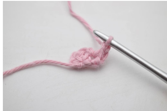
4. Ch 1.