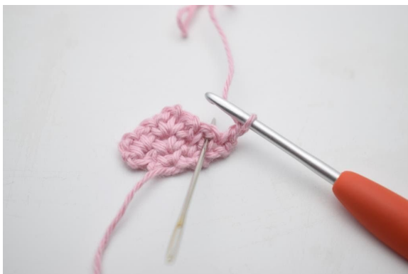
5. Sc into the ch-sp from last row.