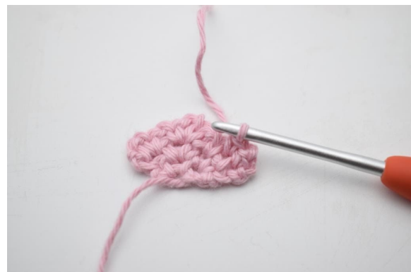
6. Like so.