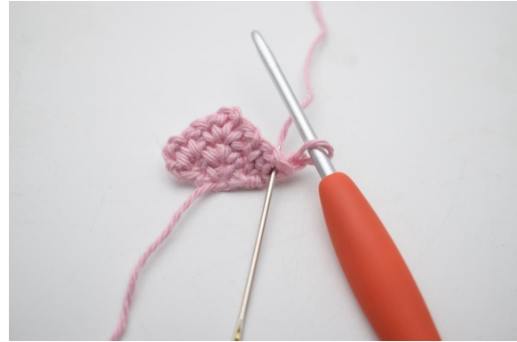
2. Sc into the first st.