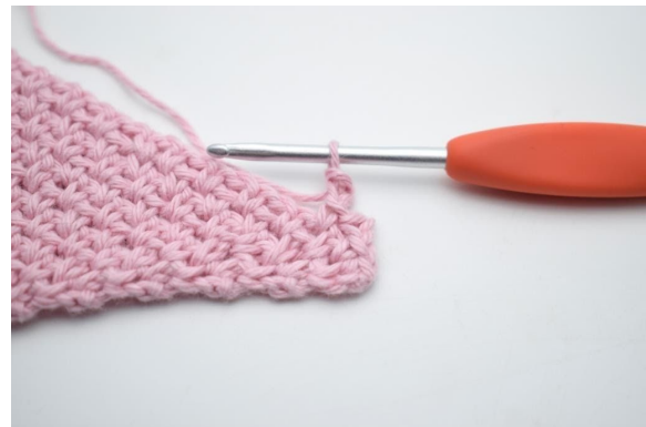
10. Like so.