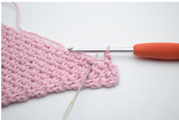
11. Skip 1 st and sc into the next ch-sp*.