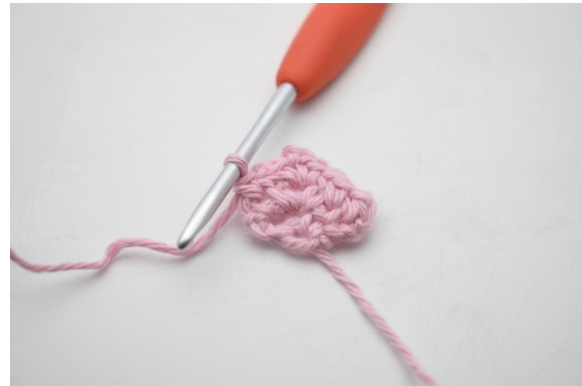
12. Like so.