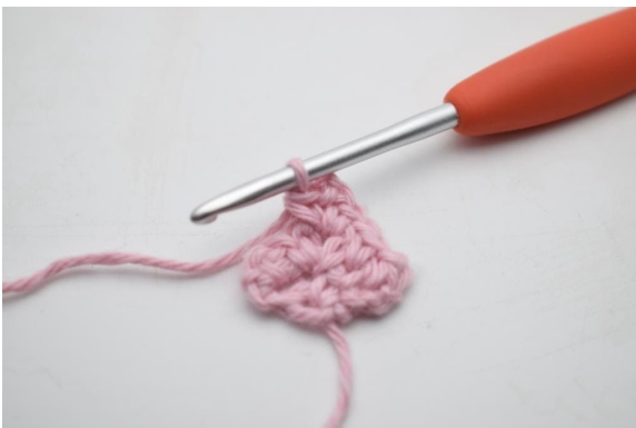
9. Like so.