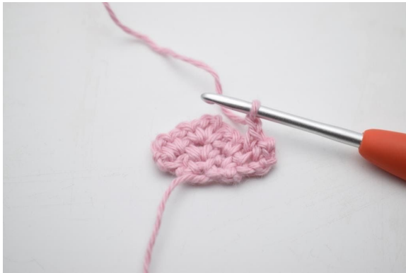
7. Ch 1.