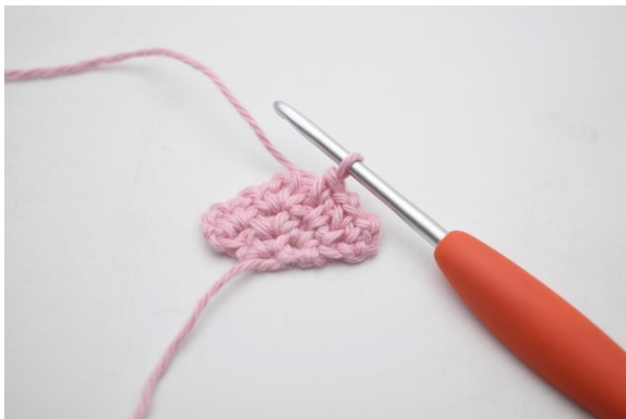
9. Like so.