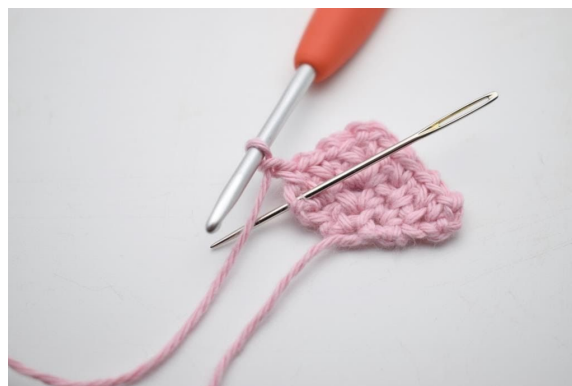
20. Sc into the last st.