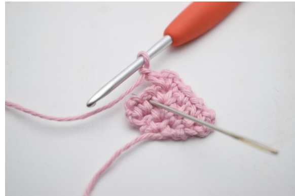
14. Sc into the ch-sp from last row.