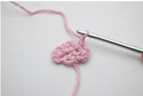
7. Ch 1.