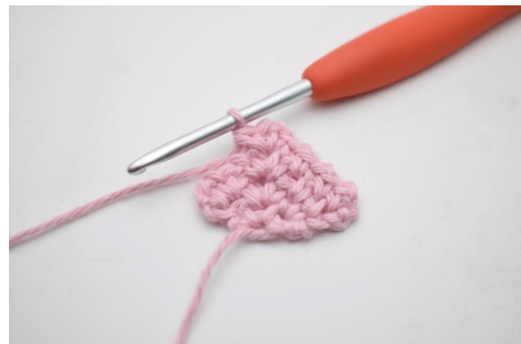
12. Like so.