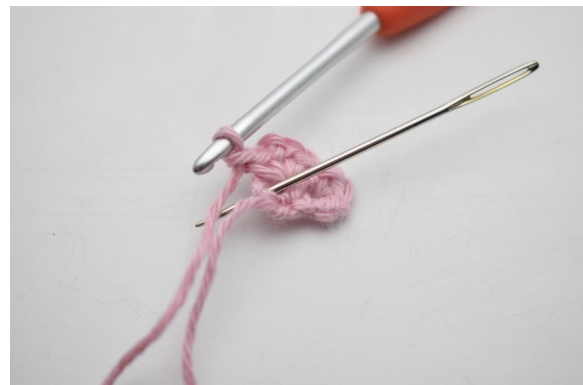
8. Sc into the last st.