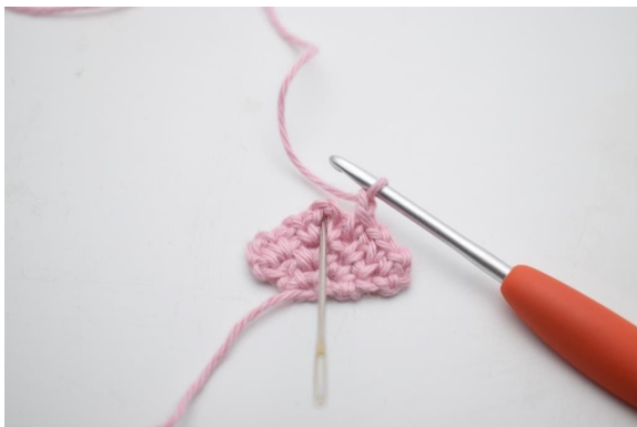
11. In the ch2-sp from last row, work 1 sc, ch 2, 1 sc.