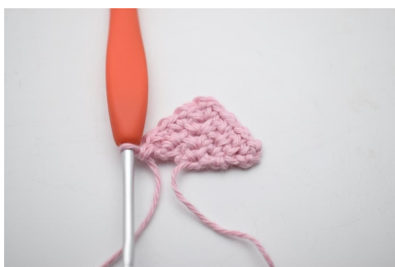
21. Like so.