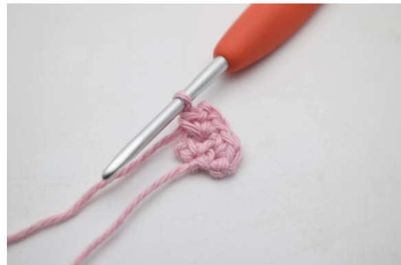
6. Like so. This will be the point of the bib.