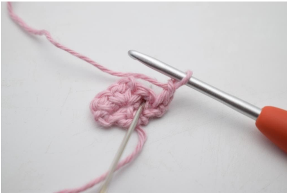
5. Sc into the ch-sp from last row.