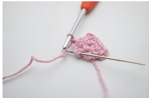
14. Sc into the last st.