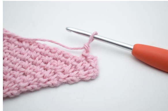
8. *Ch 2