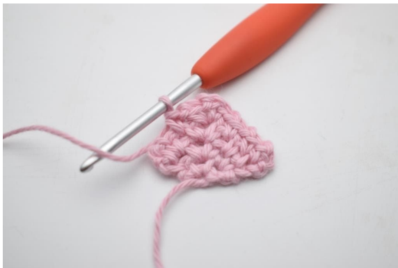
15. Like so.