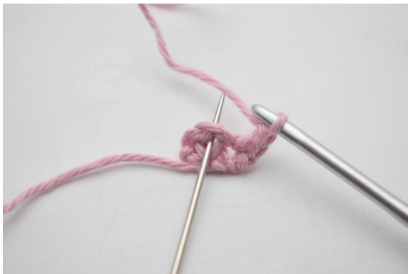
5. In the ch2-sp from last row, work 1 sc, ch 2, 1 sc.