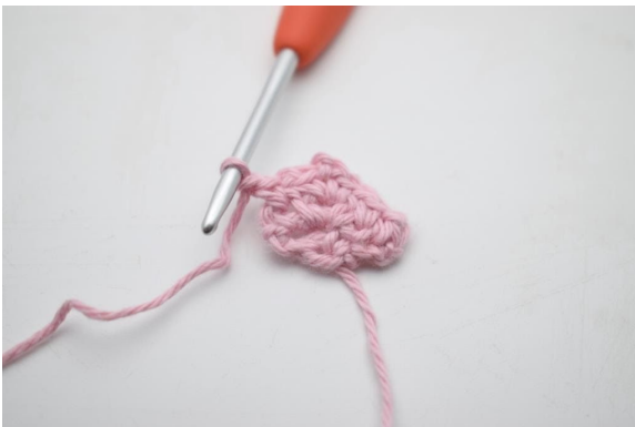
13. Ch 1.