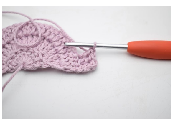
4. Dc in the next 2 sts.