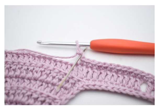
5. SI st in the 2nd st from the hook.

Or make a picot edge along the lower edge of the bib like so: