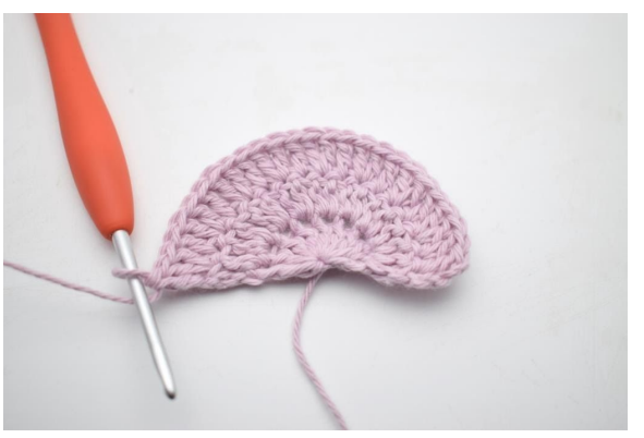
6. Repeat between ** to end of row (27)