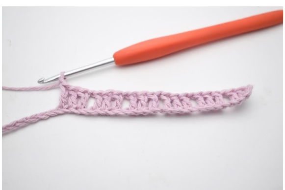
6. Repeat between ** 5 times in total.