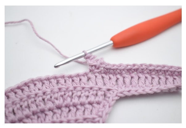
11. Skip 1 st.