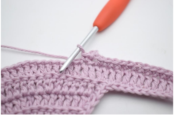
8. Like so.