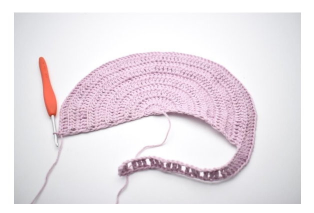
9. Repeat between ** to end of row.