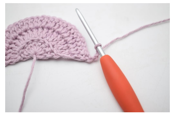
1. This row is worked in bl. Ch 3 and turn work.