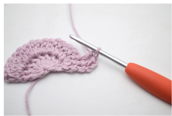
4. Dc in next st.