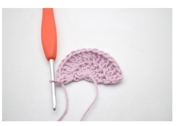
4. make 2dc in every sts to end of row. (18)