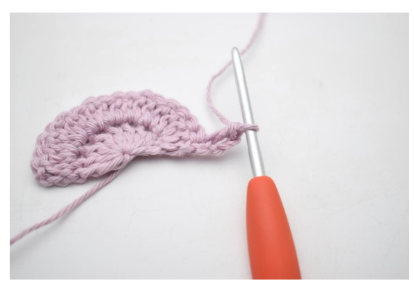
3. Like so.