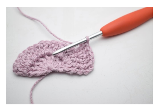
5. *2 dc in next st, 1 dc in next st *.