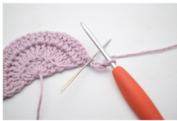
2. Dc in same st.