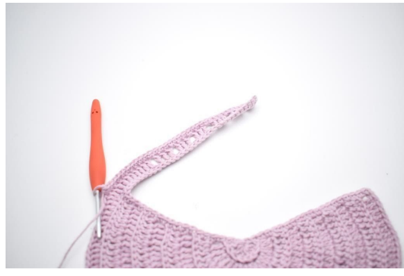
3. When you have worked around the "snip", you can continue sc all around the edge, end with a sl st into the first sc.