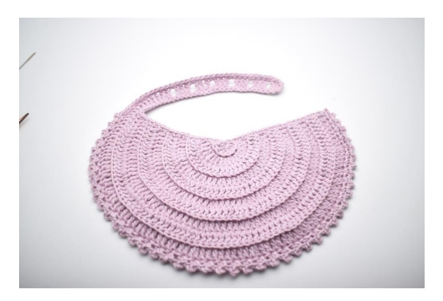
15. Like so. Cut yarn, weave in ends and sew on button.