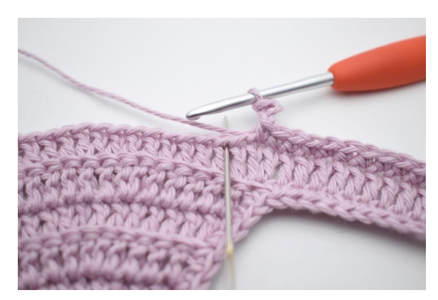
7. Skip 1 st, sc into the next st.