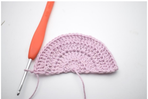
6. Repeat between ** to end of row. (36)