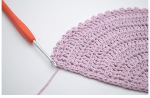
14. * Ch 2, sl st into the 2nd st from the hook, skip 1 st, sc in next st *. Repeat between ** around the edge and end with a sl st into the first sc of the top edge..