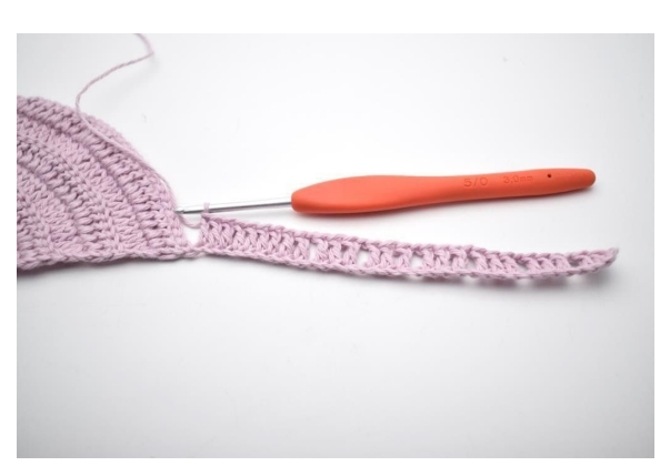
7. Ch 1, skip 1 st and dc in the next 9 sts.