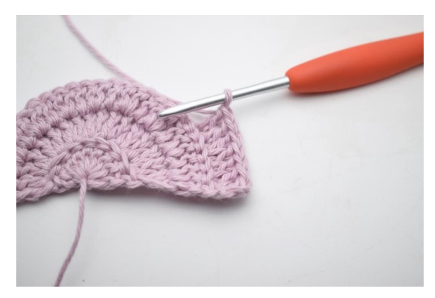
5. * 2 dc in next st, dc in next 2 sts *.