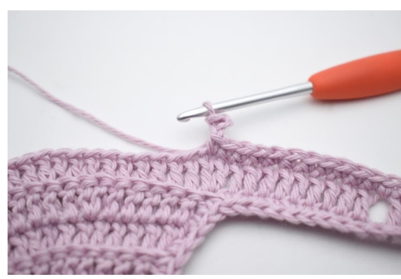
6. Like so.