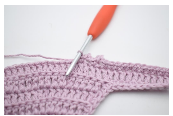
13. Like so.