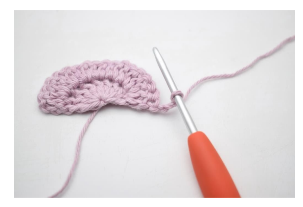
1.Ch 3 and turn work.