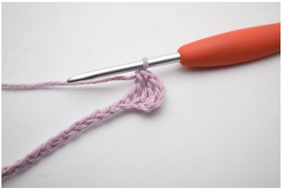
4. Dc in the next stHækl 1 stgm i næste lm.