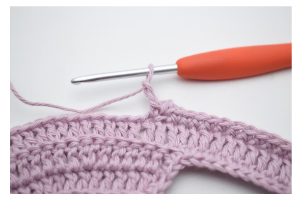
9. Ch 2.