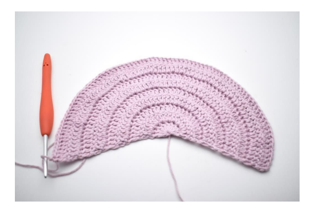
1. Ch 3 and turn work. 1 dc in the same st. 1 dc in each of the next 7 sts, *2 dc in next st, dc in next 7 sts *. Repeat between ** to end of row. (81)