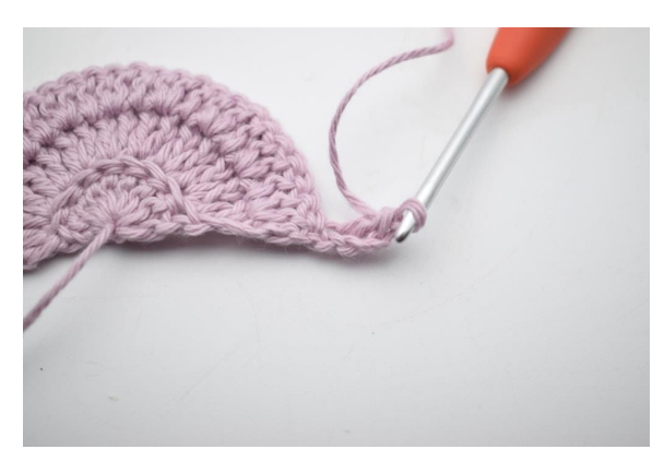
3. Like so.