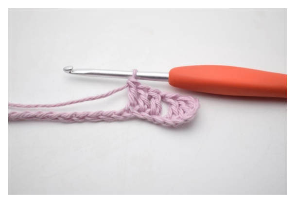
5. * Ch 1, skip 1 st and dc in the next 3 sts