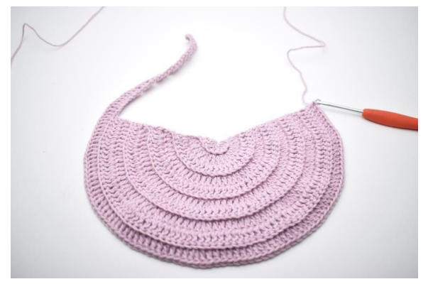
Do NOT turn work, but adjust the angle a bit. Ch 1.