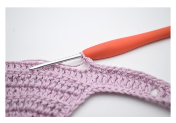
4. Ch 2,

Or make a picot edge along the lower edge of the bib like so: