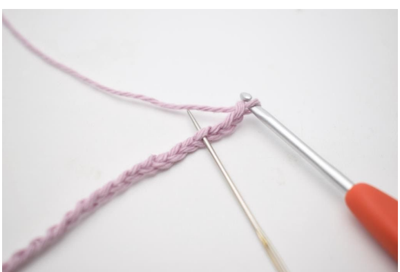
2. Dc in the 4th st from the hook.