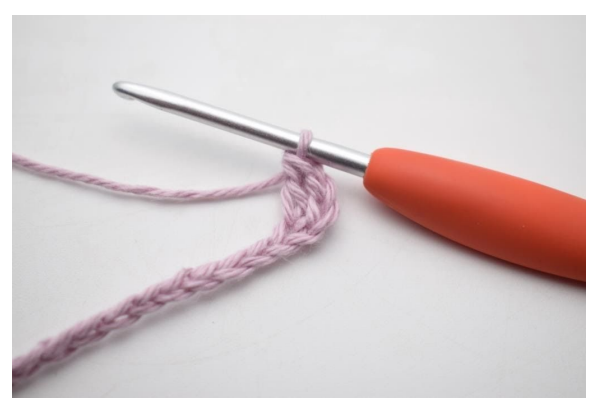
3. Like so.