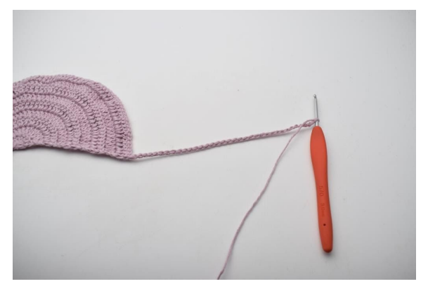
1. Turn work and ch 35.