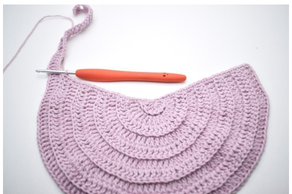
2. Sc around the top edge of the bib and the buttonhole "snip" (along the neckline).