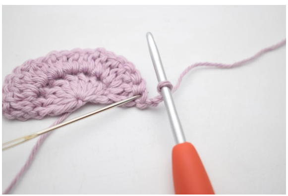
2. make 1 dc in same st.