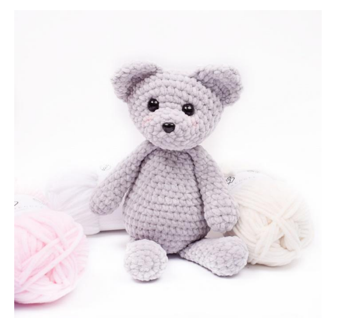
Have fun making 😳 Kindest regards Hobbii.com