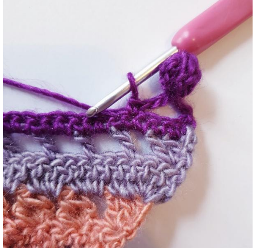
Skip 4 sts, 1 sc