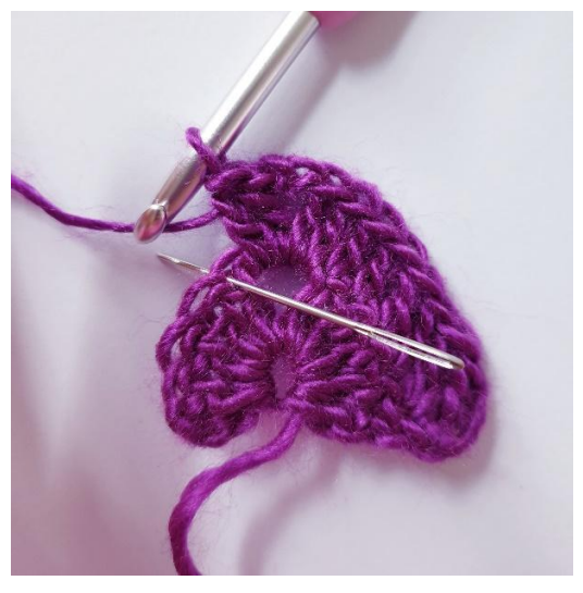
[2 dc, ch 2, 2 dc] in the tip