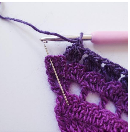
[ch 2, skip 2 sts, puff] rep around