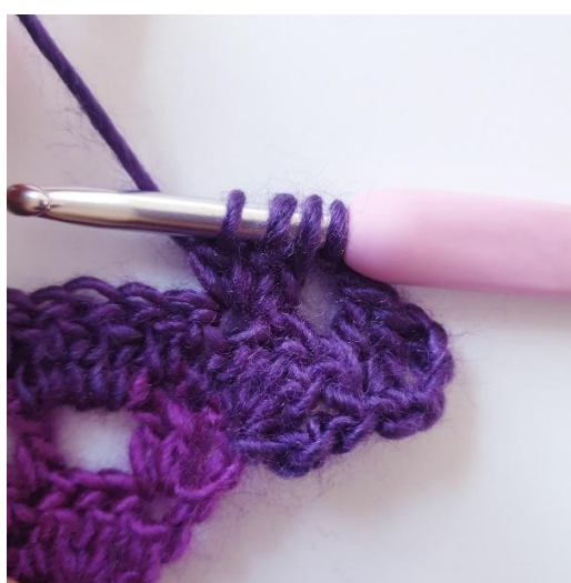
Rep 5 times in the same sts.