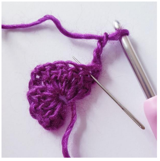
Close the ring a bit more