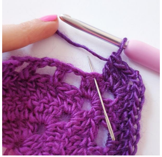
[2 dc, ch 2, 2 dc] in the tip