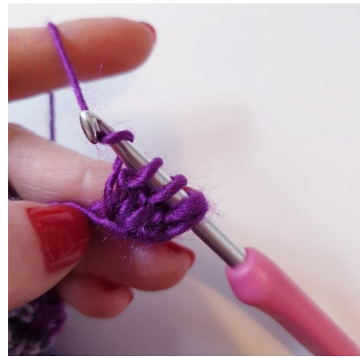
Yo and pull the yarn through all 4 loops on the hook.