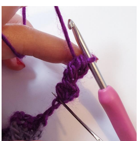
Now you have two puff sts, fold the top one down