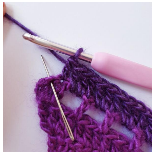
1 dc in the next 2 sts