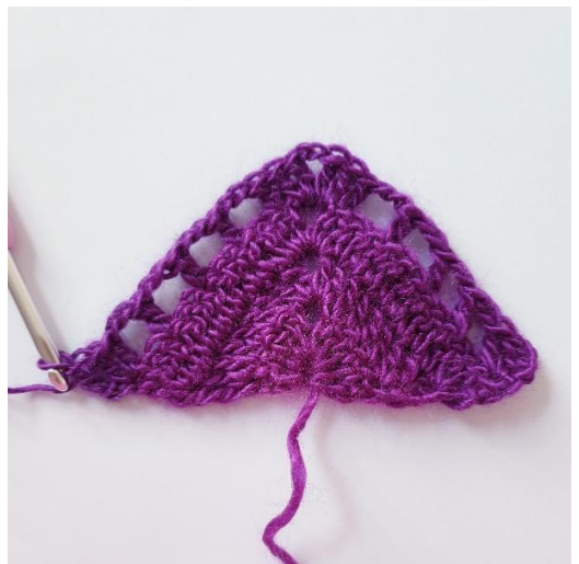
After rnd 4