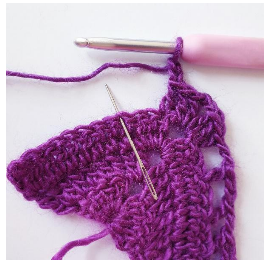
[1 dc, ch 2, skip 2 sts] rep around.