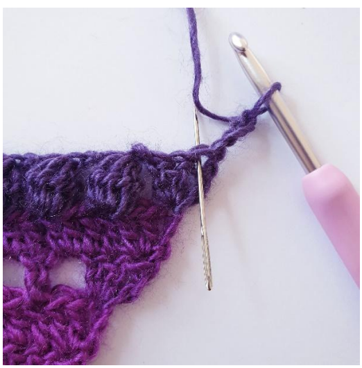
Rnd 7: 2 dc in first st