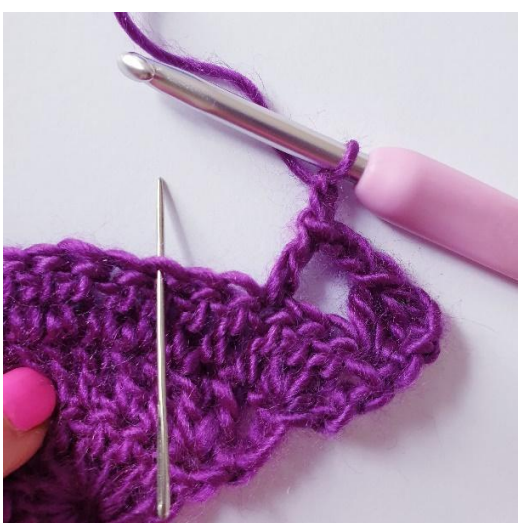
1 dc] rep to the tip