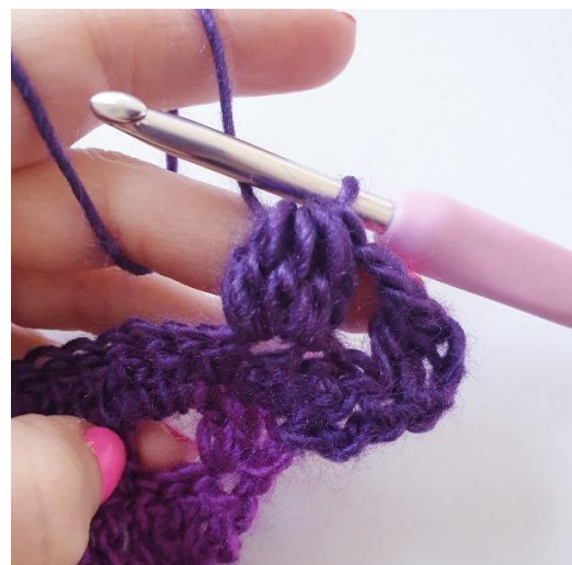
Yo and pull the yarn through all 6 loops on the hook.