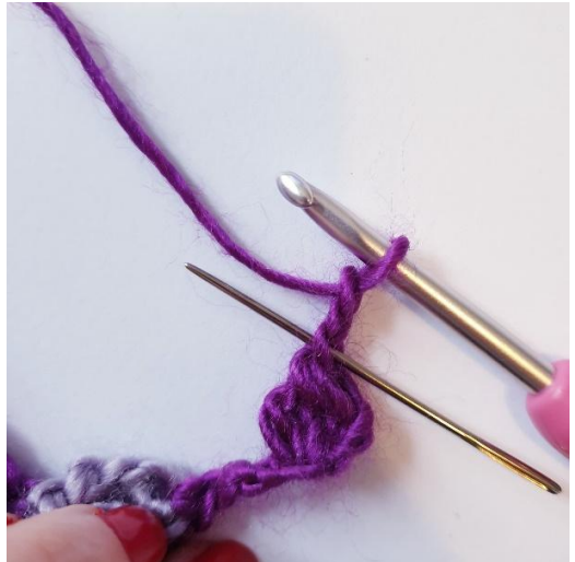
In 3rd ch from the hook [yo and put through the st, pull yarn along through the st, yo and pull yarn through the two loops] 3 times in same st