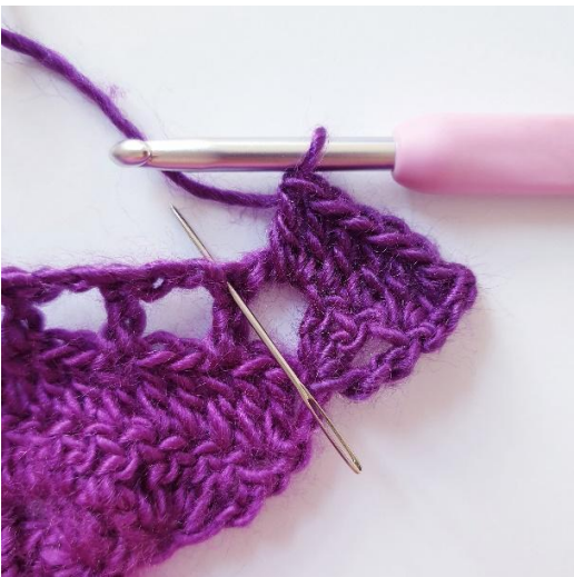
[2 dc in the ch space, 1 dc in next st] rep to the tip