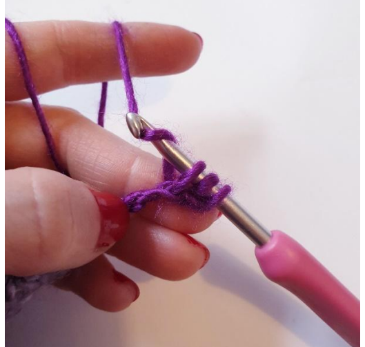
Ch 6. In 3rd ch from the hook [yo and put through the st, pull yarn along through the st, yo and pull yarn through the two loops on the hook] rep 3 times in same st.