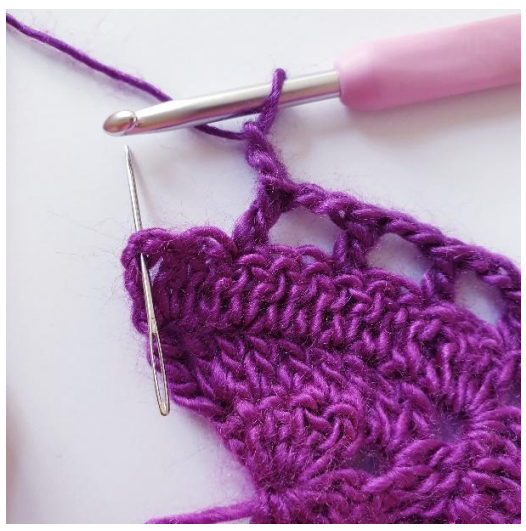
[2 dc, 1 tr] in t-ch