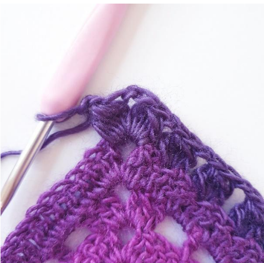
[puff, ch 2, puff] in the tip