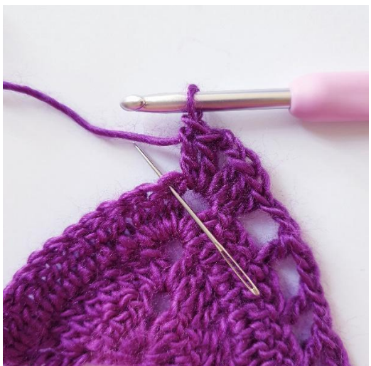
[2 dc, ch 2, 2 dc] in the tip