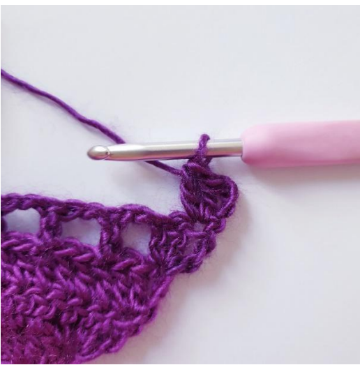
Rnd 5: 2 dc in first st