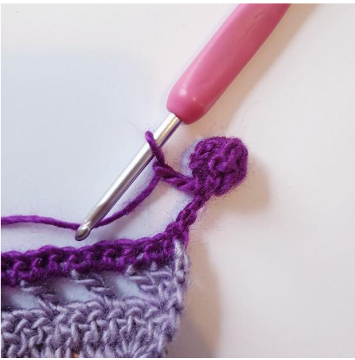
And attach with 1 sl st in the bottom of the ch 3, first puff st