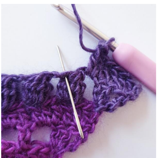
[2 dc in the ch space, 1 dc in next st] rep to the tip