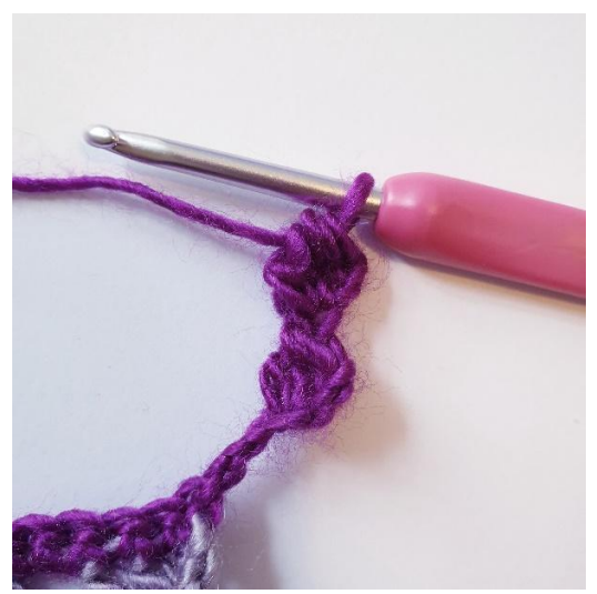
Yo and pull the yarn through all 4 loops.