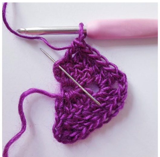
[2 dc, 1 tr] in t-ch