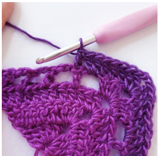
[2 dc in the ch space, 1 dc in next st] rep until you have 2 sts and t-ch left.