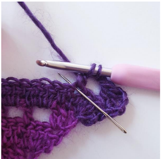
Puff st: [yo and put through the st, pull yarn along through the st, yo and pull yarn through the two loops on the hook]