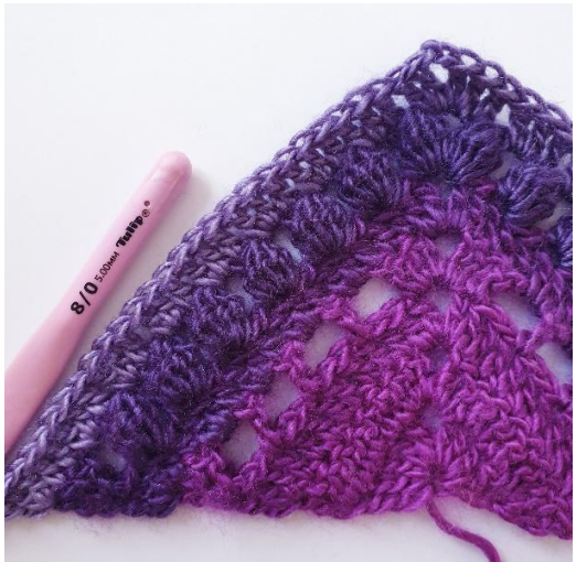
[1 dc in next st, 2 dc in the ch space] rep until you have 2 sts and t-ch left, 2 dc, [2 dc, 1 tr] in t-ch, ch 4 and turn