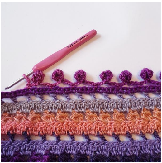
Rep [] around