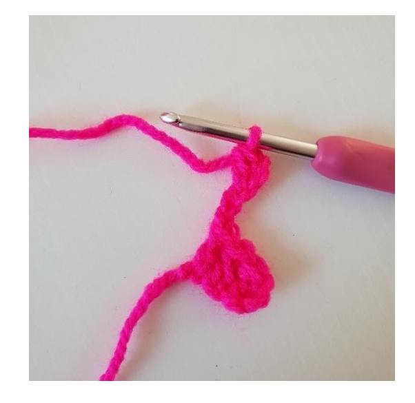
2. Make 1 dc in the 3rd ch from the hook.