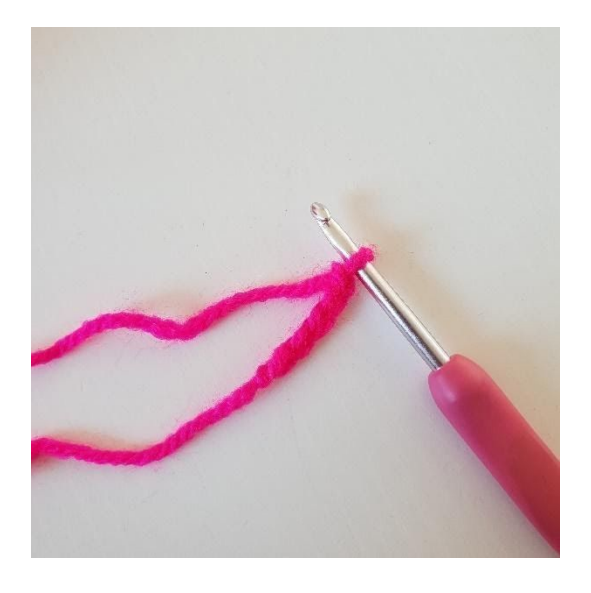
1. Begin with ch 5.