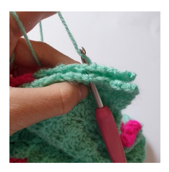
2. Pull the yarn up through 2 pixels.