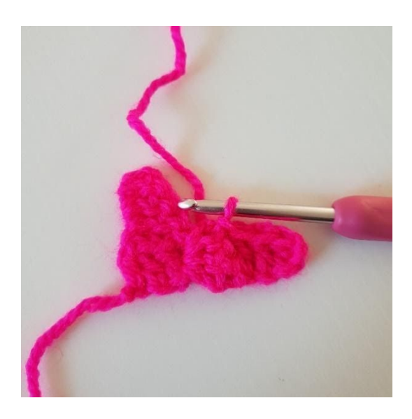
3. Make 1 sl st into the corner of the pixel below.