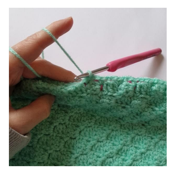
5. Repeat this pattern of ch 2, sl st between pixels.