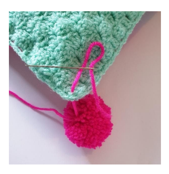
Sew a pom-pom to each corner of the pillow.