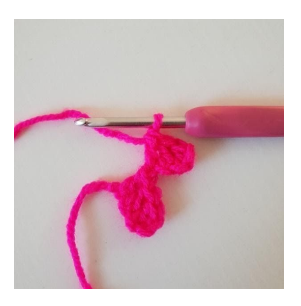
3. Make 1 dc in each of the next 2 sts. You have now made your next pixel/square.