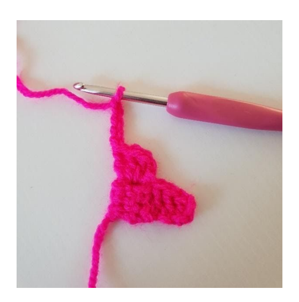
1. Ch 5.