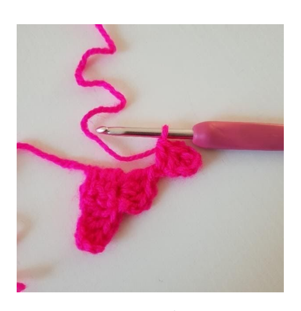
2. Make 1 dc in the 3rd st from the hook and then 1 dc in each of the next 2 sts.