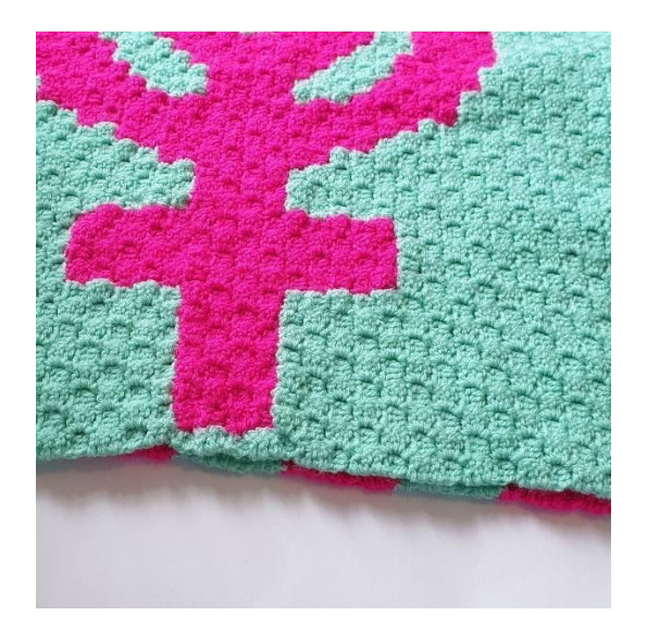
1. Lay the two pieces on top of each other, wrong sides together.