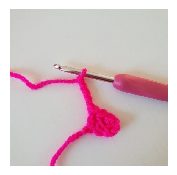
1. Ch 5.