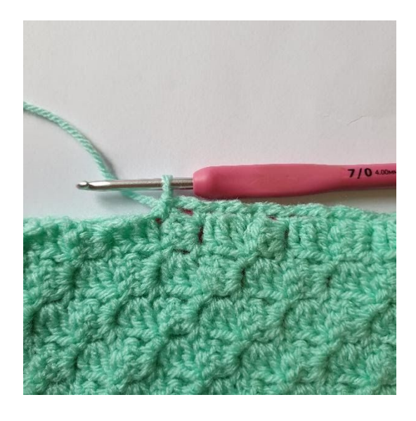
4. Make a sl st between the next 2 pixels.