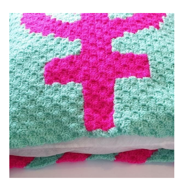
7. Place the pillow into the pillowcase. Continue closing up the seam of the pillowcase and end with a sl st.