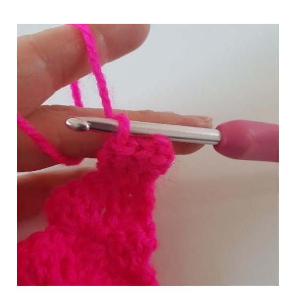
2. Continue making pixels in the same manner as before.