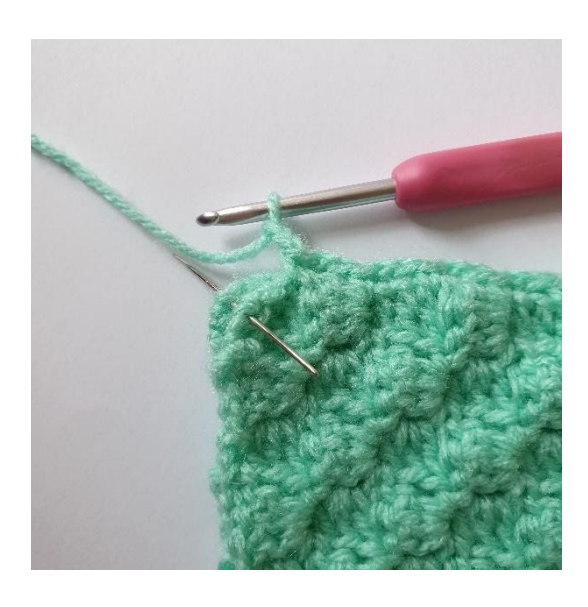
6. Make 1 sc in the corner. Continue with ch 2, sl st all around the pillowcase.