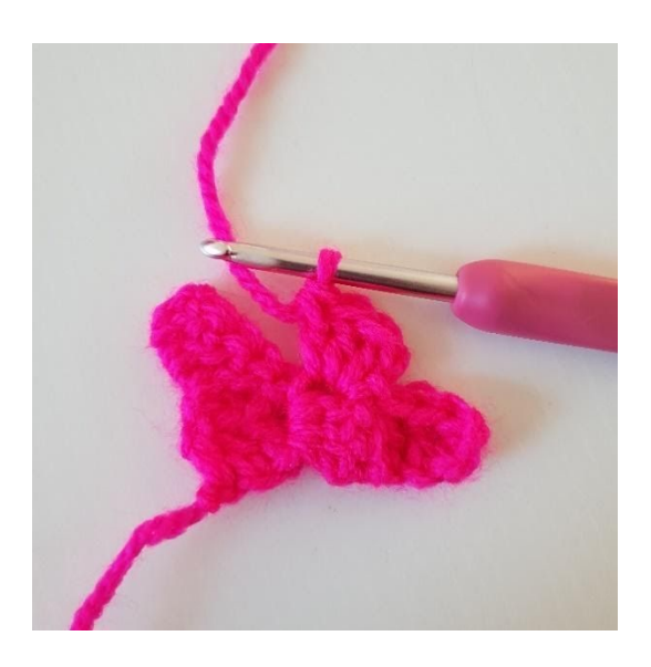
4. Ch 2 and make 3 dc into the ch-sp you made your sl st into.