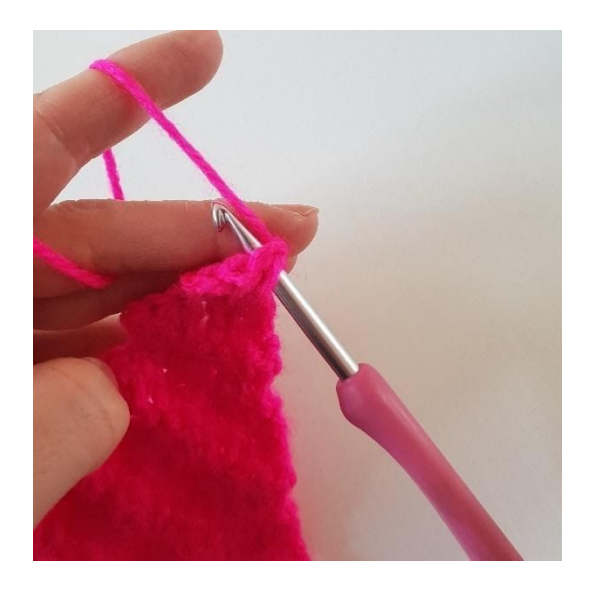
1. Instead of ch 5 at the end of the row, make 3 sl sts along the edge of the last pixel.