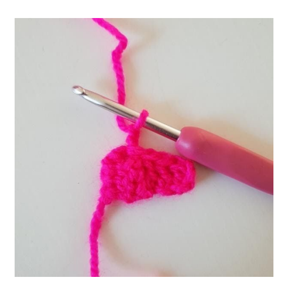
5. Ch 2 (takes the place of the 1st dc)