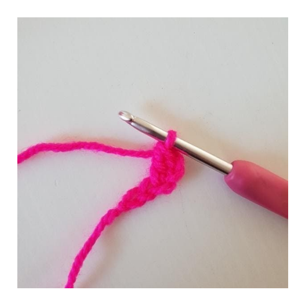
2. Make 1 dc in the 3rd ch from the hook.