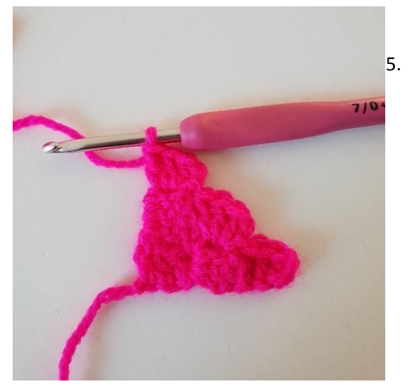
Make a sl st into the pixel beside it. Ch 2. Work 3 dc into the ch-sp you made your sl st into. You now have 3 pixels and row 3 is done.