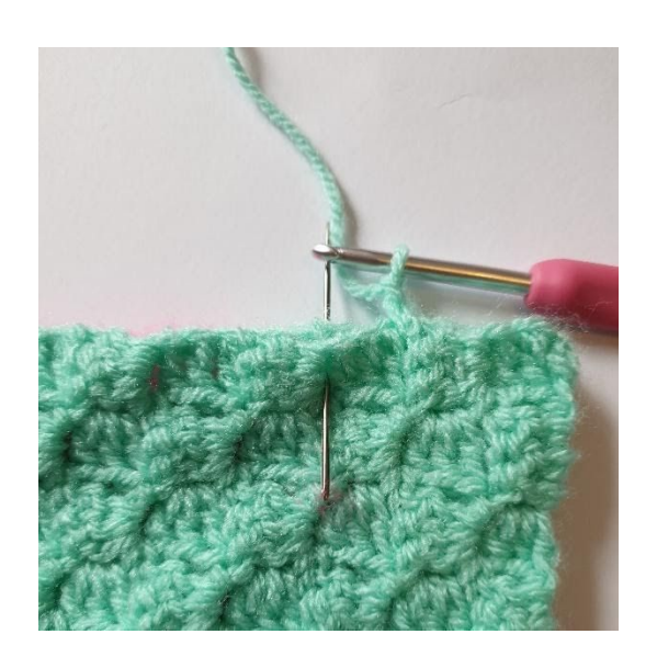
3. Ch 2.