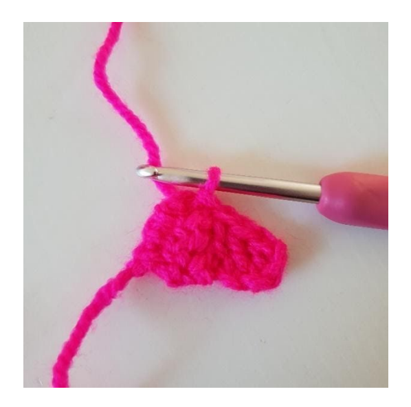
4. Now, the pixel is connected to the first one. Do this by turning the pixel and making 1 sl st into the left corner of the first pixel. The picture shows the connected pixels.