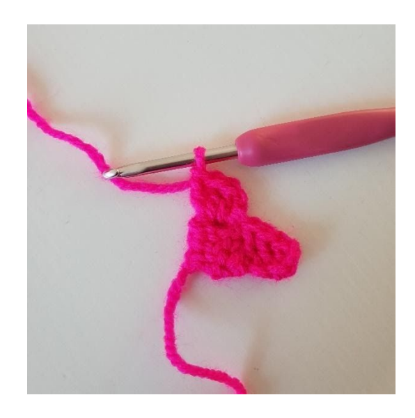
6. Make 3 dc around the ch-sp you just made your sl st into. You now have 2 pixels on the second row.