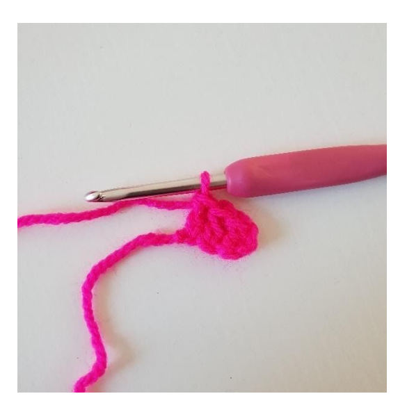
3. Make 1 dc in each of the next 2 sts. You have now made your first pixel/square.