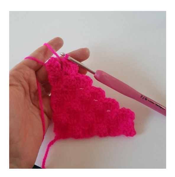
3. Here, you can see how you decrease at the end of a row by connecting the pixels with a sl st.