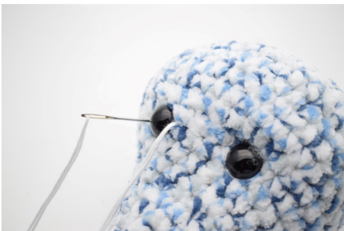
5. Press the needle down on the other side of the eye.