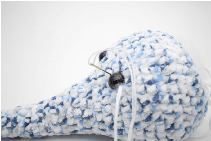
3. Press the needle down on one side of the eye and pull tight.