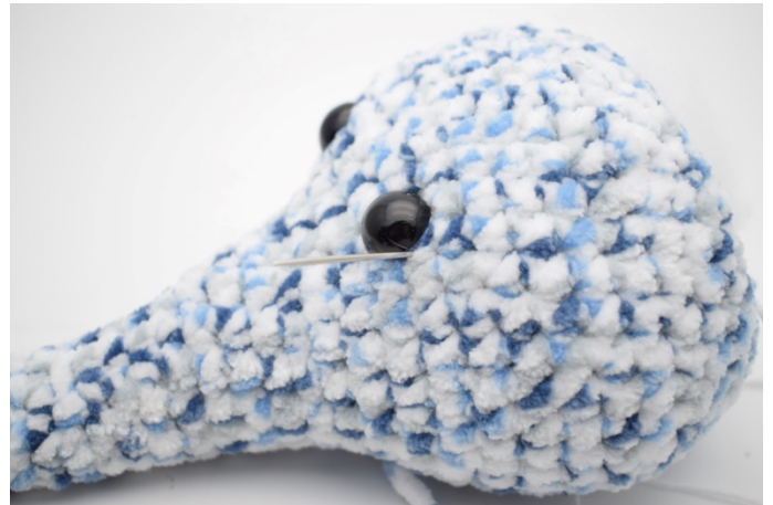
2. Make indents with a needle and white cotton thread. Pull the needle out on one side of the eye.