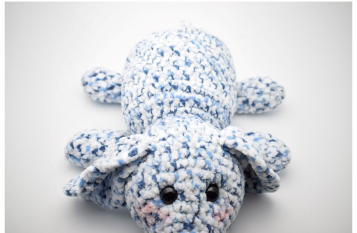
6. Like this.