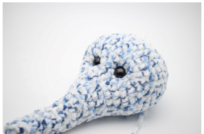
6. Pull the thread tight so the eyes are pulled back slightly and there are indents under the eyes. Weave in the yarn.