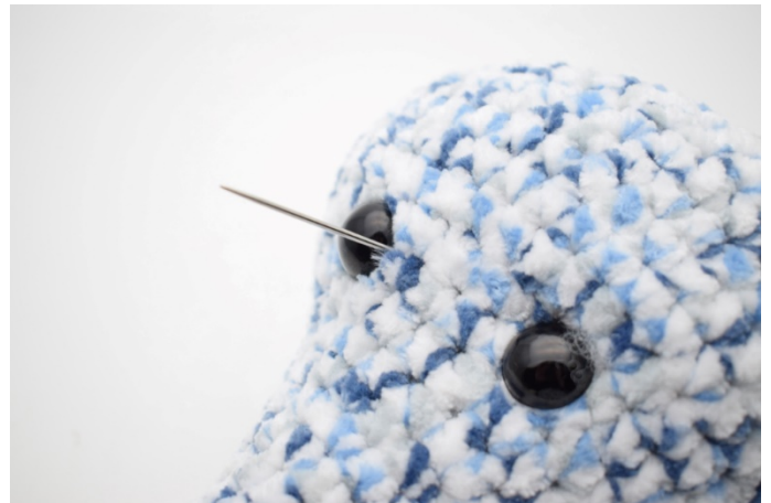
4. Pull the needle out on one side of the other eye.