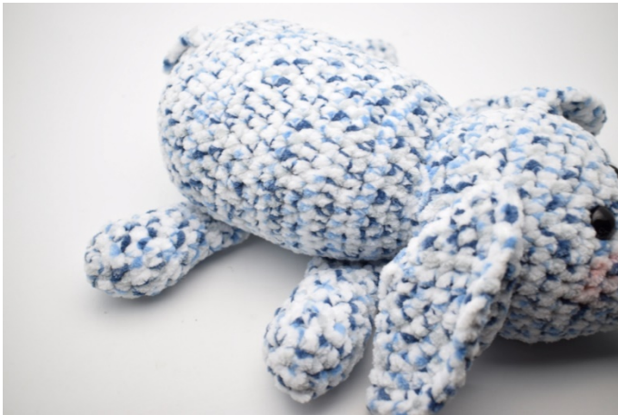
5. Sew the legs on under the stomach of the elephant.