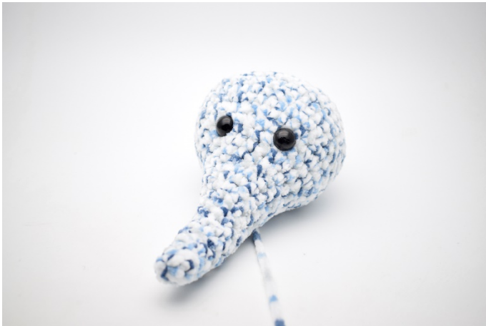
1. Stuff the trunk and the head.