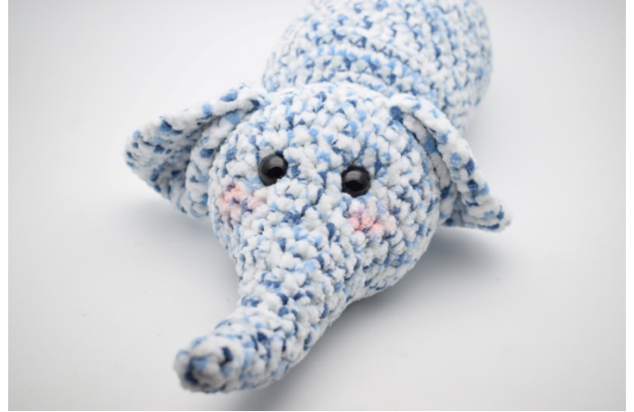
4. Give him a little blush on his cheeks.