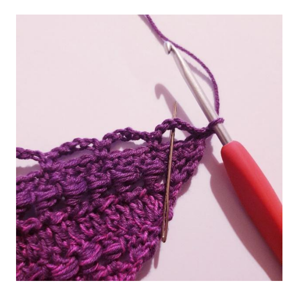
Round 2: 1 ch,