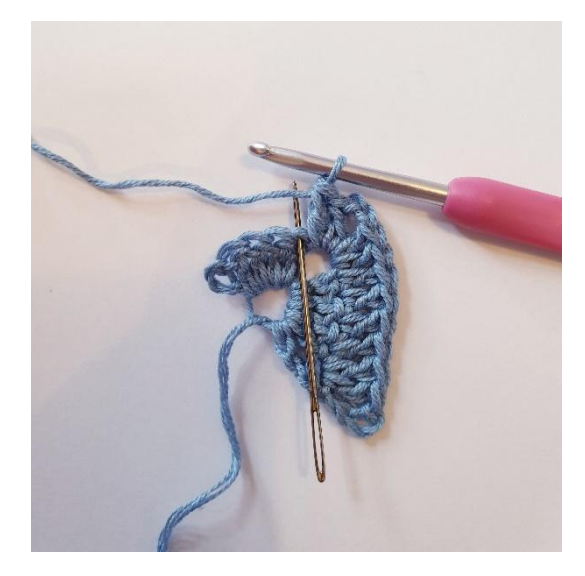
1 dc in the next 4 st.