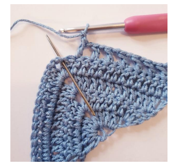
In the tip crochet 2 dc, 2 ch, 2 dc.