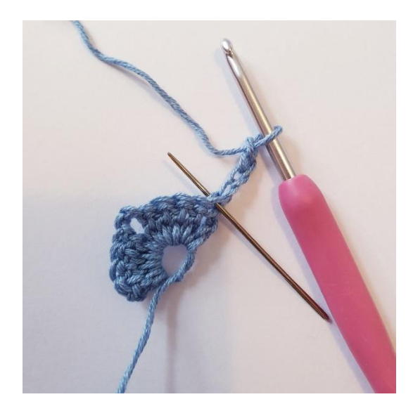
Round 2: 2 dc in the first st. 1 dc in the next 4 st