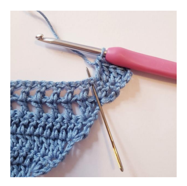
Round 7: 2 dc in the first st. 1 dc in every st.