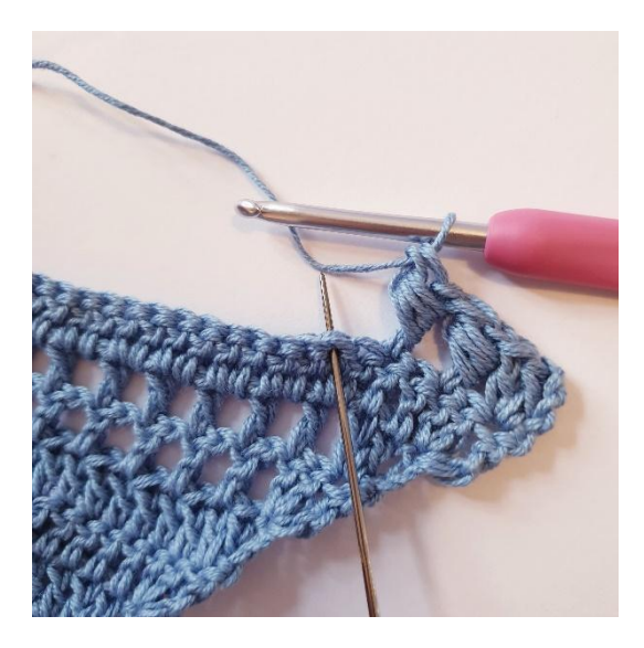
*skip 1 dc, 1 dc, puff stitch around the previous dc* repeat until the tip