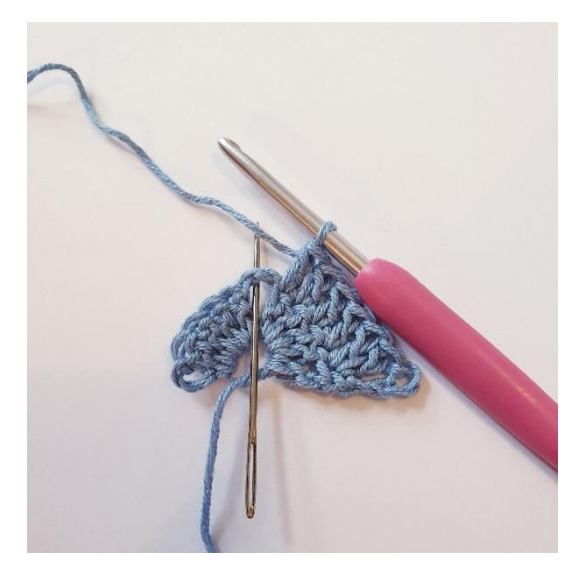
In the tip crochet 2 dc, 2 ch, 2 dc