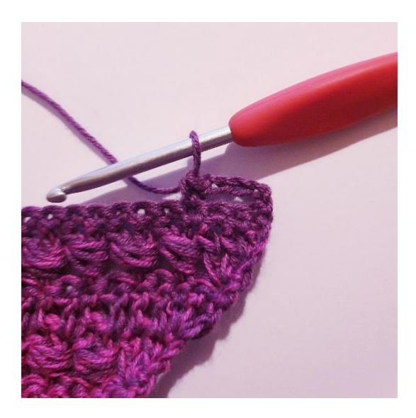
1 sc in the next st*