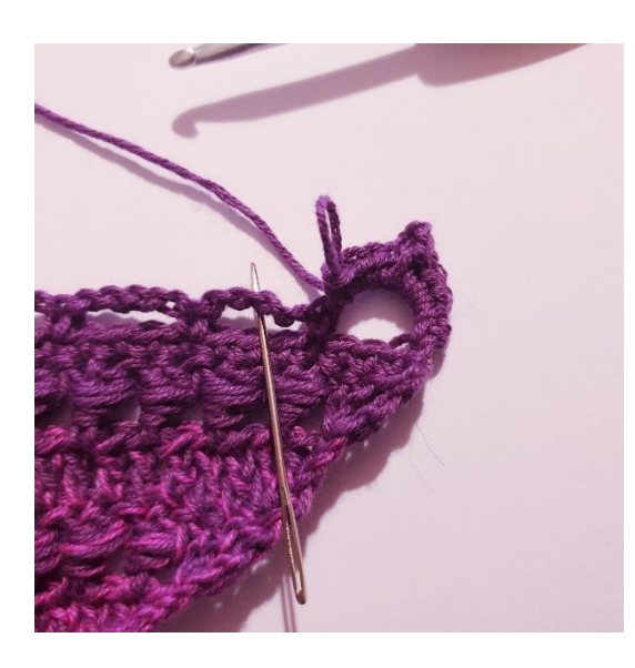
[4 sc, 3 ch, 4 sc] in the ch-sp. Repeat for the whole round.