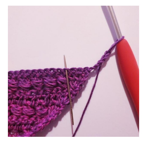
Round 1 *5 ch, skip 3 st,