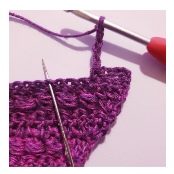
5 ch, skip 3 st, 1 sc in the next stitch* repeat until the tip. In the tip skip 5 st instead of 3.