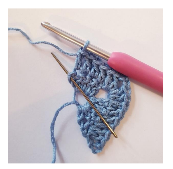
2 dc and 1 tr in the tch.