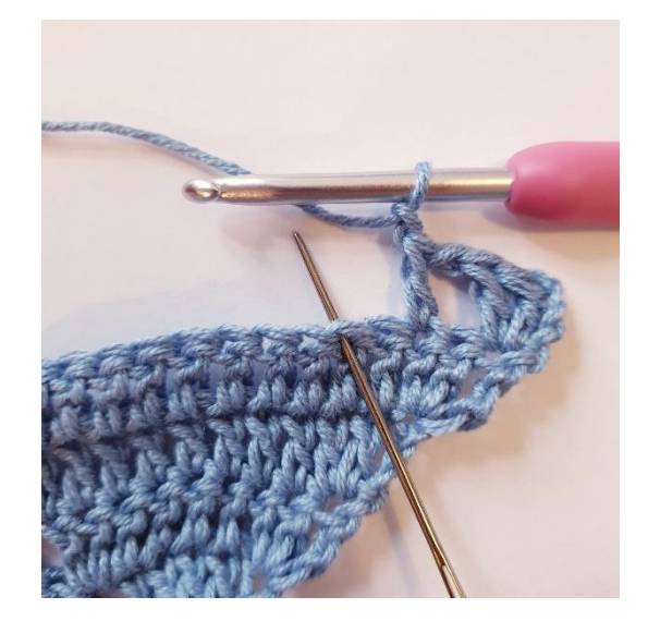
Rounds 5–6: 2 dc in the first st. *1 ch, skip 1 st, 1 dc* repeat until the tip