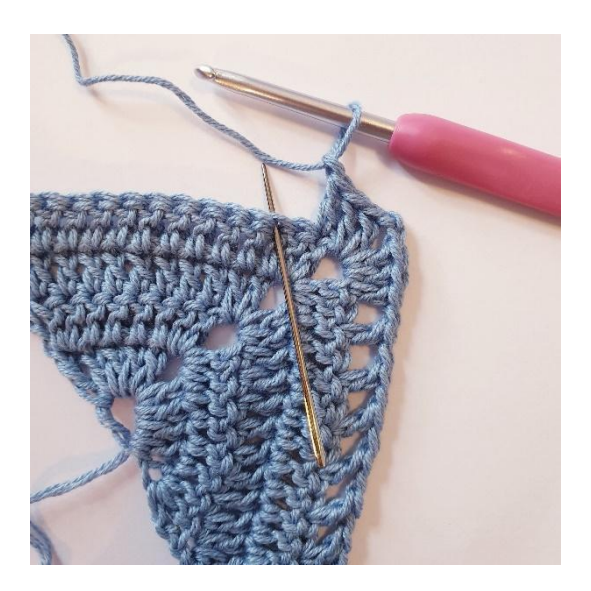
*1 dc, 1 ch, skip 1 st* repeat