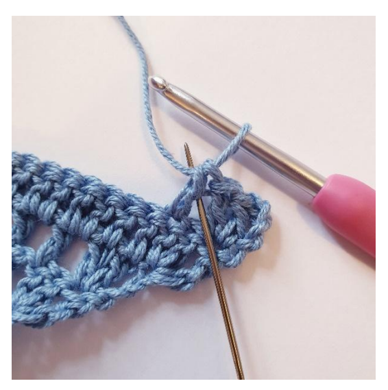
*skip 1 dc, 1 dc,