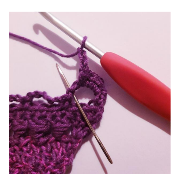
[4 sc, 3 ch, 4 sc] in the ch-sp.