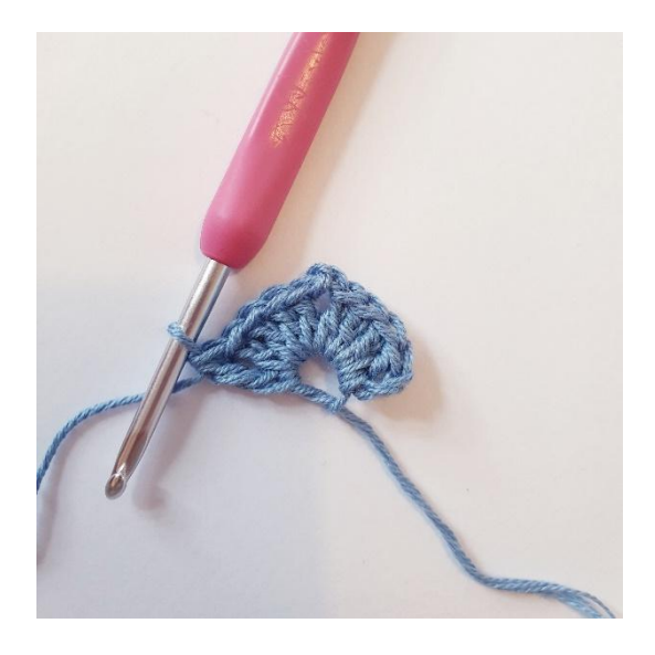
2 ch, 4 dc, 1 tr in the ring.