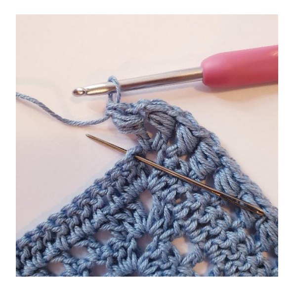
In the tip crochet 1 dc, puff stitch around the same dc, 2 ch, 1 dc, puff stitch around the previous double crochet