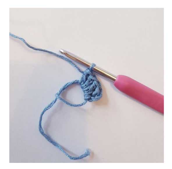
Round 1: Crochet 4 ch