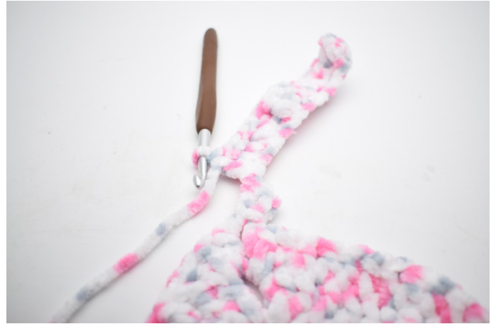
26. Crochet dc in all ch.