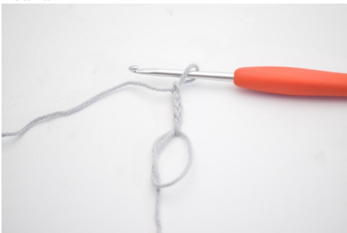
1. Make a MR. Ch 5.