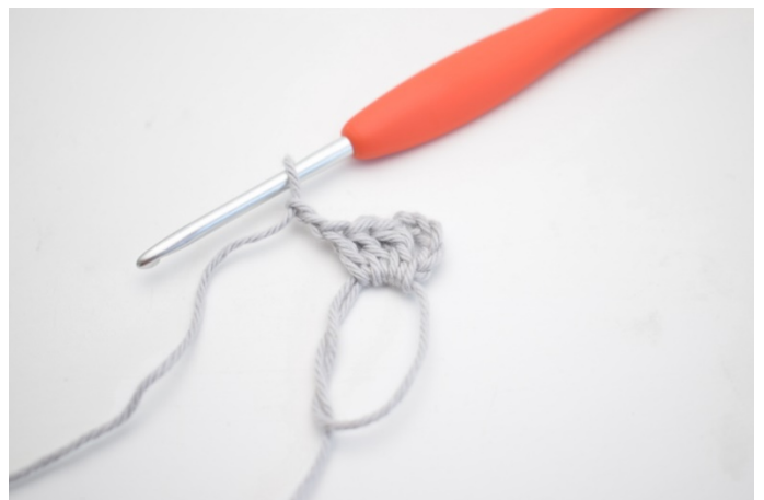
2. [3 dc, ch 3]