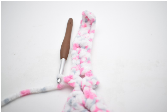
27. 2 dc in the ch-sp.