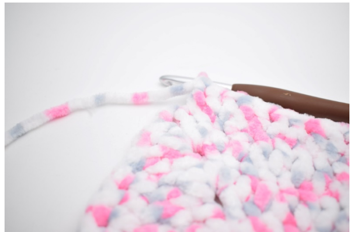
28. 1 dc in the next 79 st.