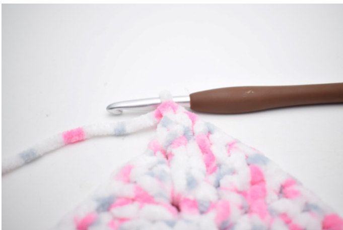
29. 2 dc in the ch-sp.