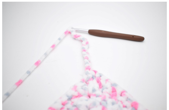
30. Ch 17, 1 dc in the 3 rd ch from the hook.