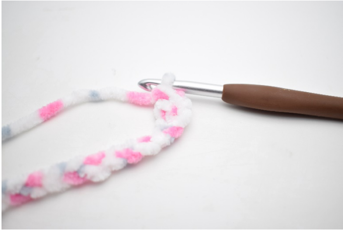
25. Like this...