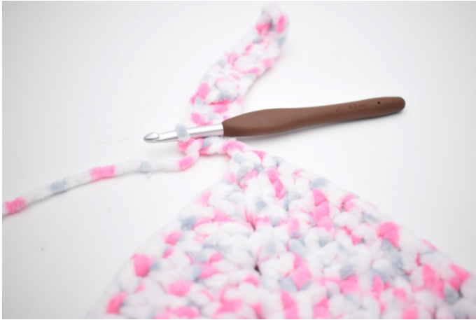
31. dc in all the ch.