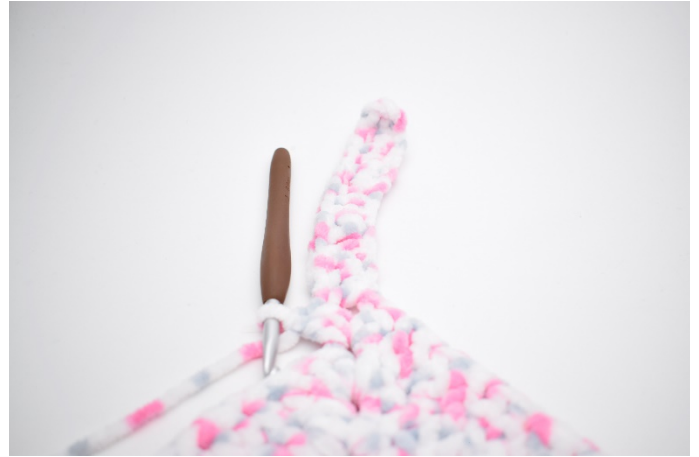
32. 2 dc in the ch-sp.