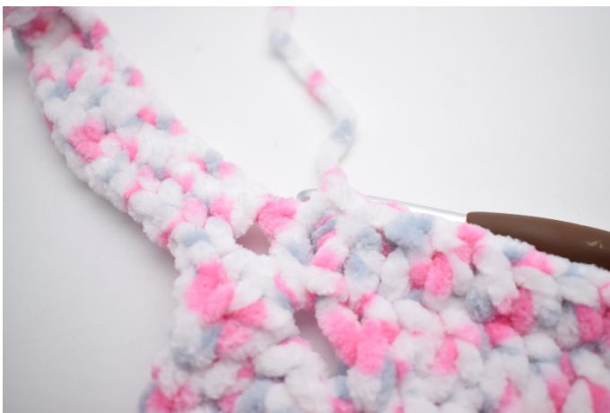
33. Repeat (steps 28-32) 3 times, 1 dc in the last 79 st, finish with 1 sl st in the 3 rd ch.