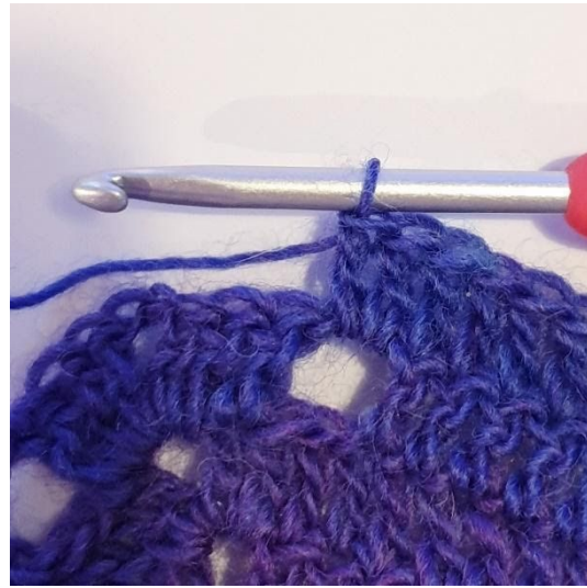
2 dc in the ch-sp