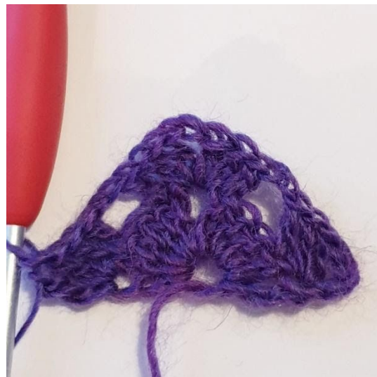
2 dc, 1 tr in the turning chain