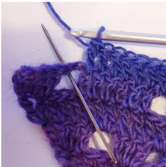
1 dc in the next 6 st