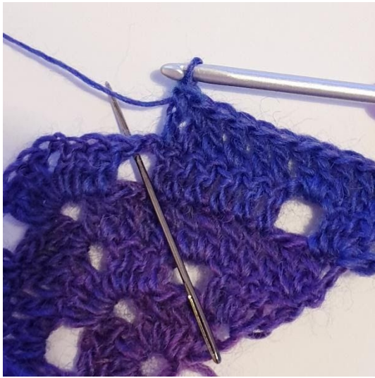
1 dc in the next 6 st