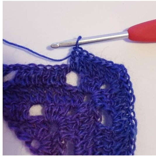
2 dc in the ch-sp