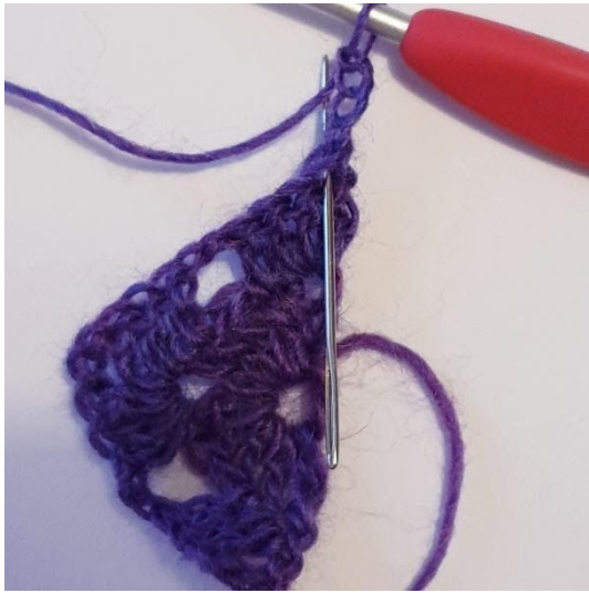
Round 3: 2 dc in the first st