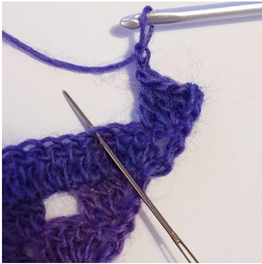
1 dc, ch 2, skip 2 st