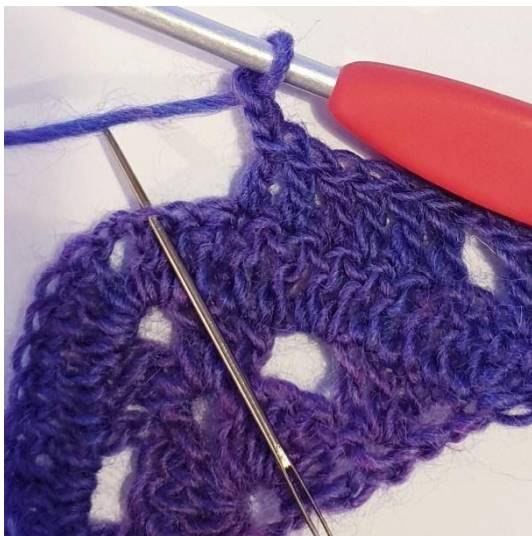
ch 2, skip 2 st