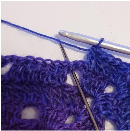
1 dc in the next 3 st