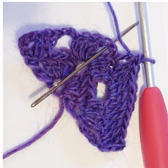
1 dc in the next 3 st, [2 dc, ch 2, 2 dc] in the tip