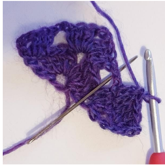
1 dc in the next 3 st,