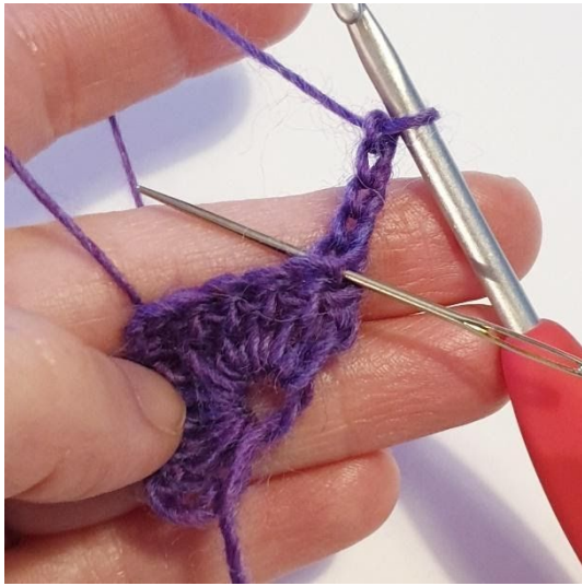
Round 2: 2 dc in the first st.