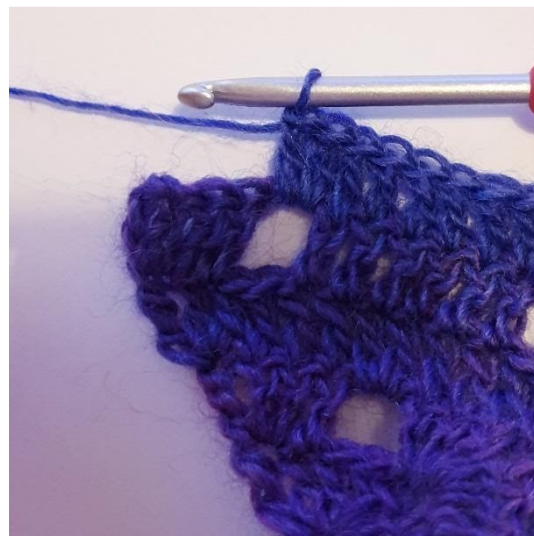
2 dc in the ch-sp