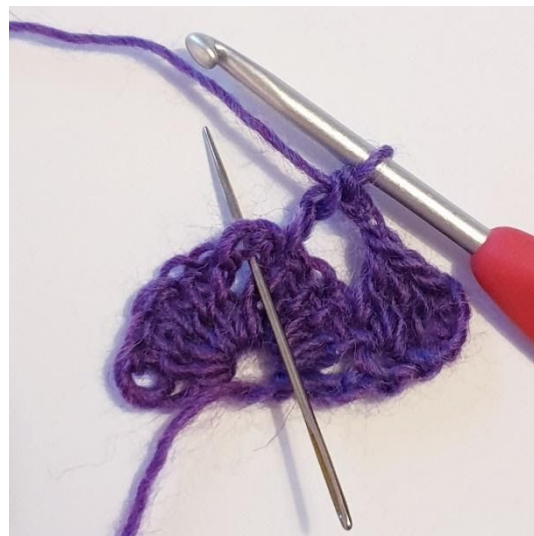
1 dc, [2 dc, ch 2, 2 dc] in the tip