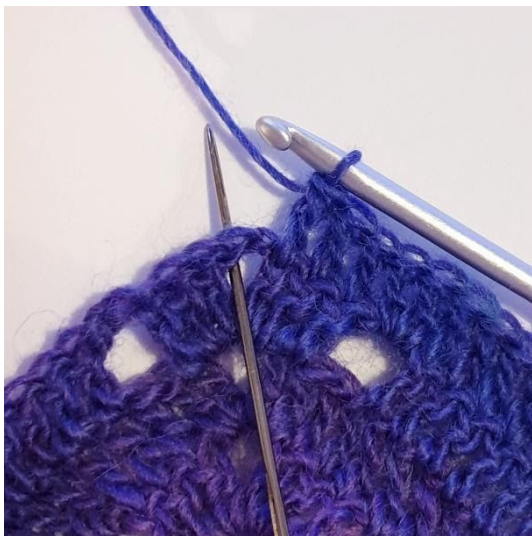
1 dc in the next 3 dc