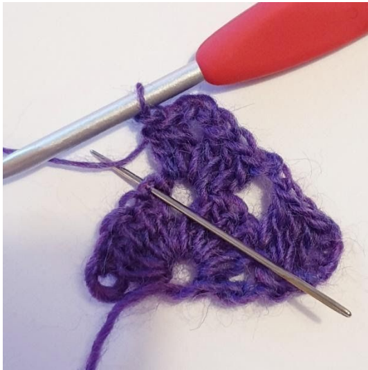
1 dc in the next st