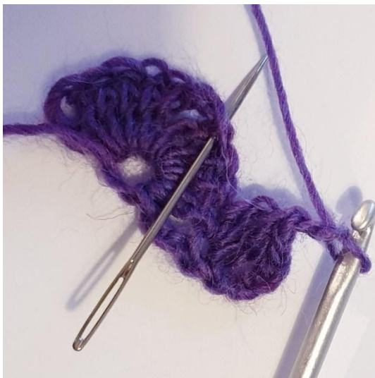
ch 2, skip 2 st