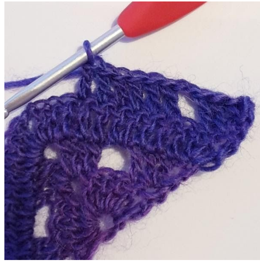
1 dc in the next 6 st