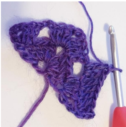
2 dc in the ch-sp