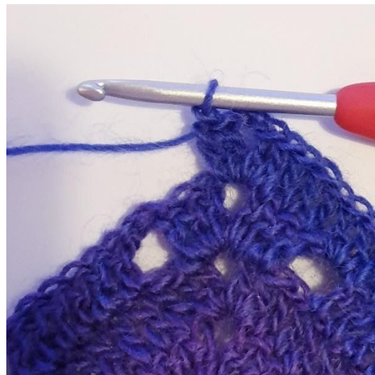
[2 dc, ch 2, 2 dc] in the tip