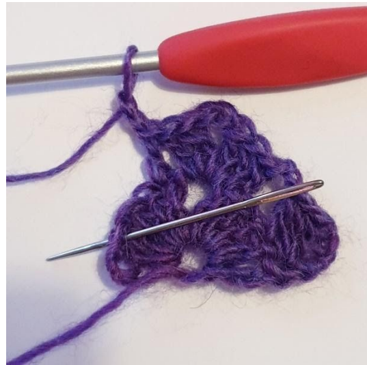
ch 2, skip 2 st