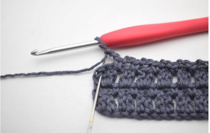
37. skip 2 sts and work 1 sc in the last s.