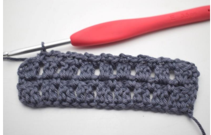
35. Repeat from "to" until you have 3 sts left.