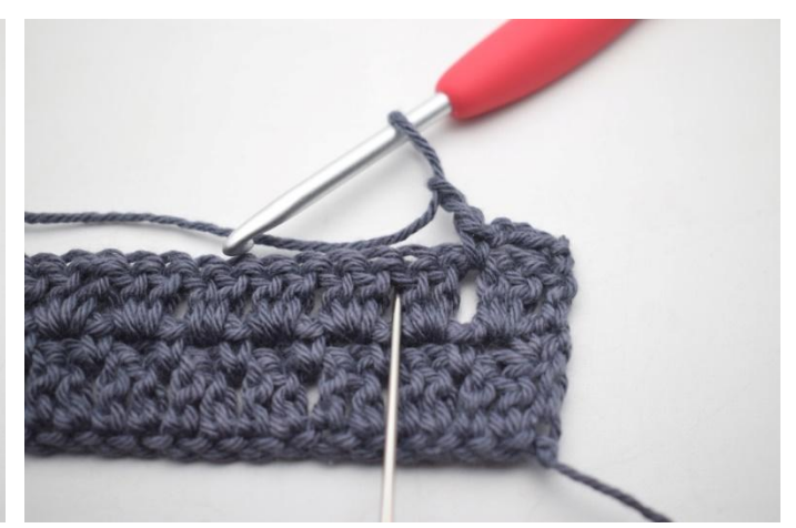
33. skip 2 sts and work 1 sc between the next 2 dc".