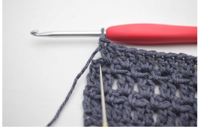
45. Work 1 dc in the last s. (68)