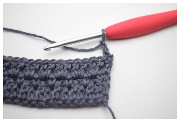
29. "Ch 2,