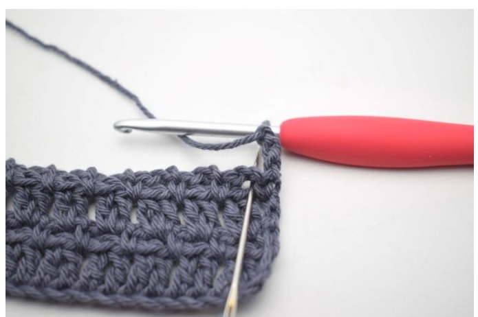
40. "Work 2 dc in the ch-space".

39. Worked just like row 3. Turn by chaining 3.