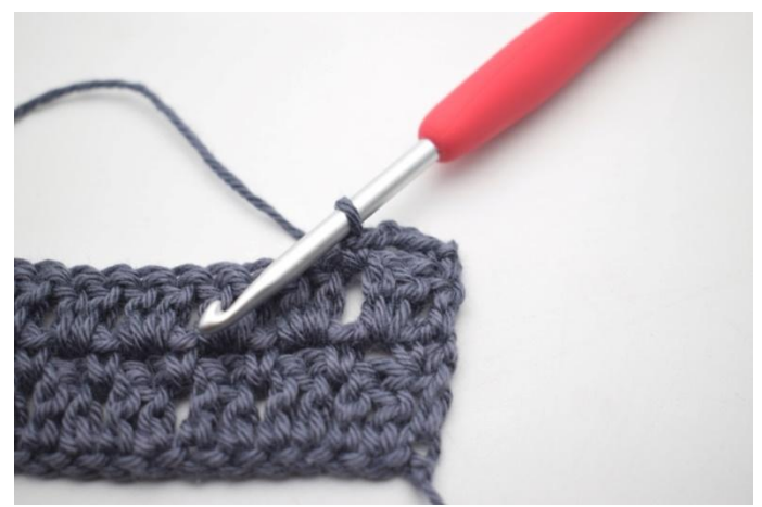
31. Like this.