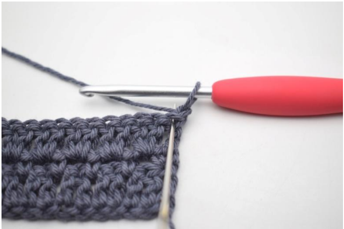
27. Work 1 sc in the first s.