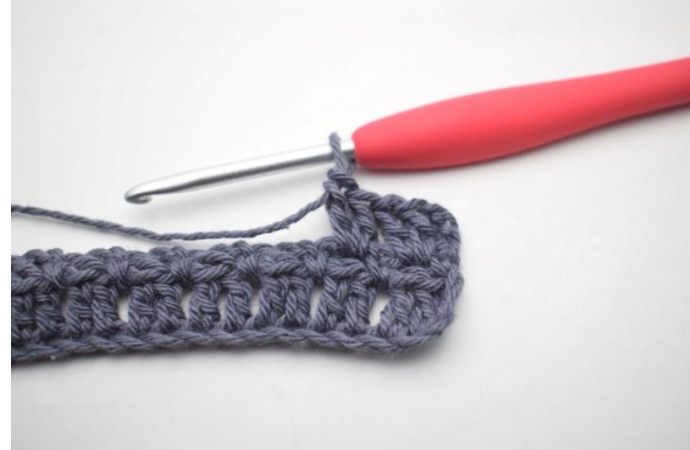
22. Like this.