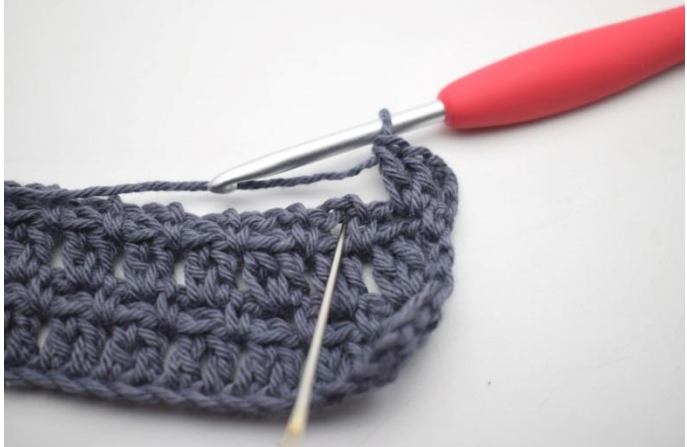
42. "Work 2 dc in the ch-space".