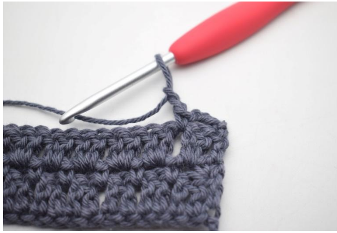
32. "Ch 2,