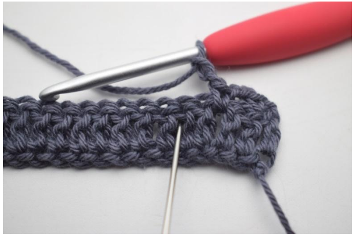
12. "skip 2 sts and work 1 sc between the next 2 dc".