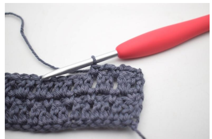
34. Like this.