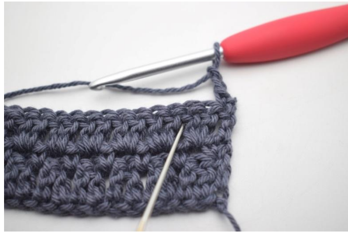
30. skip 2 sts and work 1 sc between the next 2 dc".