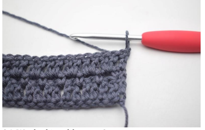
26. Worked just like row 2. Turn by chaining 1.