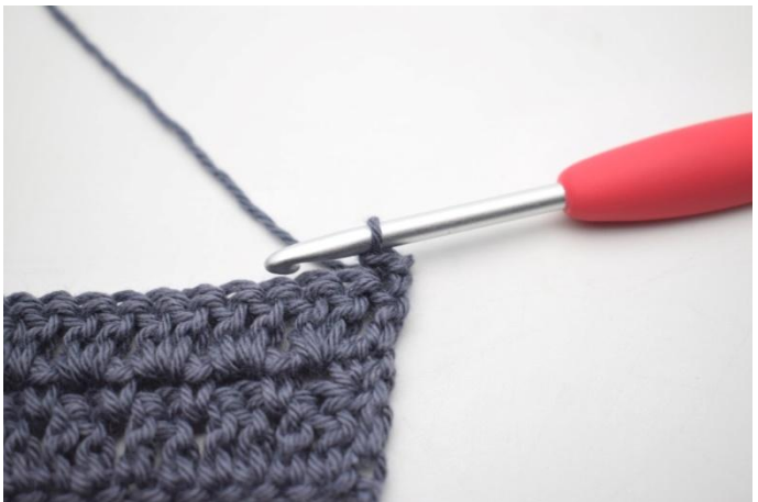
28. Like this.