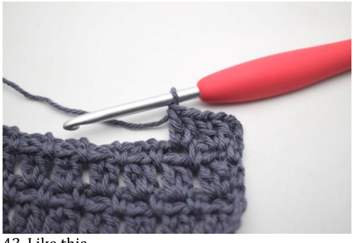
43. Like this.