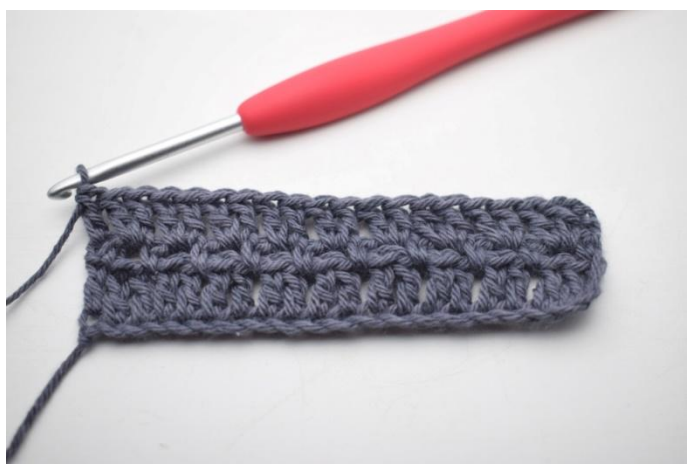
25. Like this.