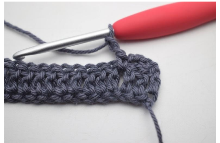
11. "Ch 2,