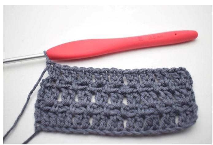
44. Repeat from "to" in each ch-space.