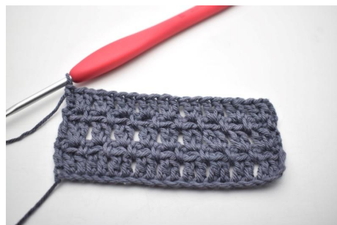
46. Like this.