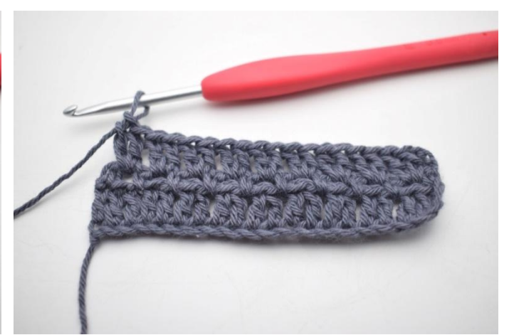
23. Repeat from "to" in each ch-space.