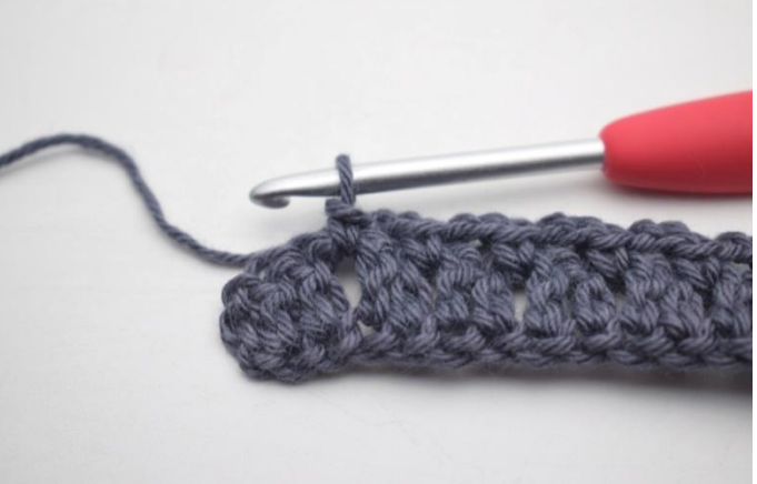
14. Repeat from "to" until you have 3 sts left.