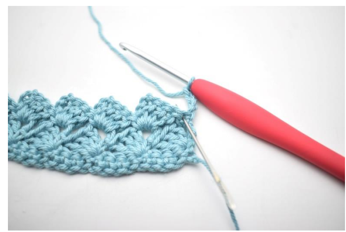
26. 3 dc in the first st.