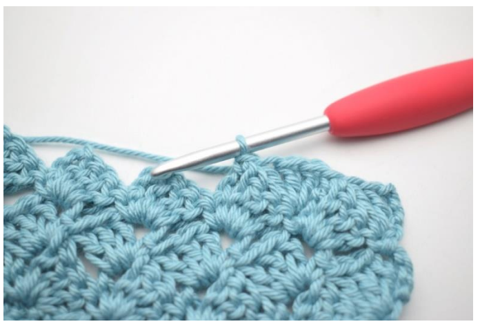
42. Like this.