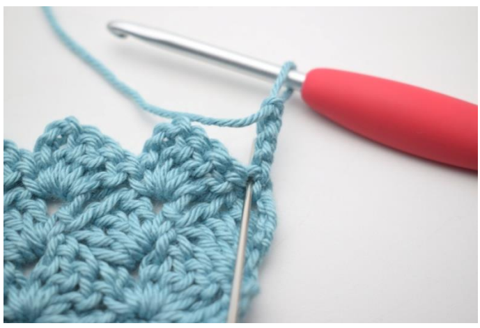
35. 2 dc in the first st.