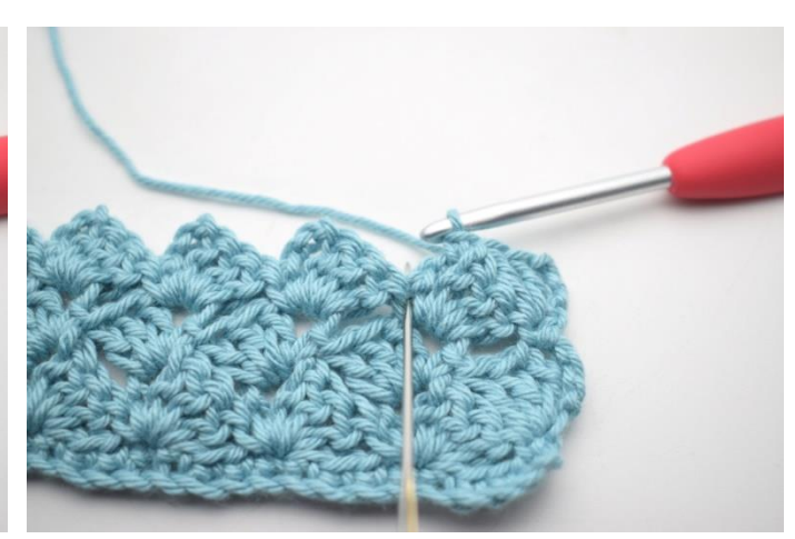
39. 3 dc in the sc from the previous row*.