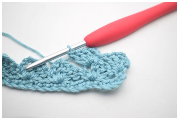
19. Like this.