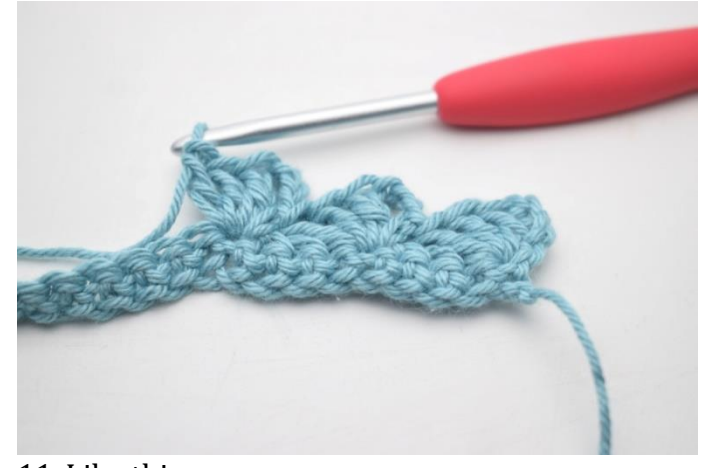
11. Like this.