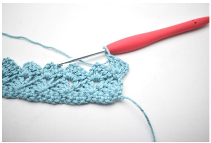
27. Like this.