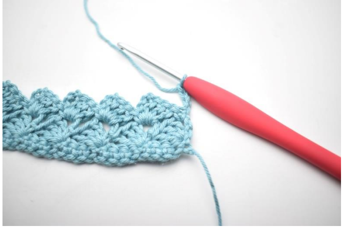
25. This row is crocheted like row 3. Turn, ch4.