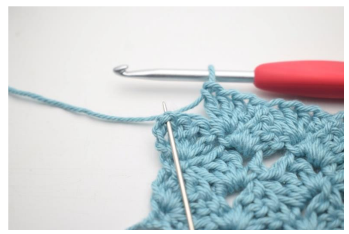
46. 1 sc in the last ch-sp.