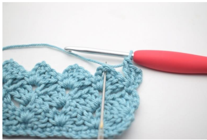
37. *1 sc in the next ch-sp.