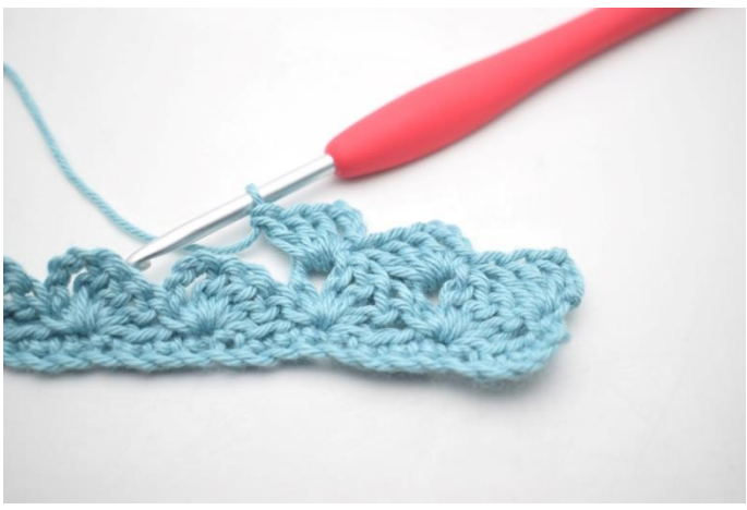
21. Like this.