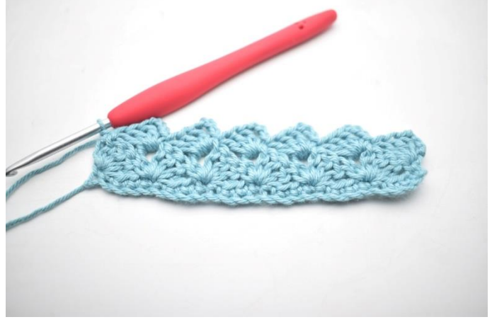
24. Like this.