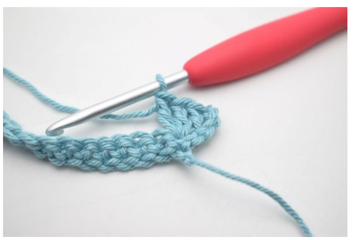
7. Like this.