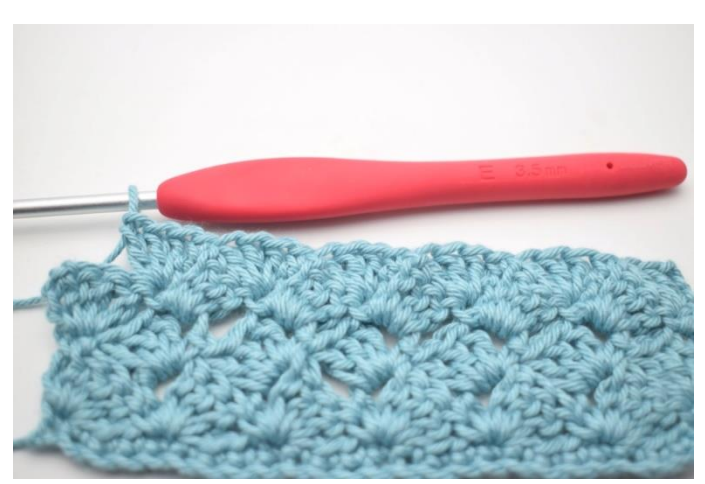
45. Repeat * to * 13 times in total.