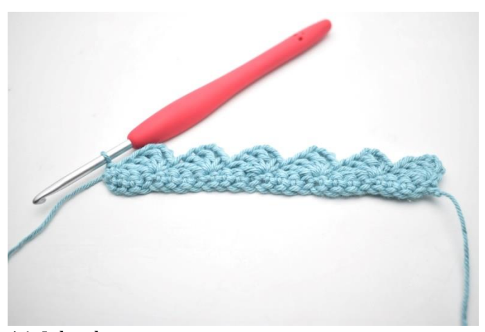
14. Like this.