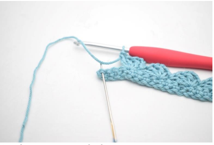
13. Skip 3 st, 1 sc in the last st.