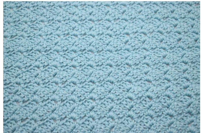
33. Repeat the method in row 3 until you have 24 rows in total.