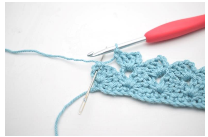
23. 1 sc in the last ch-sp.