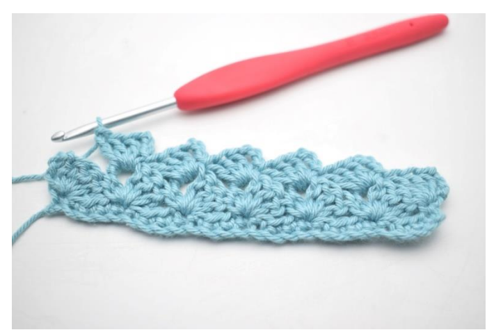
22. Repeat * to * 13 times in total.