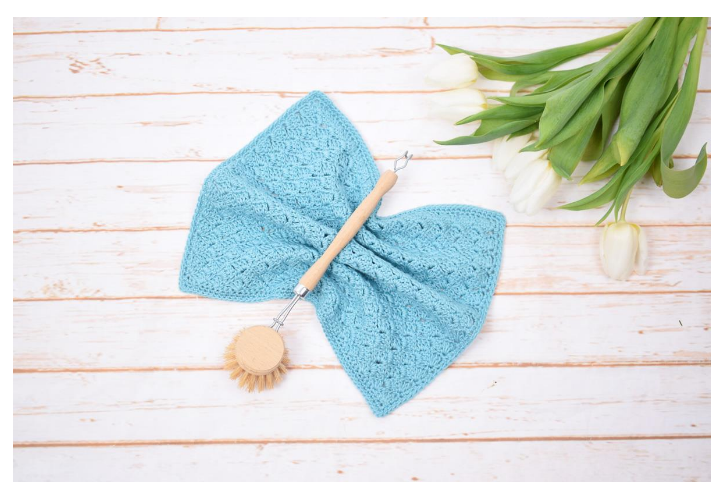
Have fun ☺ Best regards, Hobbii.com