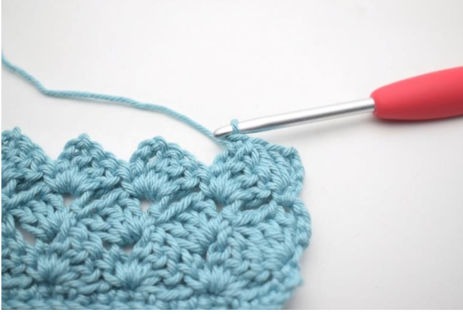
38. Like this.