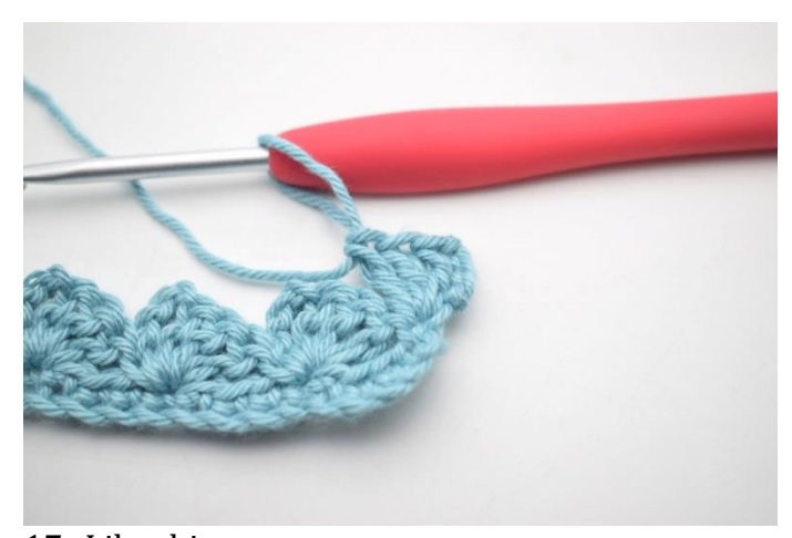
17. Like this.