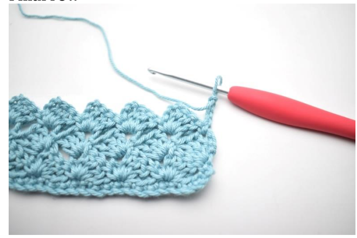
34. Turn, ch4.