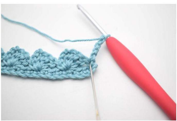
16. 3 dc in the first st.