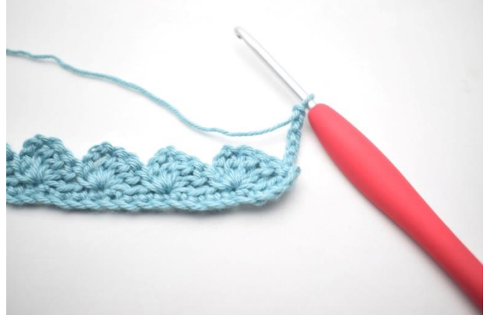
15. Turn, ch4.