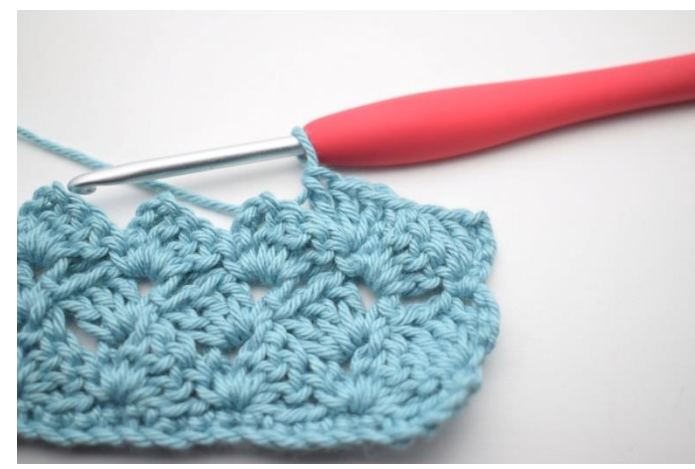
40. Like this.