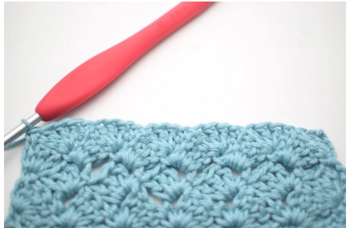
47. Like this.