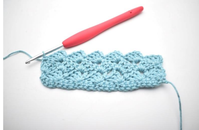
31. 1 sc in the last ch-sp.