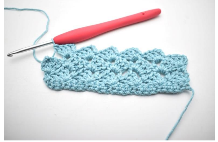
30. *1 sc, ch3, 3 dc in the next ch-sp*. Repeat * to * 13 times in total.