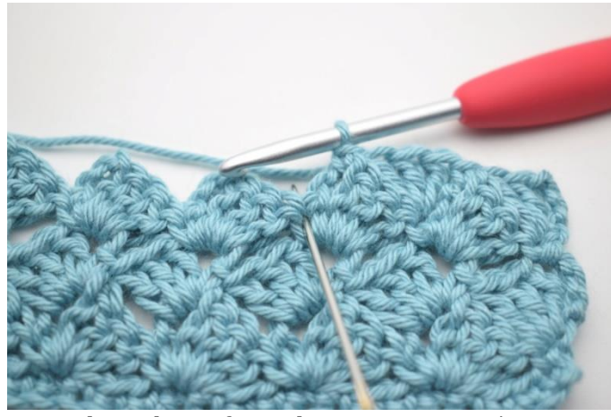
43. 3 dc in the sc from the previous row*.