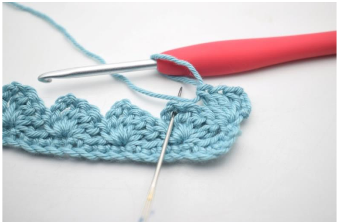
18. *1 sc, ch3, 3 dc in the next ch-sp*.