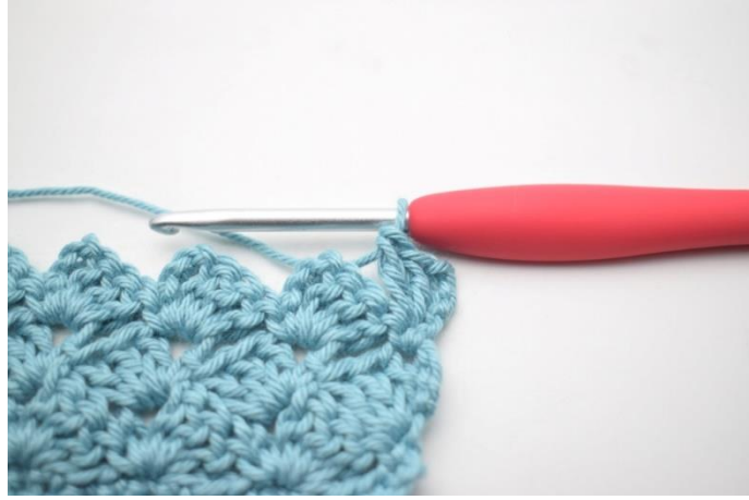
36. Like this.