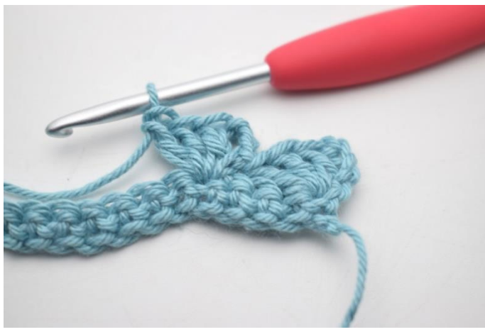
9. Like this.