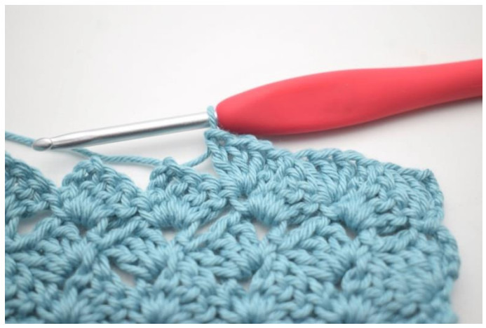
44. Like this.