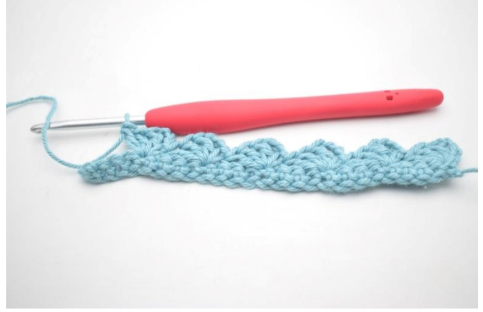
12. Repeat * to * until you have 4 st left.