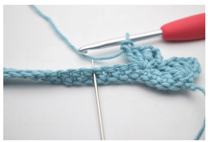
10. *Skip 3 st, 1 sc, ch3, 3 dc in the next st*.