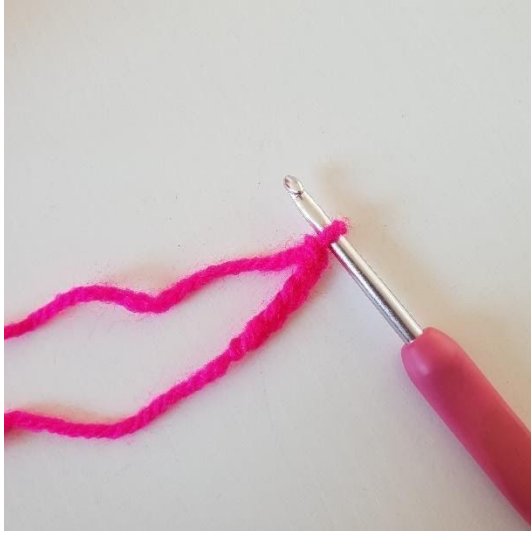
1. Chain 5