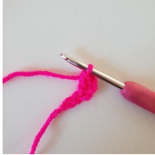
2. Work 1 double crochet in 3 rd ch.