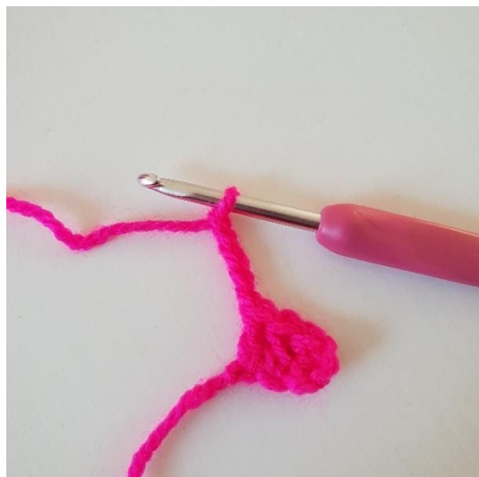
1. Chain 5