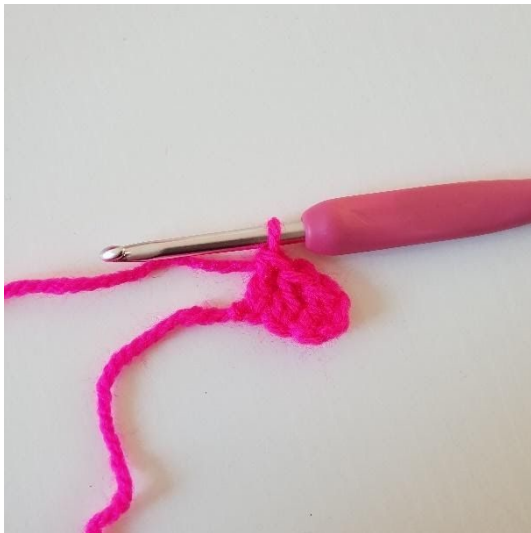
3. Work dc in each of the next 2 ch st. You have now worked your first pixel.