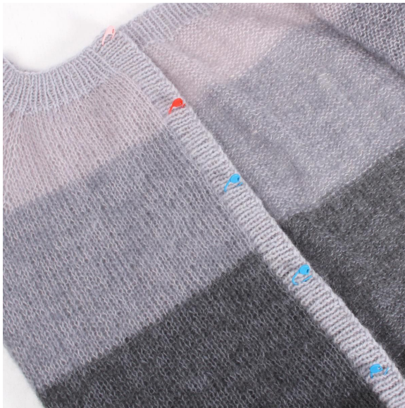
7- Mark where buttons should be placed.