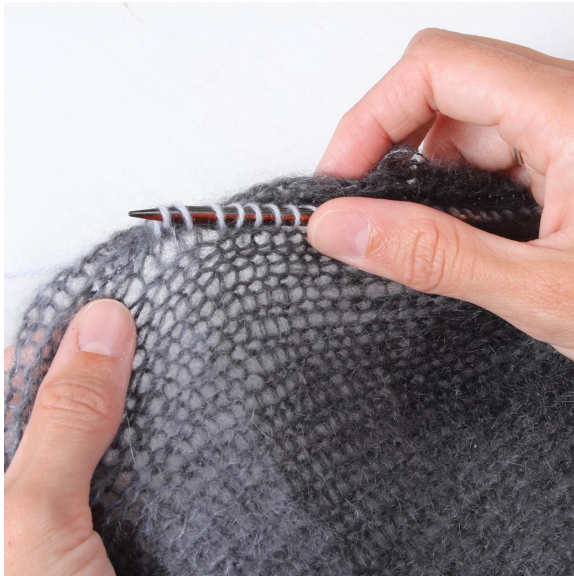
6-Pick up stitches along edge from the RS.