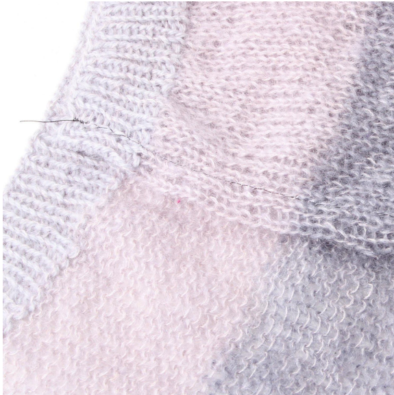
5- The edge now looks like this.