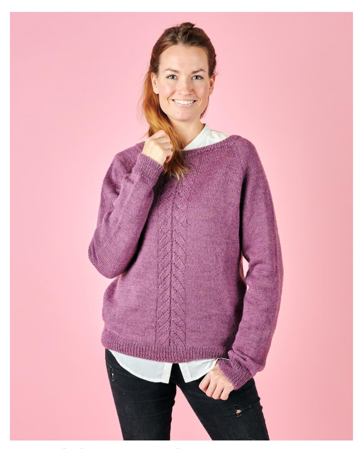
Bodil - Top-down Sweater