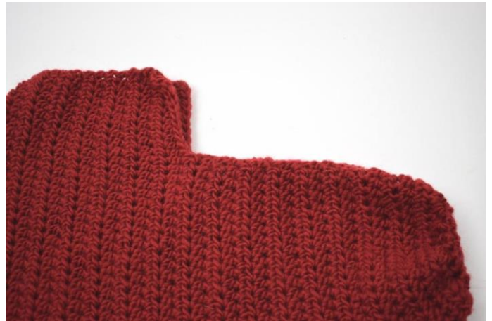
2. Repeat this until you end up at the slit. Cut the yarn and weave in the ends.