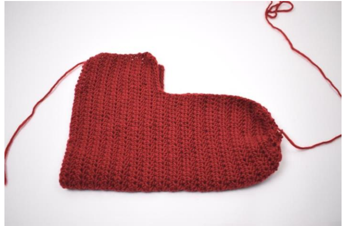
2. Fold the piece together as shown above.