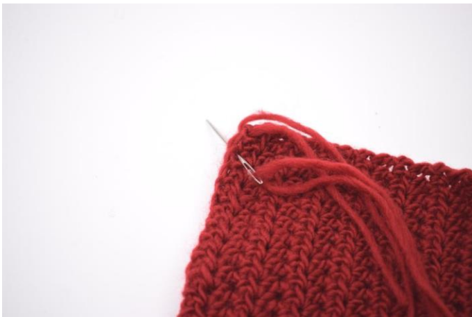
1. The back edge is sewn together by stitching into the ch sts / the foundation chain of both pieces.