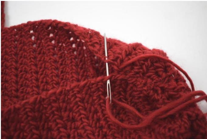
1. Graft the toe, and then sew from the toe to the slit. Sew through a loop on one side and then through the other loop on the other side.