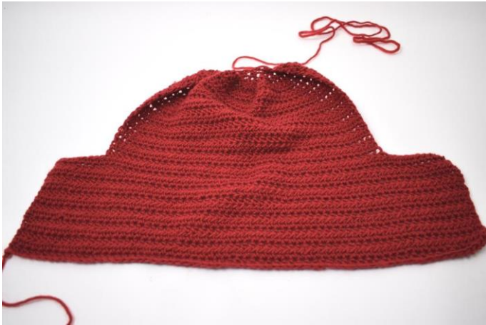
1. Now, it should look like this.