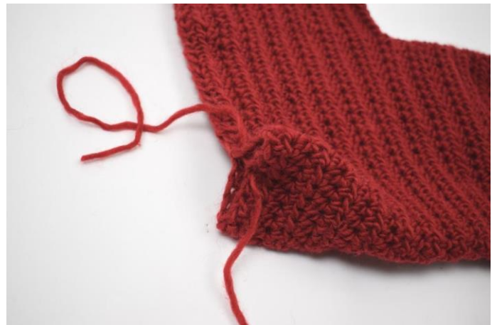
2. Continue until you have approx. 2 inches (5 cm) left. Fold the hole “across”.