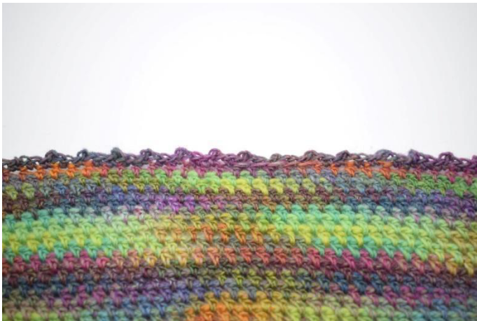
13. Work the edge on the opposite side of the cowl the same way.