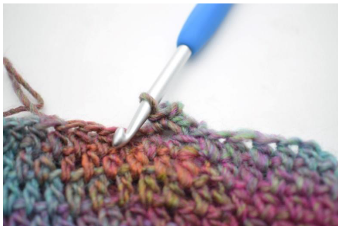
6. Work 1 sc in the next s.