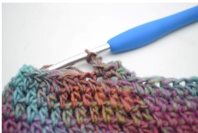
10. Like this.