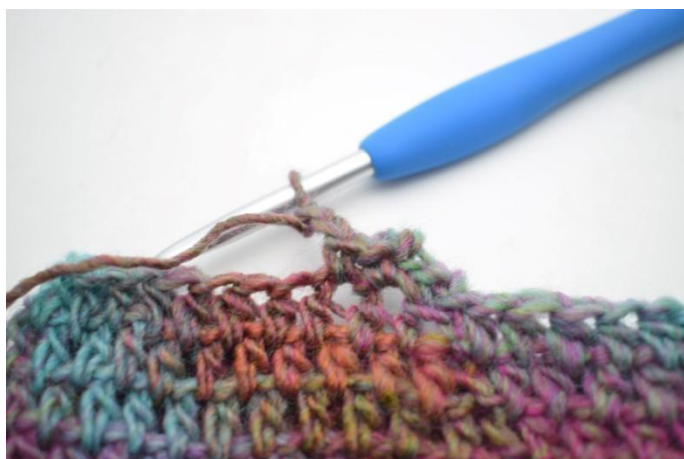
8. Ch 2.