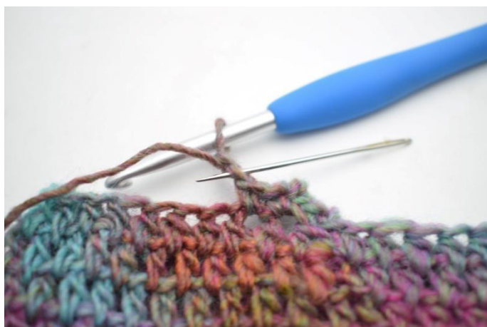
9. Work 1 ss in the 2 nd ch from the hook.