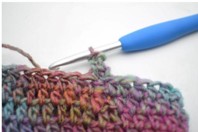
5. Like this.