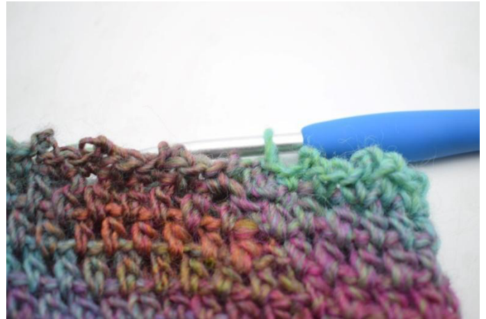
12. "Work 1 sc in the next s, ch 2, work 1 ss in the 2nd ch from the hook. Work 1 sc in the next s of the cowl". Repeat from "to" around. Finish with 1 ss in the first sc. Cut the yarn and weave in the ends.