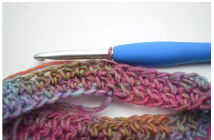
6. Work hdc between all stitches around. Finish with 1 ss in the first hdc.(200)