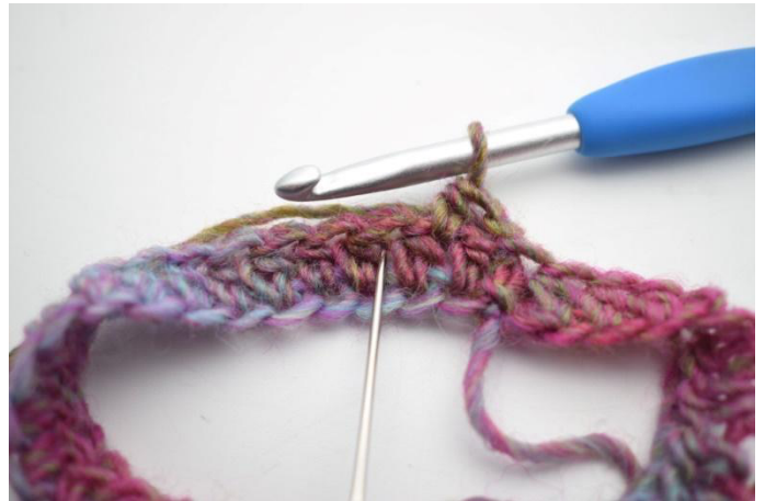
4. Work 1 hdc between the next 2 hdc from the previous row.