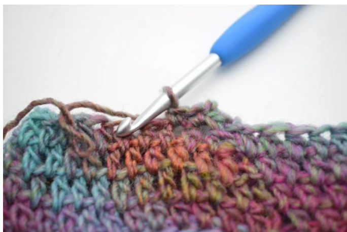
7. Work 1 sc in the next s.