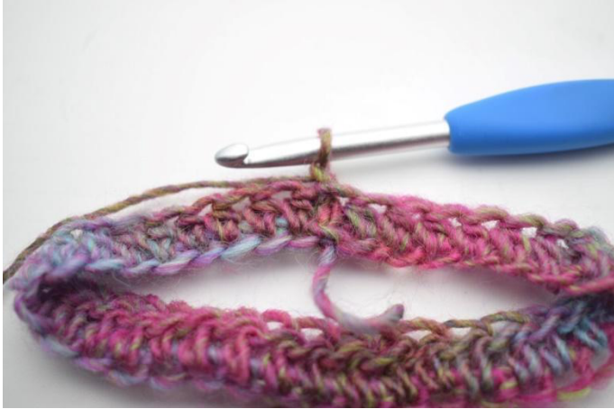
1. Ch 1.