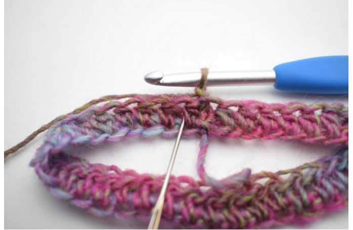
2. Work hdc between the first 2 hdc from the previous row. The needle marks where your hdc should be worked.