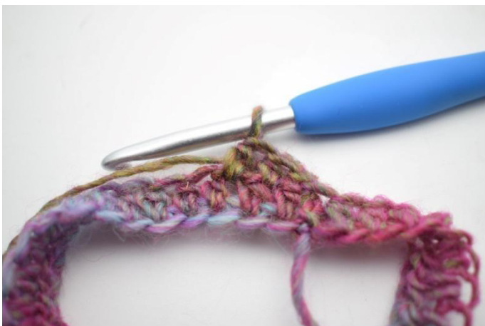
5. Like this.