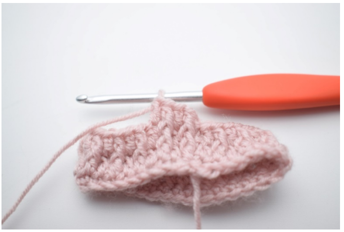
5. Work "1 fpdc around first st. Work 1 regular dc in next st".