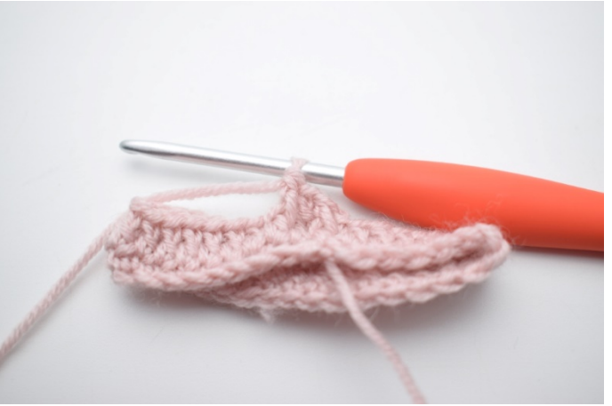
7. Like this.