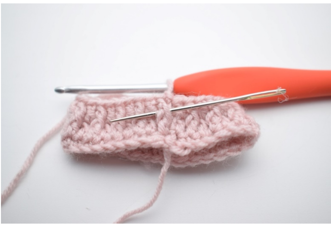
2. Work 1 fpdc around the first st.