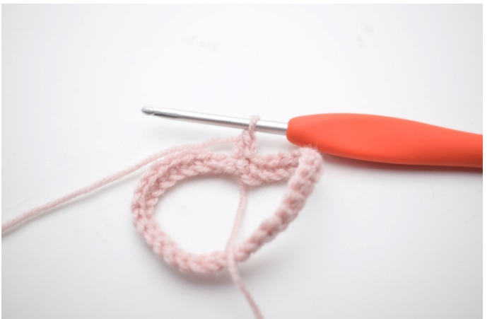
1. Make 1 ch.