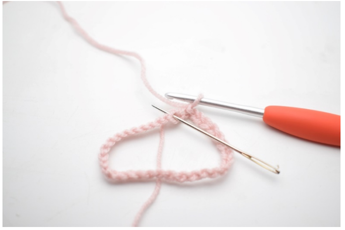
3. Make 1 ch. Turn your ch row and work sc in the horizontal chain around.