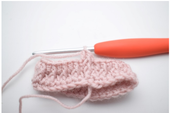
4. Work 1 dc in the next st.