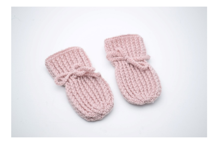
Happy crocheting \odot Kind regards, Hobbii.com