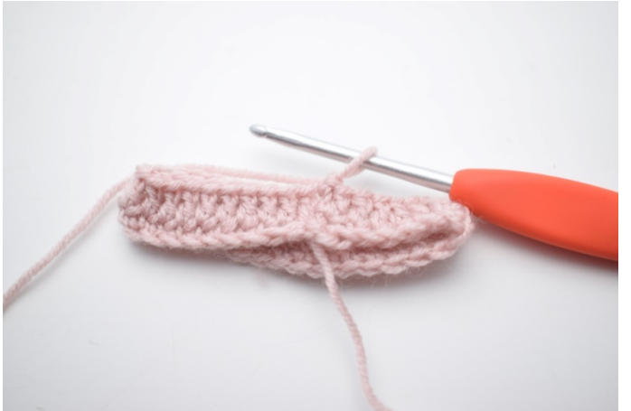
1. Make 1 ch.