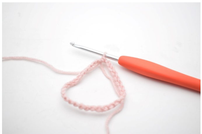
2. Gather to a ring with 1 sl st.