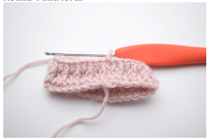
1. Worked like round 3. Make 1 ch.