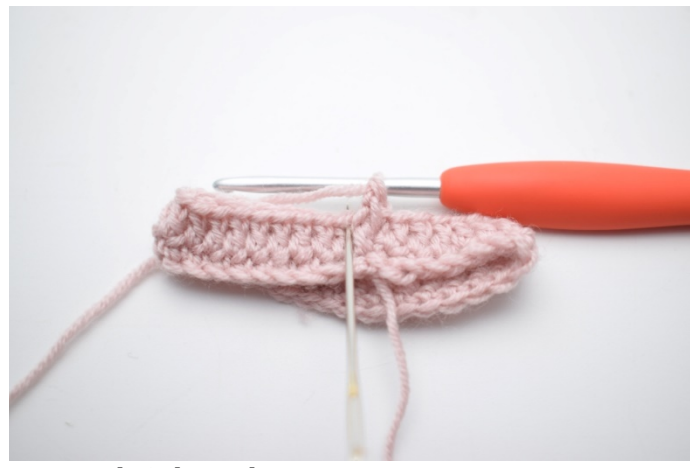
4. Work 1 dc in the next st.