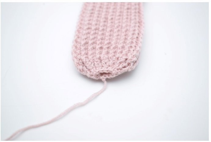
3. When all the rounds with decreases are made, the hole is closed by sewing the strand of yarn around in the sts and tightening.