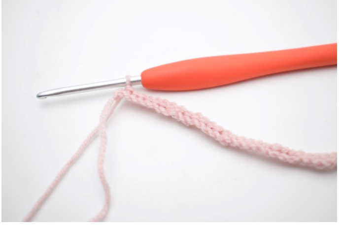
3. Work sl sts across.