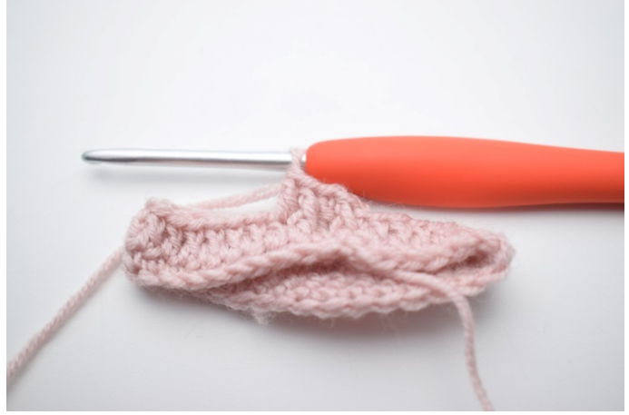
9. Like this.