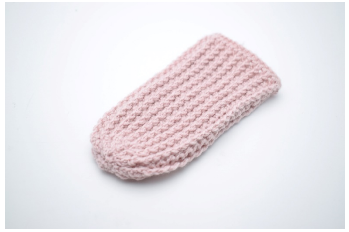
4. Cut the yarn and weave in ends.