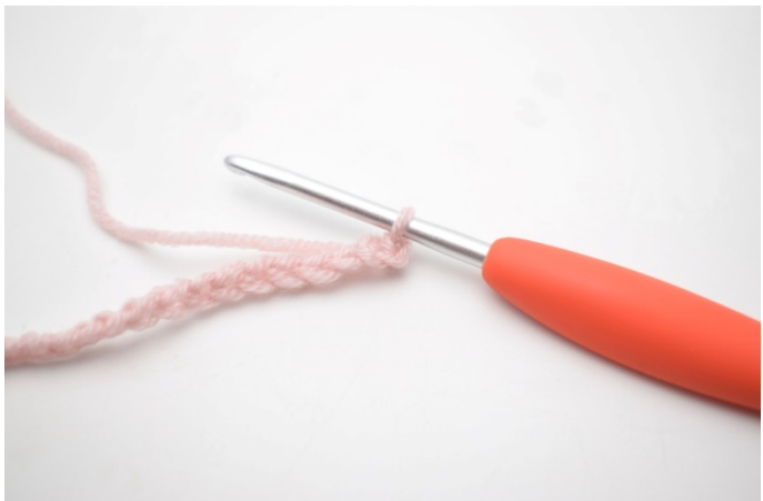
2. Like this.