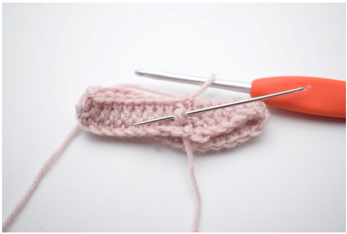
2. Work 1 fpdc around the first st. The needle here marks how your fpdc should be worked around the post from the front.