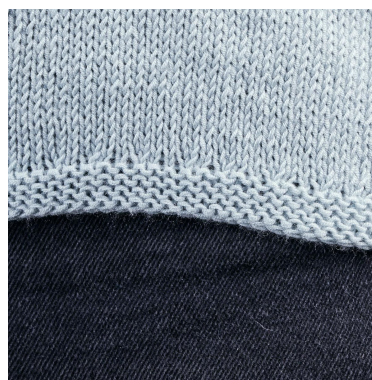
Brim at waist