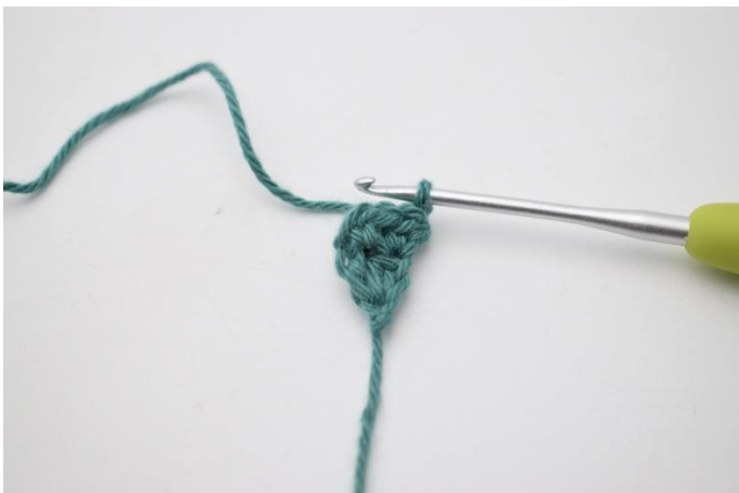
5. Ch 1 to turn.