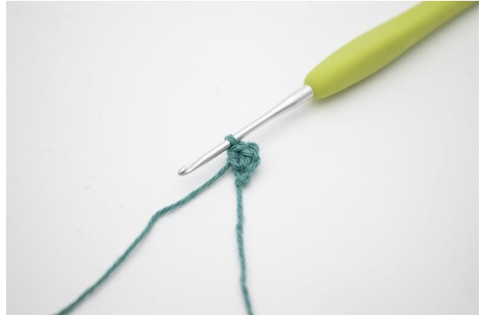
2. Work 2 hdc in 2 nd ch from hook.