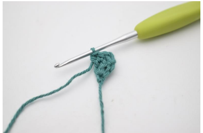
4. Work all rows through back loop. Work 1 hdc in first st and 2 hdc in last st.