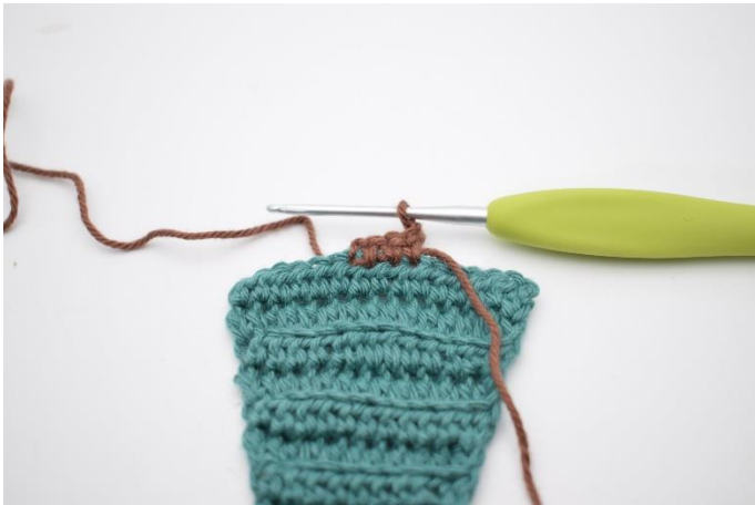
13. Ch 1 to turn.