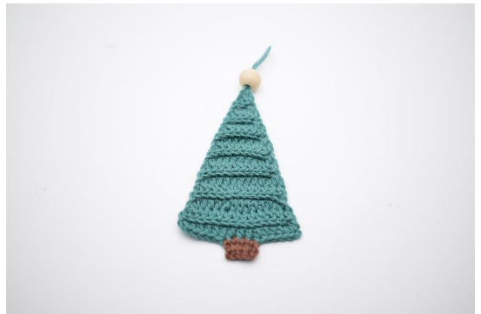
16. Attach optionally a bead on top of the tree.