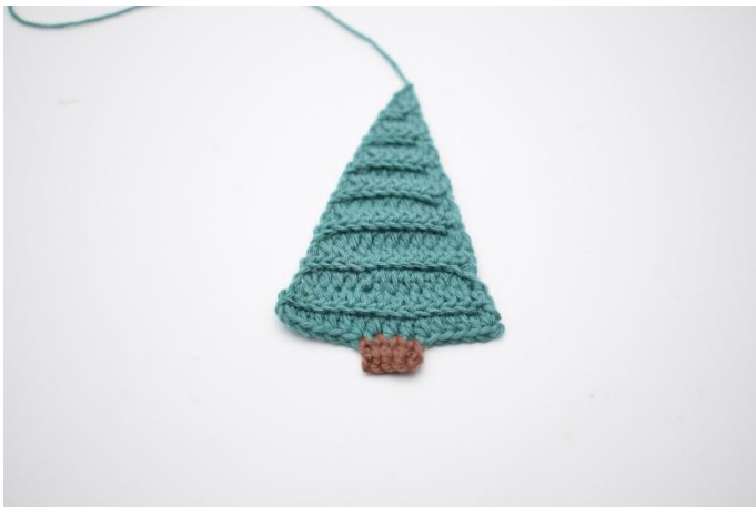
15. Cut the yarn and weave in ends.