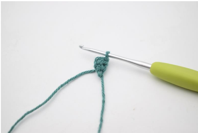
3. Ch 1 to turn.