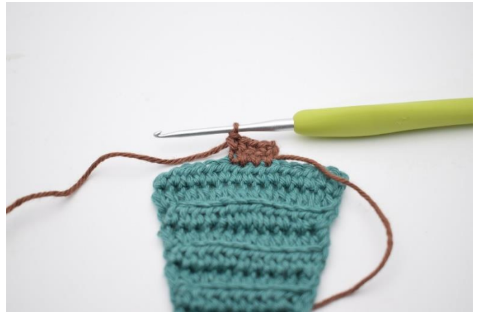
14. Work 1 sc in 4 st.