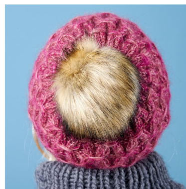
Attached pom pom