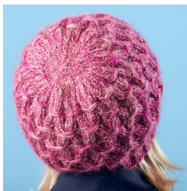
Decreases at the top