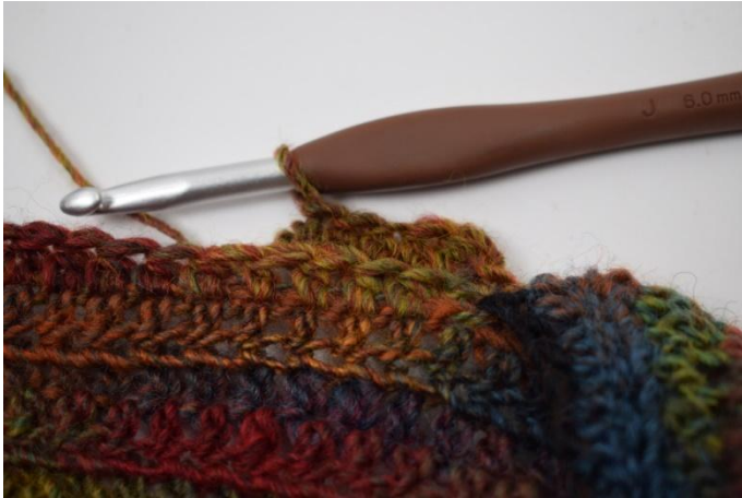
5. Ch 1. Work hdc in blo around.