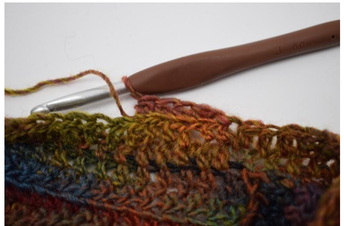
8. Work hdc in blo around.