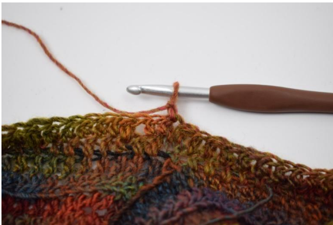
7. Turn your work by ch 1.