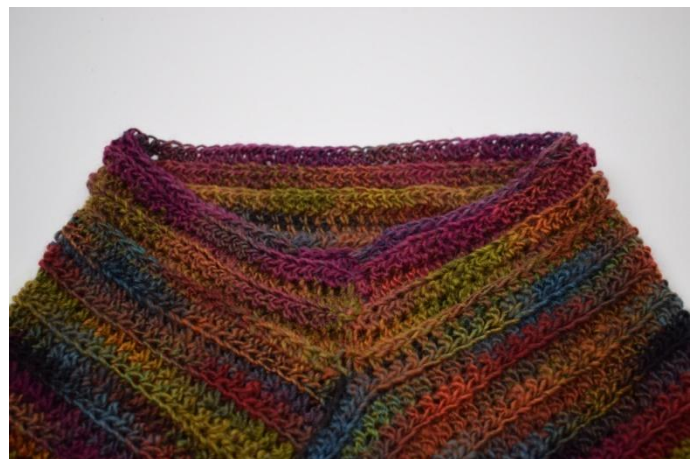
10. Repeat as described in the pattern until you have 6 rounds of hdc in total.