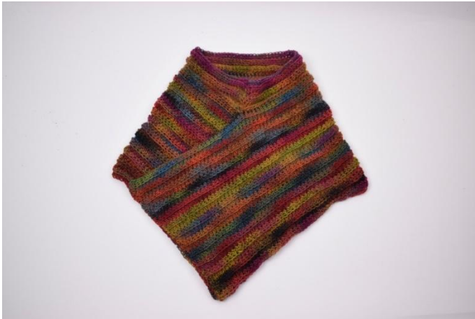
11. Cut the yarn and weave in the ends.