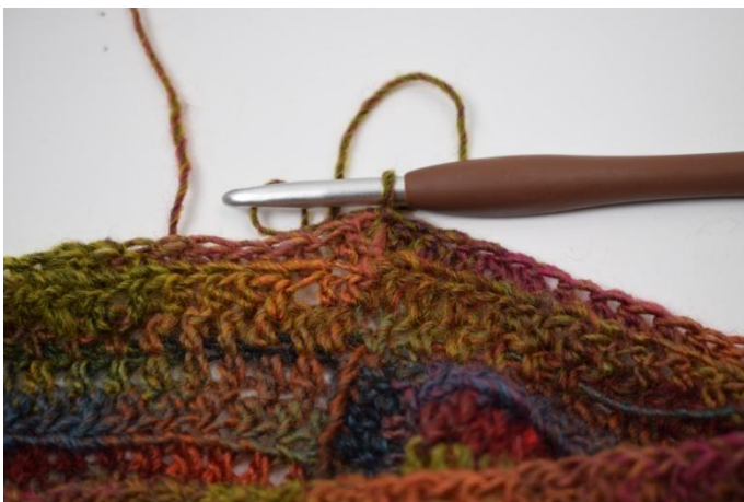
9. Finish with 1 ss in the first hdc.