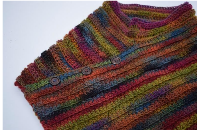
12. If you like, you can sew 3 buttons onto the front as decoration.