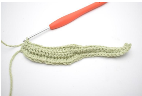
5. Like this.