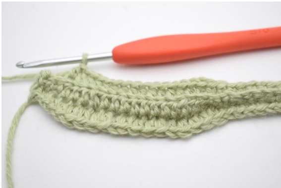
3. Work 1 hdc in the next 11 (15) sts.