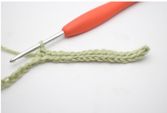
5. Work 1 sc in the next 11 (16) ch sts.