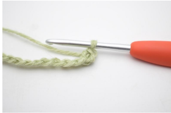
4. Like this.