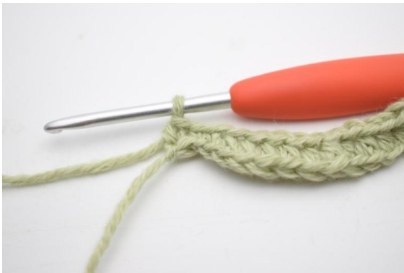
7. Work 1 sc in the last 2 (3) ch sts.