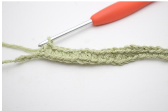
6. Work 1 hdc in the next 11 (15) ch sts.