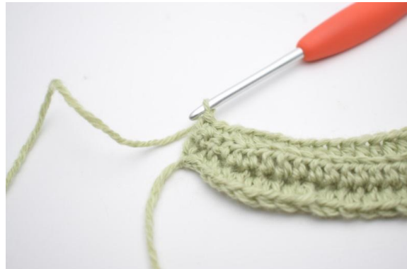
4. Work 1 sc in the last 2 (3) sts.