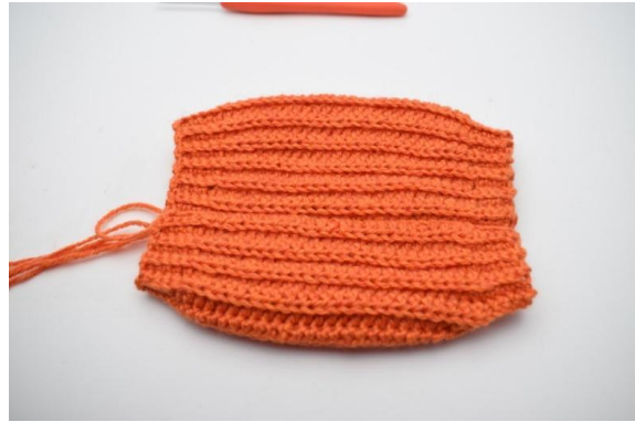
6. Like this.