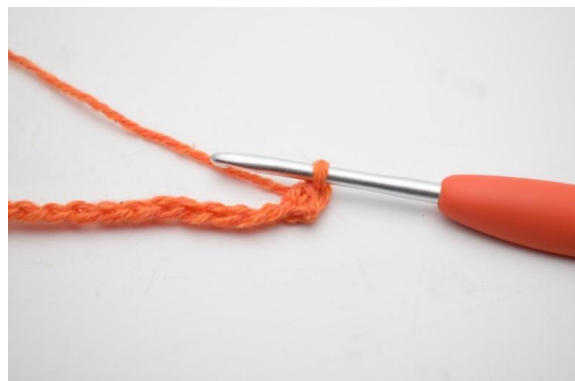
4. Like this.