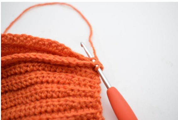
3. Now, crochet the sides together. This is done by crocheting through both loops on the front piece and through the blo on the back piece.