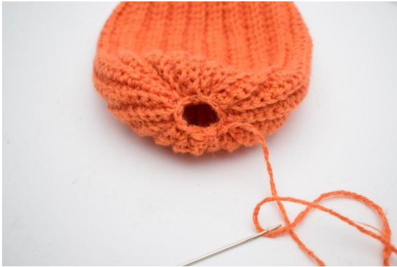
13. Like this.