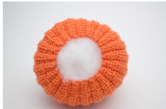
16. Stuff the pumpkin.