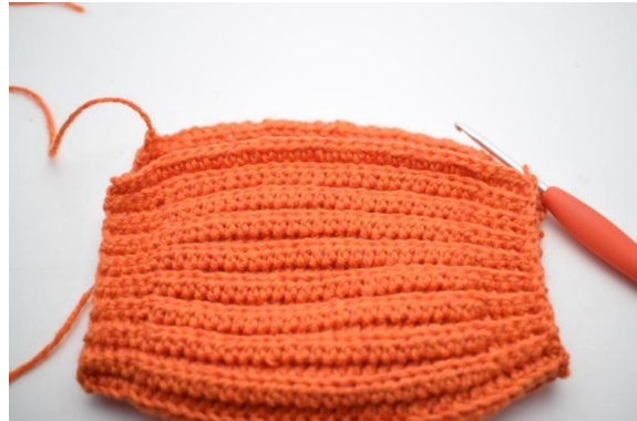
2. Fold the piece in the middle.