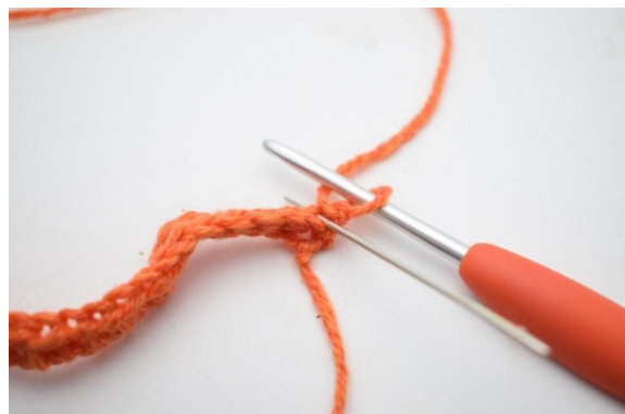
2. From now on, work ONLY in the back loop (blo)