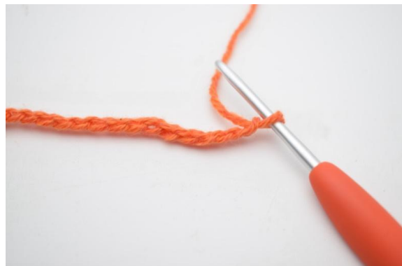
2. Turn your foundation ch.