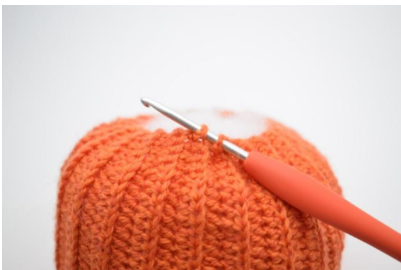
17. Repeat working ss through 2 of the outer rib around at the base of the pumpkin.