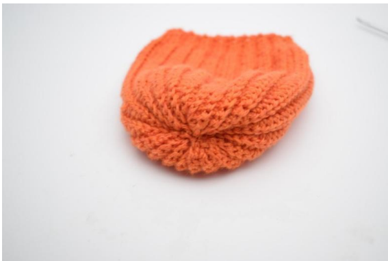
15. Turn the inside out of the pumpkin back inside again.