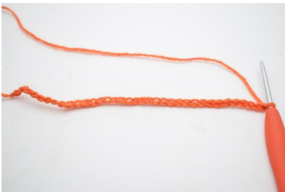
1. Ch 29 (36).