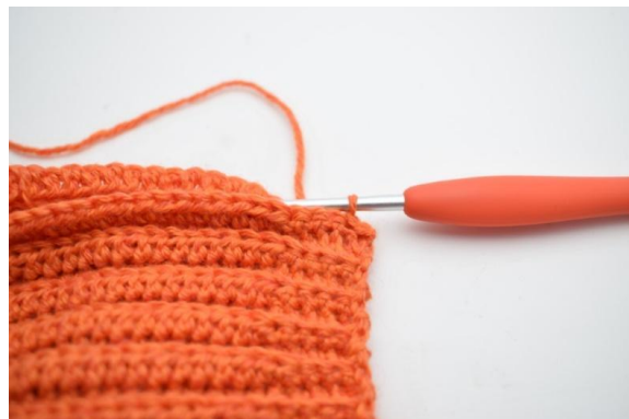
4. Like this.