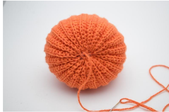
20. Like this.