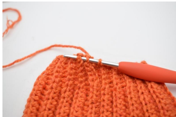
8. Work ss through 2 of the outer rib.