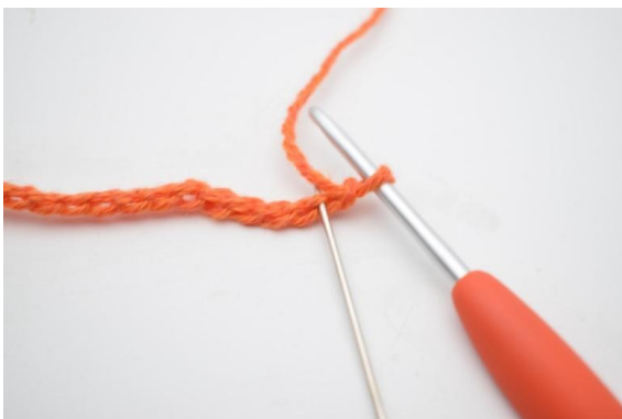
3. In the 2. ch from the crochet hook, work 1 sc.