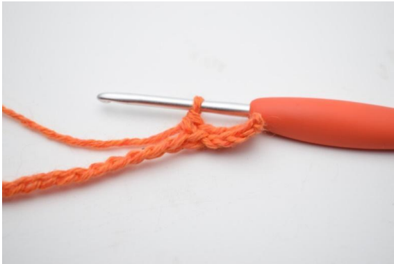
5. Work 1 sc in the next 3 (4) ch sts.