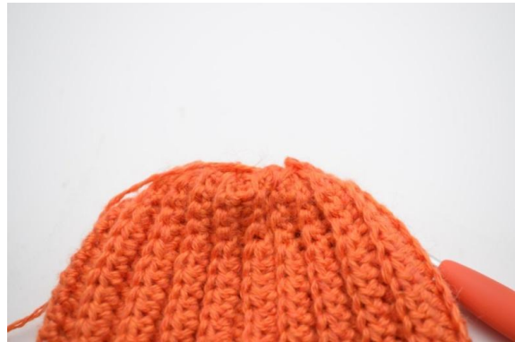
12. Repeat around.