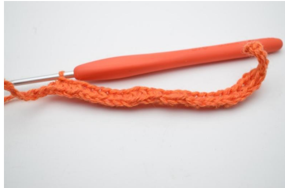
6. Work 1 hdc in the next 20 (25) ch sts.