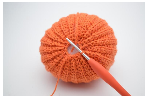
18. Like this.