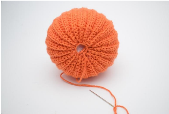
19. Cut the yarn and sew the hole shut.