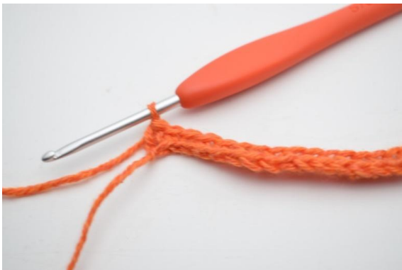
7. Work 1 sc in the last 4 (5) ch sts.