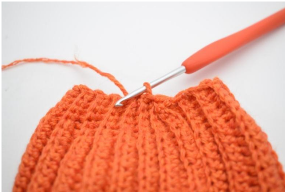
11. Like this.