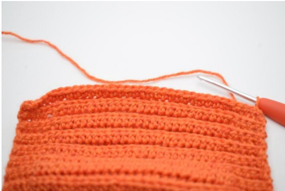
1. Turn by chaining 1.

Now, pull the yarn up through the pumpkin and back again. Tighten slightly and weave in the end.