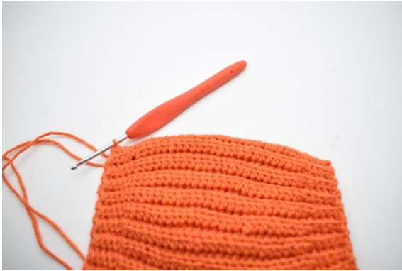
5. Work ss around.