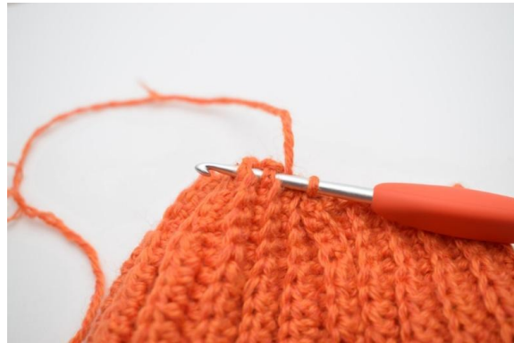
10. Work ss through the next 2 rib.