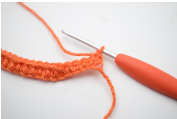
1. Turn by chaining 1.