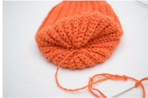
14. Cut the yarn and sew the hole shut.