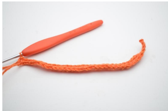
8. Like this.