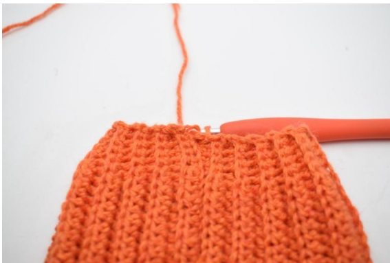
7. Now, the top is going to be crocheted shut.