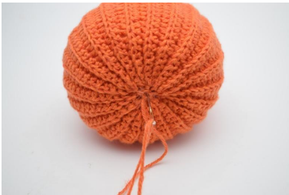
21. Now, pull the yarn up through the pumpkin and back again.