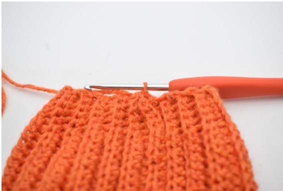
9. Like this.