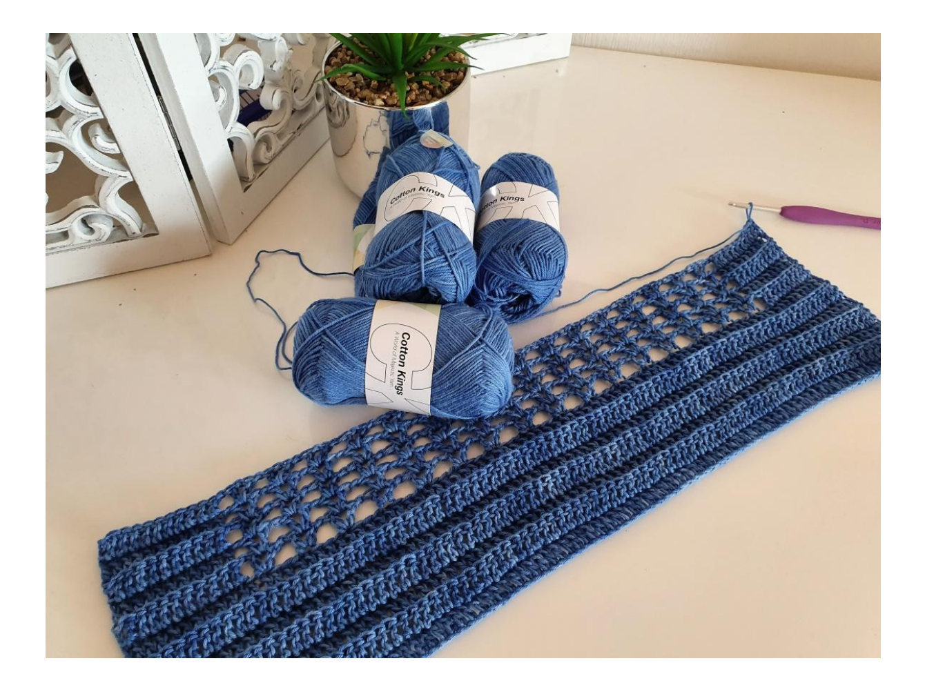
Rows 10 – 34 Repeat row 9

1 dcblo in next 9 st, ch 1, [1 V st in next V st, ch 1]. Repeat the section until the last V st of the previous row, 1 dcblo in last 10 sts. Ch 3 and turn.