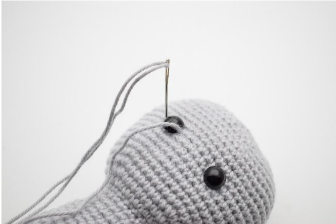
5. And down again on the left side.