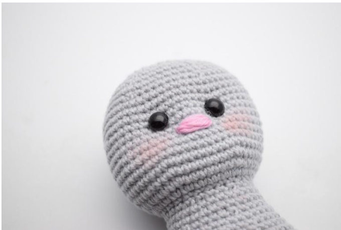
7. Embroider the snout as shown in the picture above. It was done over 4-5 sts.