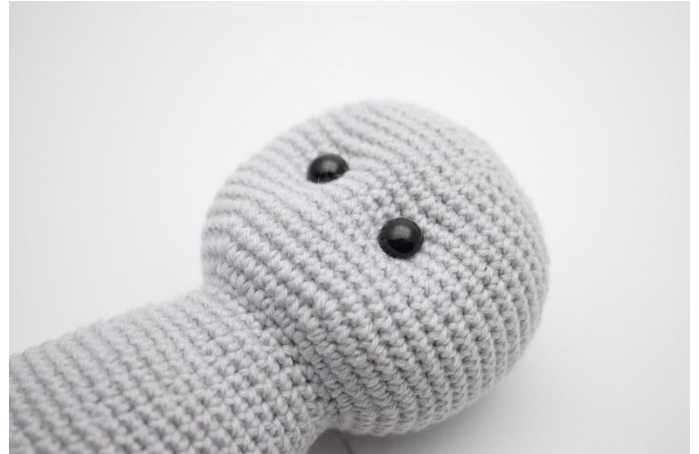
6. Tighten slightly so that the eyes are pulled in a bit and gives the bunny a cute look.