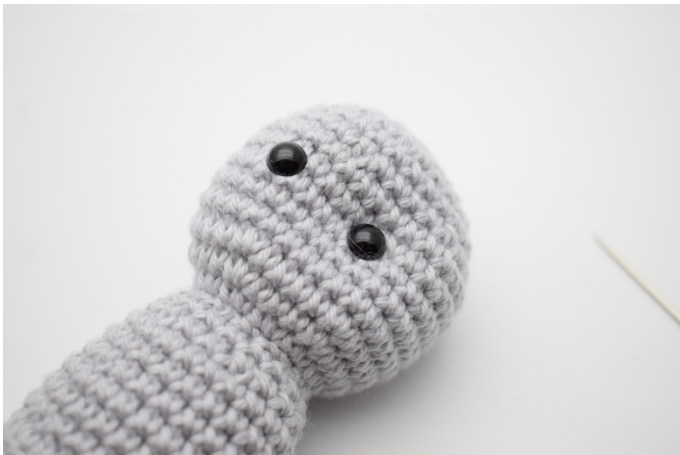
3. Tighten a bit so there's a dent under the eye.