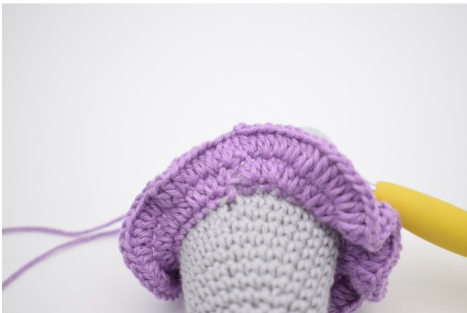
5. Work 1 ch, 2 hdc in all st around. Finish with 1 sl st in the first hdc.