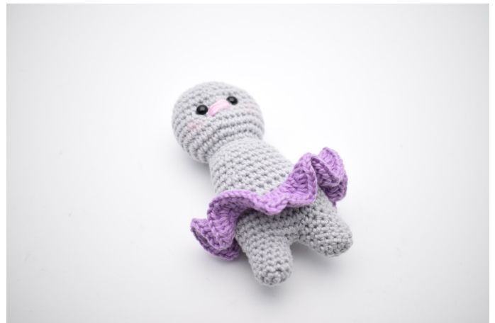
6. There. Cut the yarn and weave in ends.