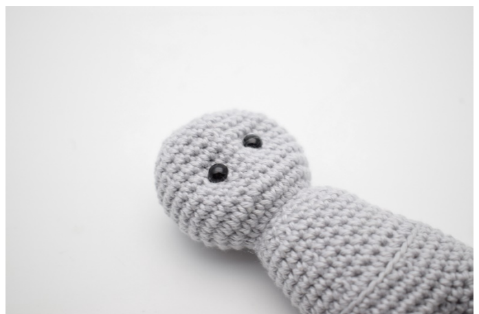
6. Tighten a bit so the eyes are pulled slightly back and gives the bunny a cute expression.