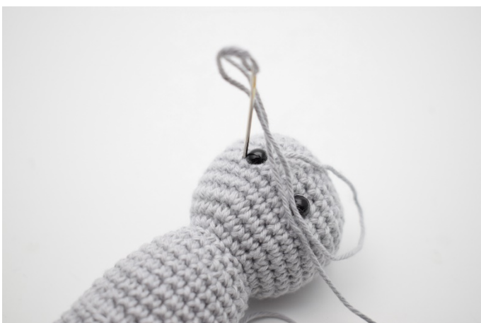
5. And down again on the left side of the eye.