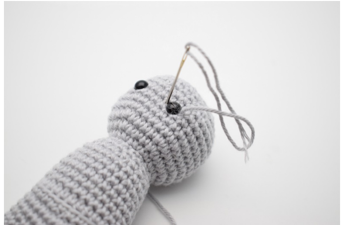
2. Put the needle down on the left side of the eye and tighten a bit.