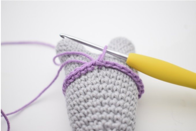
3. Work sc around and finish with 1 sl st.