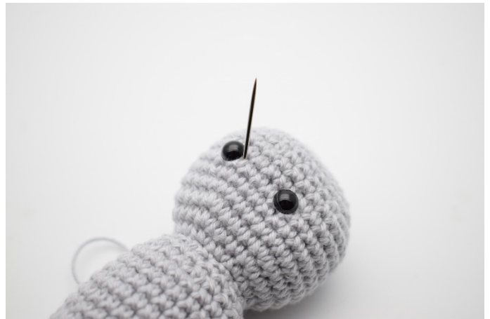
4. Now pull the strand of yarn up on the right side of the other eye.