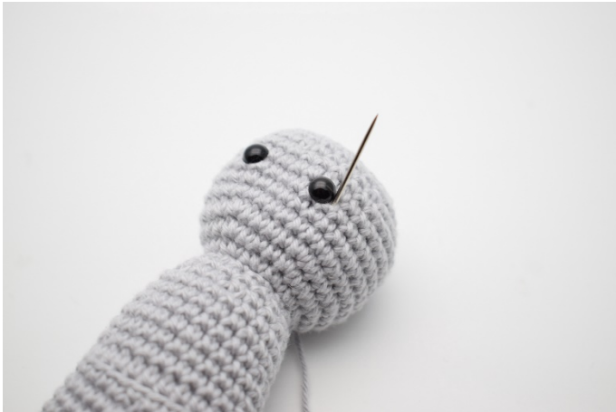
1. With the same color as the head, pull a strand of yarn up and out on the right side of one eye.