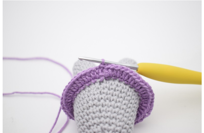
4. Work 1 ch, 2 hdc in all st around. Finish with 1 sl st in the first hdc.