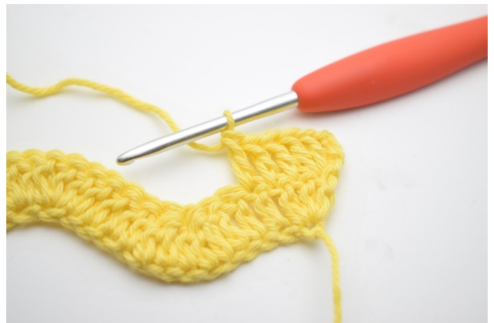
4. Work 1 dc in the next 3 sts.