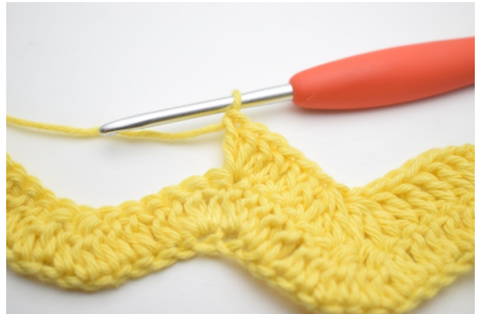
8. Work 3 dc in next st.