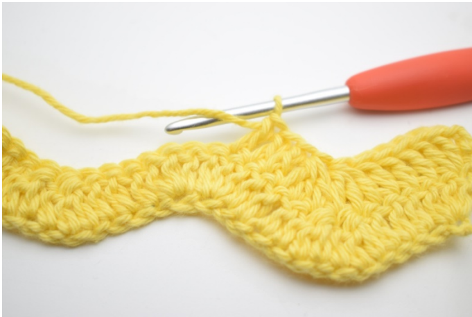
7. Work 1 dc in the next 3 sts.