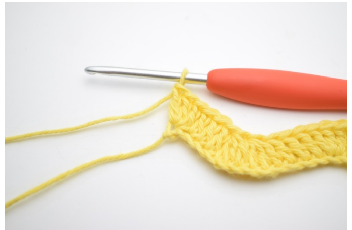
14. Work 3 dc in last ch.