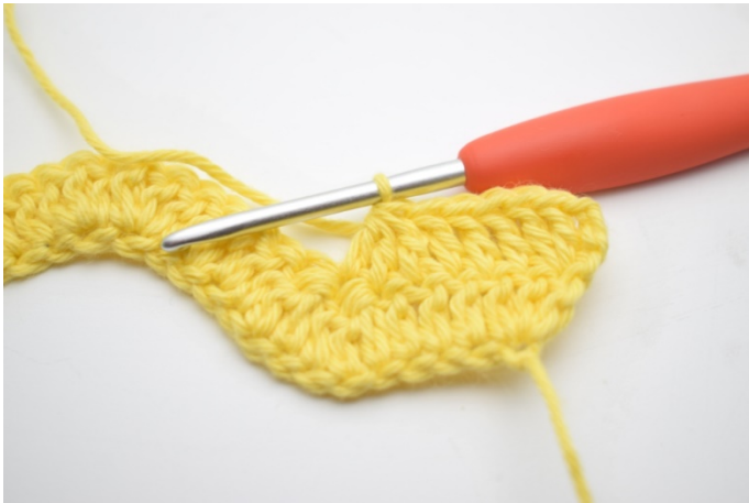
5. Work 3 dc tog over the next 3 sts.