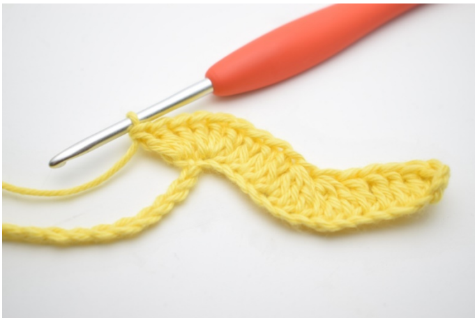
9. Repeat and work 3 dc in next ch.