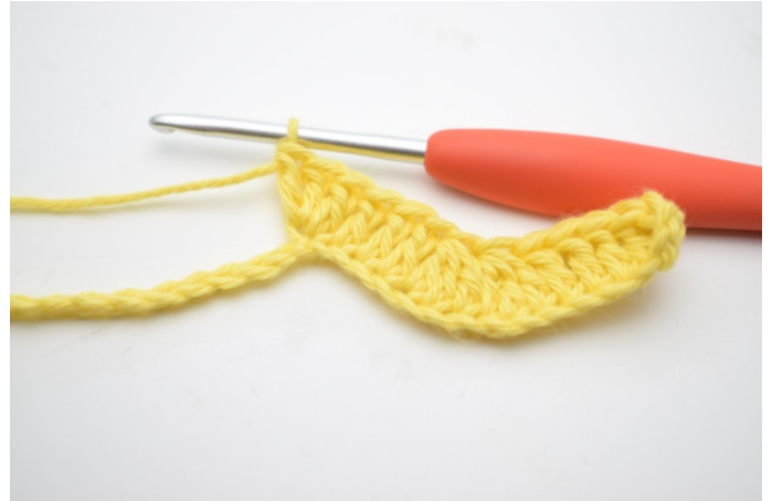
8. Work 3 dc in the next ch.