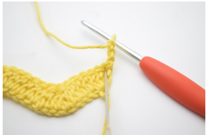
2. Work 2 dc in first st.