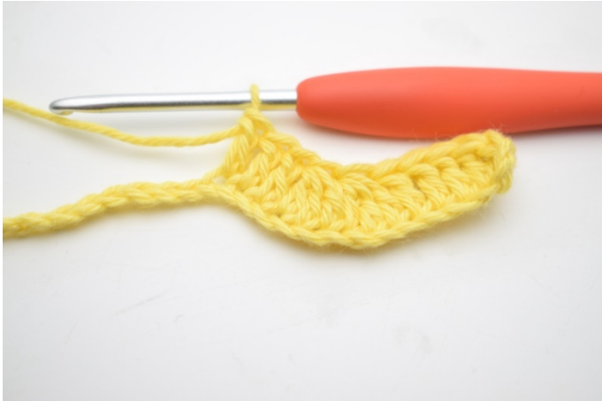
7. Work 1 dc in the next 3 ch.