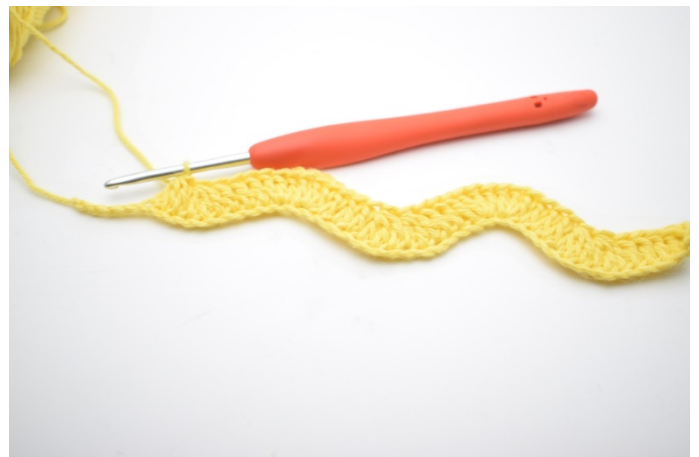
12. Repeat like this across until you have 4 ch left.