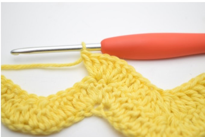
9. Repeat and work 3 dc in next st.