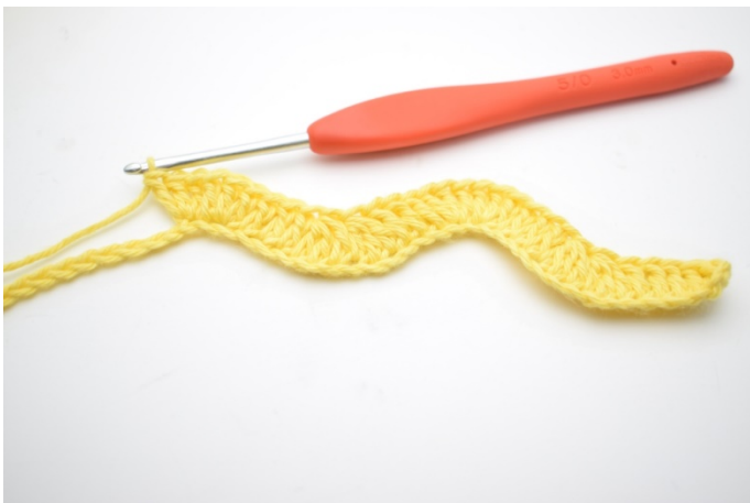
11. Work 1 dc in the next 3 ch. Work 3 dc in the following 2 ch.