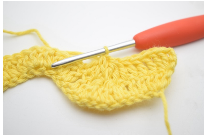
6. Repeat and work 3 dc tog over the next 3 sts.