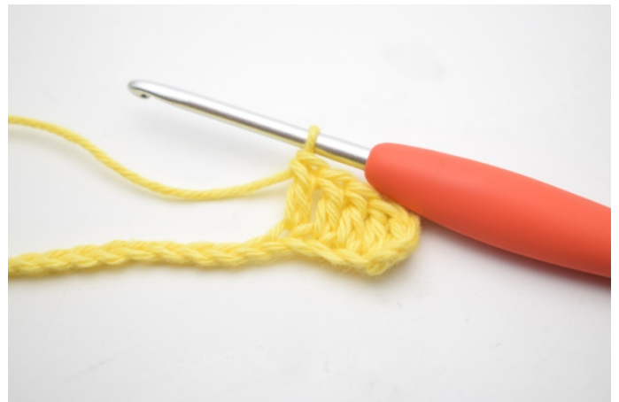
4. Work 1 dc in the next 3 ch.