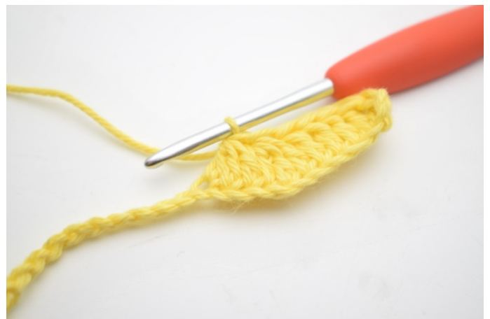
6. Repeat and work 3 dc tog over the next 3 ch.