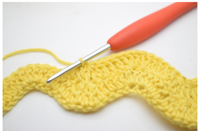
10. Work 1 dc in the next 3 sts. "Work 3 dc tog over the next 3 sts.". Repeat "to" 2 times all in all.