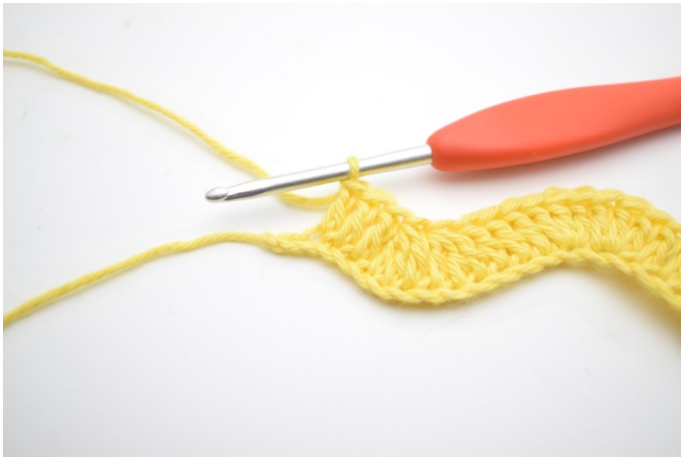
13. Work 1 dc in the next ch.