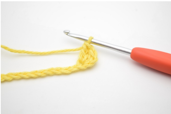
3. Like this.