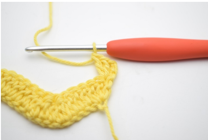
3. Like this.