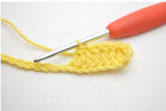
5. Work 3 dc tog over the next 3 ch. (It means that you should work 3 dc tog into 1)