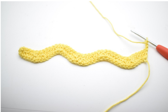
1. Turn using 3 ch.