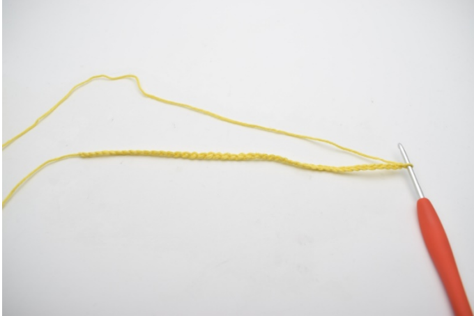
1. Cast on 58 ch.