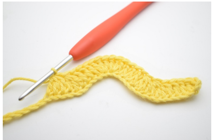
10. Work 1 dc in the next 3 ch. "Work 3 dc tog over the next 3 ch". Repeat "to" 2 times all in all.