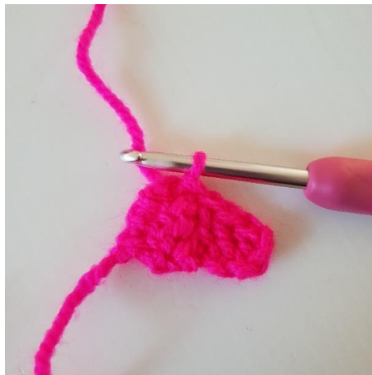
4. Now this pixel needs to be joined to the first pixel. You do this by turning the pixel and working a sl st in the left side of the first pixel. The picture shows the 2 joined pixels.