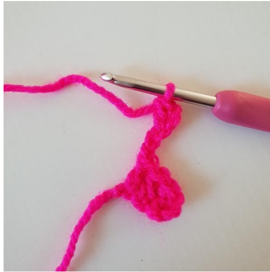
2. Work 1 dc in the 3rd ch from the hook