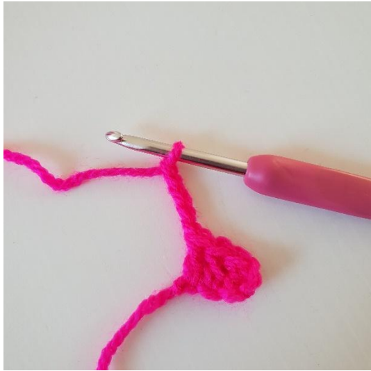
1. Ch 5