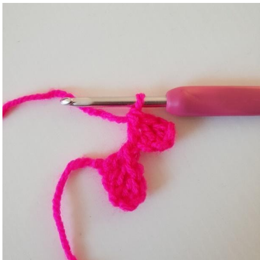
3. Work dc in the next 2 ch sts. You have now made 1 pixel.