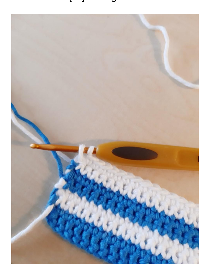
Rnd 3 – 4 1 sc in each s [20]. Change to blue.

Change to white : at the last sc when you have two loops on the hook, pull the white thread through (instead of the blue) and turn the work. Please see pictures below.