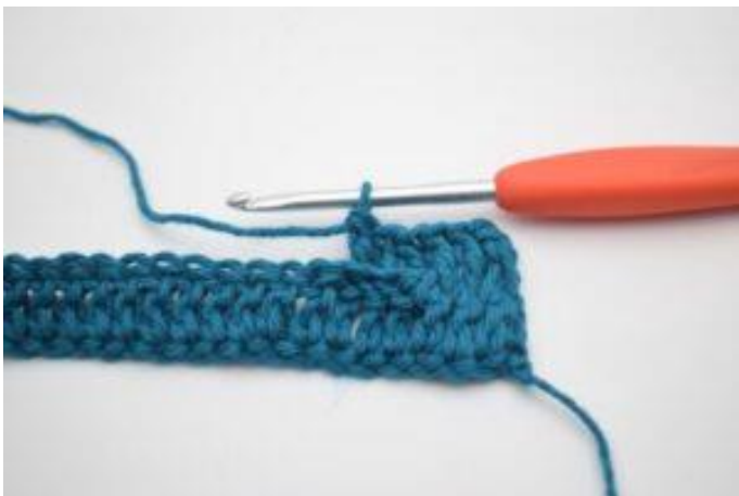
7. Work 1 bpdc around the next 2 sts.