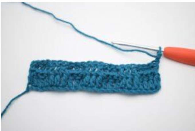
1. Ch 2 and turn.