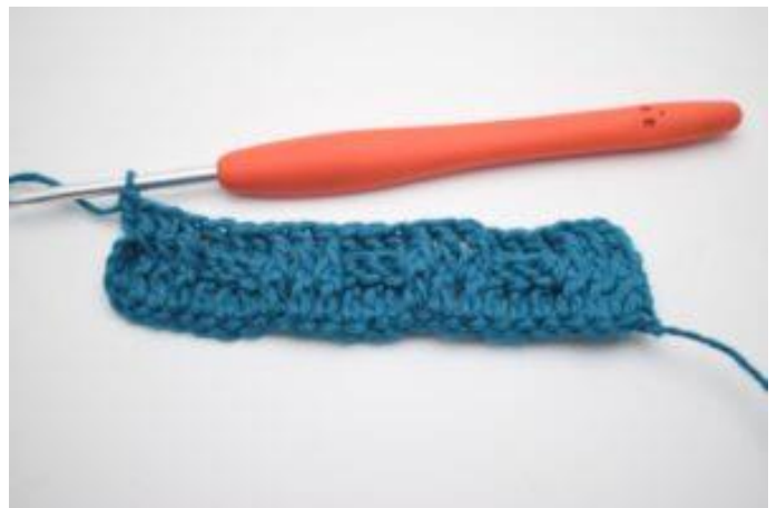
12. Like this.