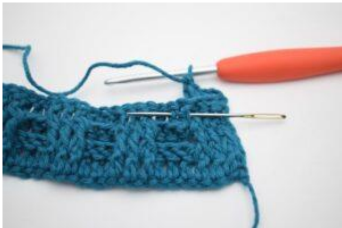
5. Work 1 fpdc around the next st.