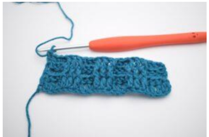
Continue alternating bpdc and fpdc around sets of 3 sts. The row ends with 3 bpdc. In the last st, work 1 regular dc.