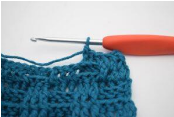
7. Work 1 bpdc around the next 2 sts.