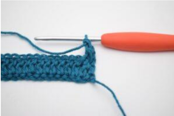
3. Like this. Now you have 1 fpdc.