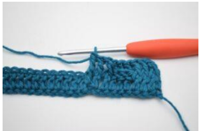
8. Work 1 fpdc around the next 3 sts.