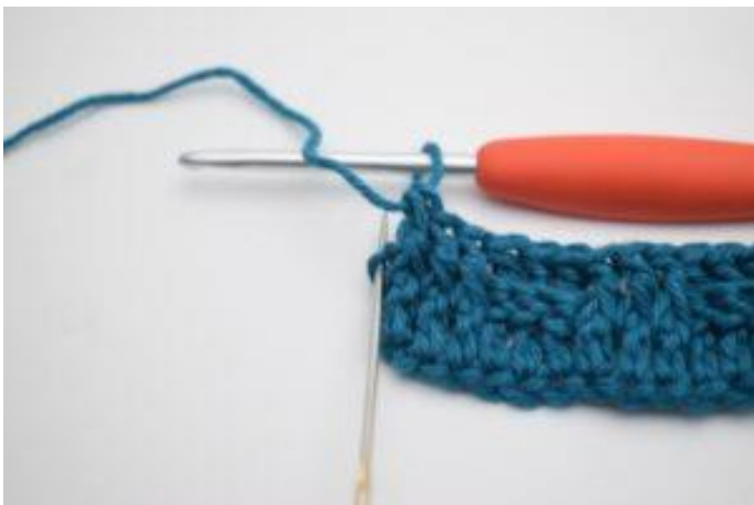
11. In the last st, work 1 regular dc.