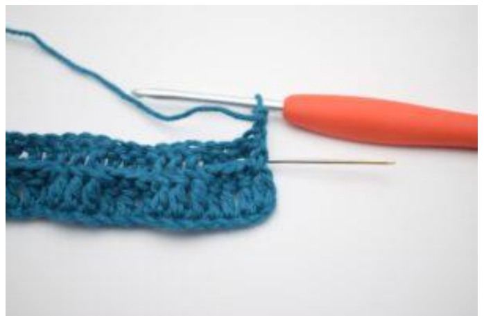
2. Work 1 bpdc around the first st.