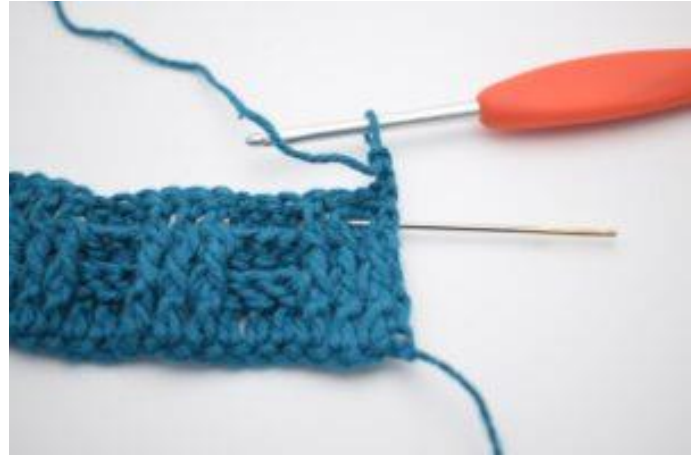
2. Work 1 bpdc around the first st.