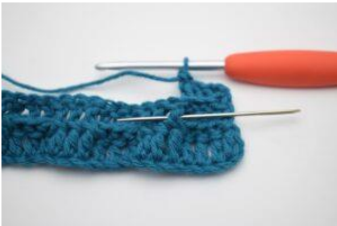
5. Work 1 fpdc around the next st.