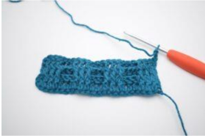
1. Ch 2 and turn.