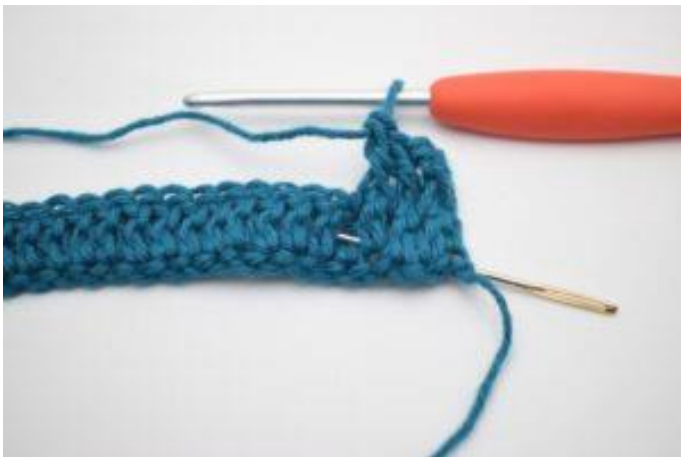
5. Work 1 bpdc. This is worked the same as a dc but from the back and around the post of the dc from the previous row. The needle indicates where to insert the hook.