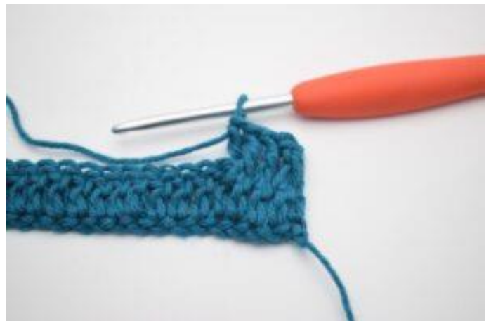
6. Like this. Now you have 1 bpdc.