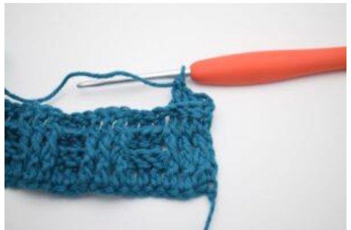
4. Work 1 bpdc around the next 2 sts.