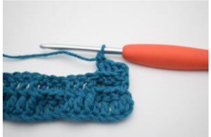
4. Work 1 bpdc around the next 2 sts.