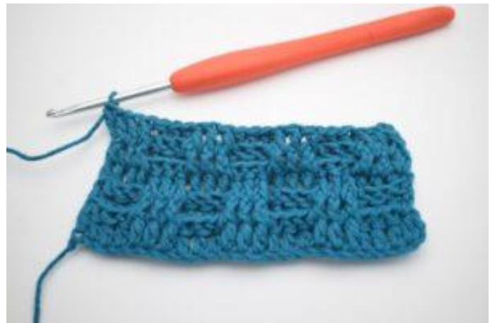
8. Continue alternating fpdc and bpdc around sets of 3 sts. The row ends with 3 fpdc. In the last st, work 1 regular dc. Repeat Rows 2-5 as instructed in the written pattern.