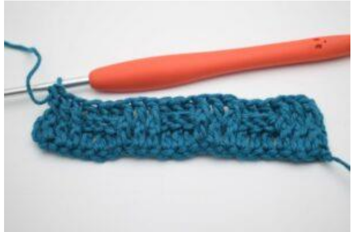
10. Continue alternating fpdc and bpdc around sets of 3 sts. The row ends with 3 fpdc.