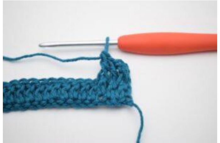
4. Work 1 fpdc around the next 2 sts.