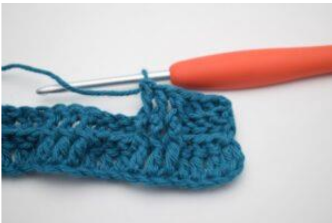
7. Work 1 fpdc around the next 2 sts.