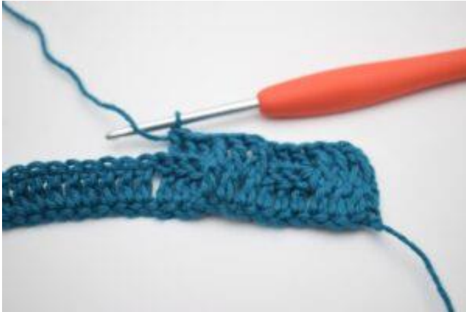
9. Work 1 bpdc around the next 3 sts.