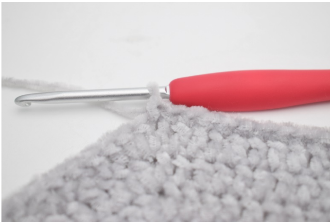
1. Ch 1. Work 1 sc into the first ch-space.