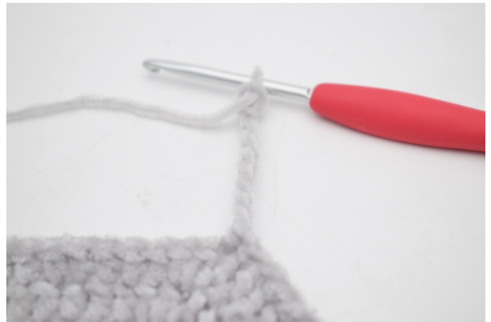
2. Ch 10.