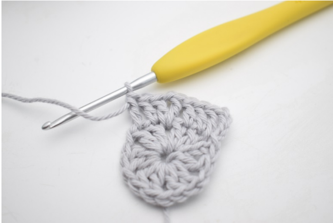
9. Work 1 dc in the next 2 sts.