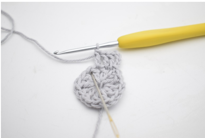
7. In the next ch-space work (1 dc, ch 1, 1 dc) The needle indicates where to work these sts.