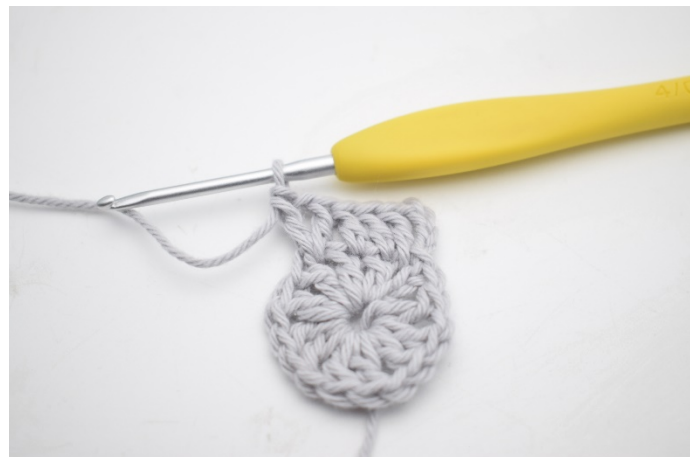
8. Like this.