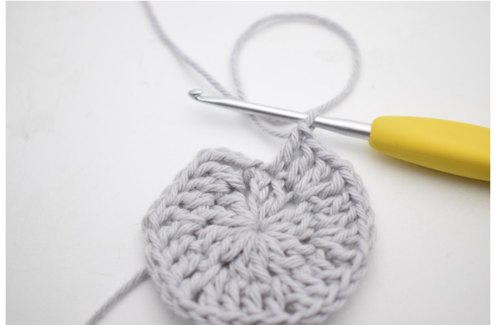
10. *In the next ch-space work (1 dc, ch 1, 1 dc). Work 1 dc in the next 2 sts.* Repeat * to * to the end of the rnd.