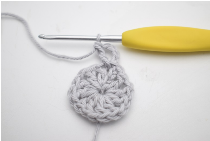
5. work 1 dc into the ch-space.