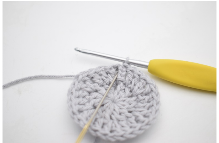
12. Sl st to the first ch-space. Where the needle is indicating.