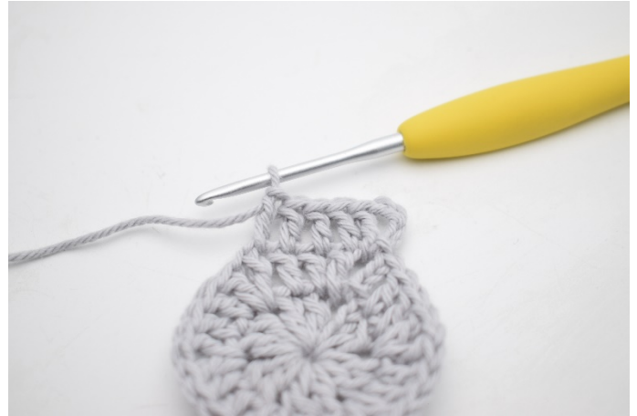
16. Work 1 dc in the next 4 sts.