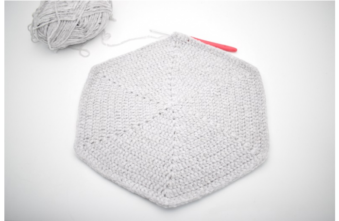
22. Continue in this manner until you have a total of 13 rnds.