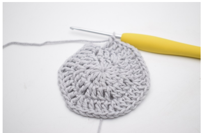
20. *In the next ch-space work (1 dc, ch 1, 1 dc). Work 1 dc in the next 4 sts.* Repeat * to * to the end of the rnd.