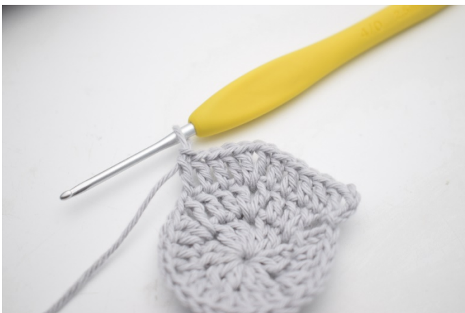
19. Work 1 dc in the next 4 sts.