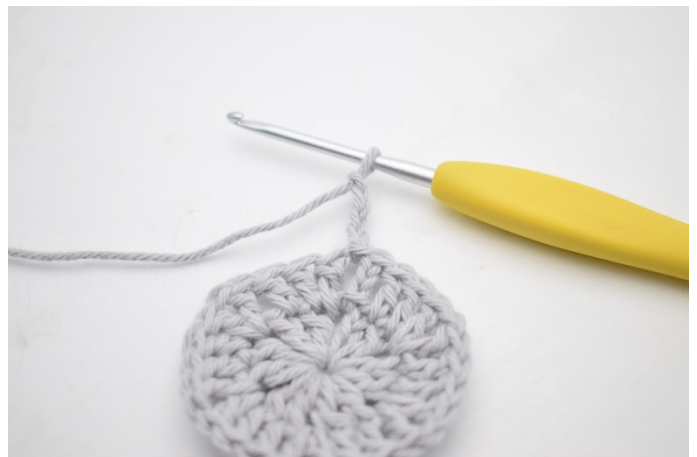
14. Ch 4 (counts as 1 dc + ch 1)