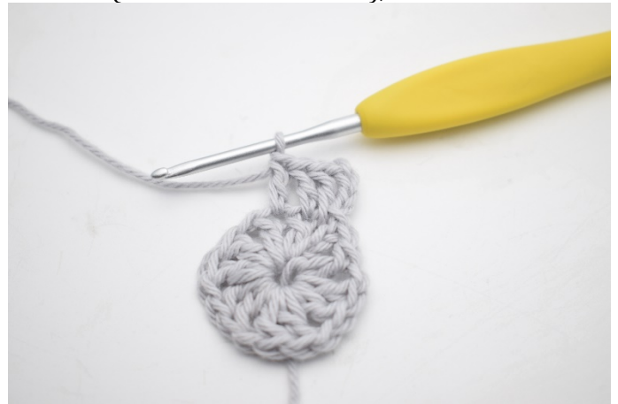
6. Work 1 dc into the next 2 sts.