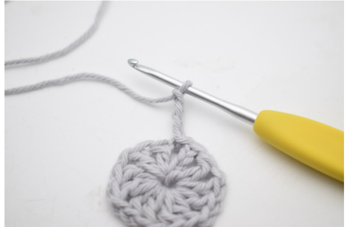
4. Ch 4 (counts as 1 dc + ch 1),