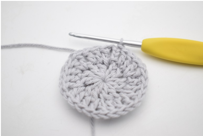
11. End with a sl st into the 3 rd ch of the starting ch.