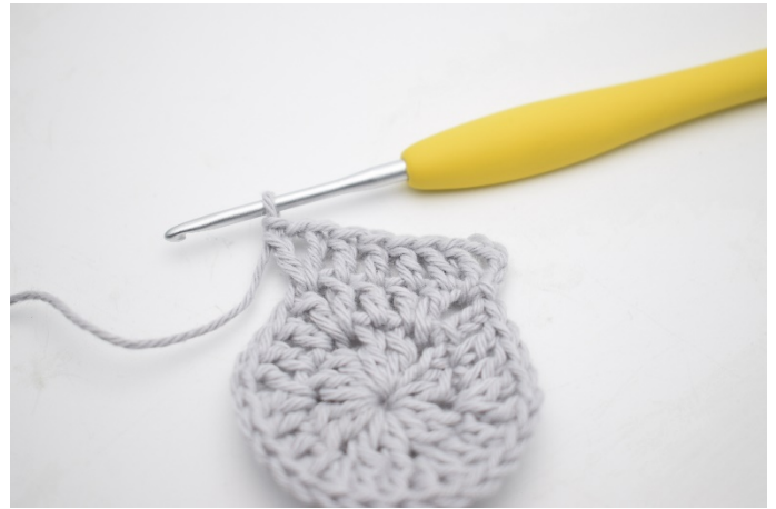
18. Like this.