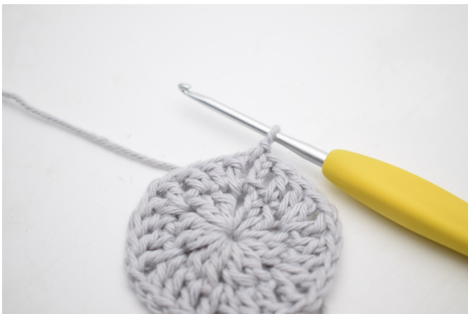
13. Like this.