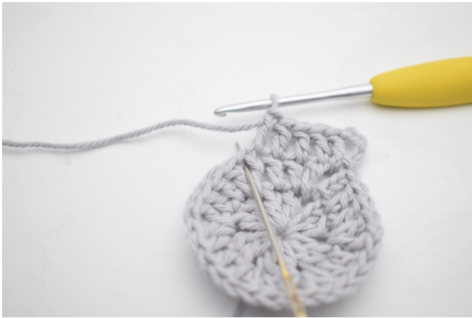
17. In the next ch-space work (1 dc, ch 1, 1 dc). The needle indicates where to work these sts.