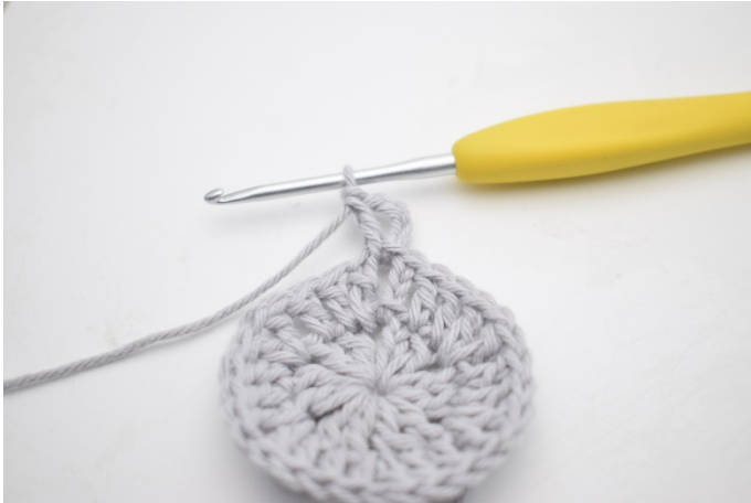
15. work 1 dc into the ch-space.