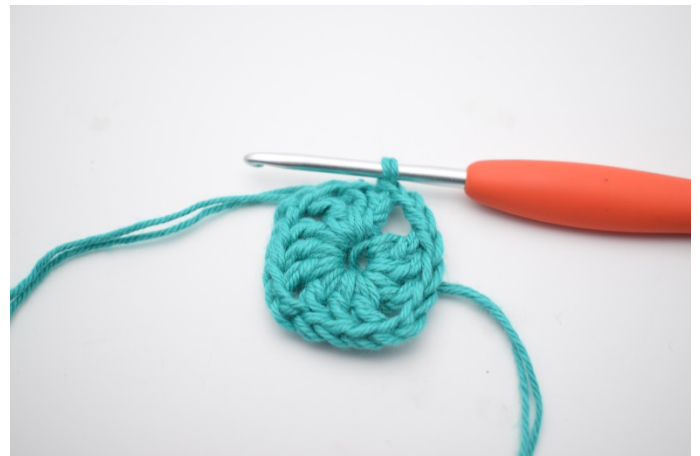
6. End with a sl st.