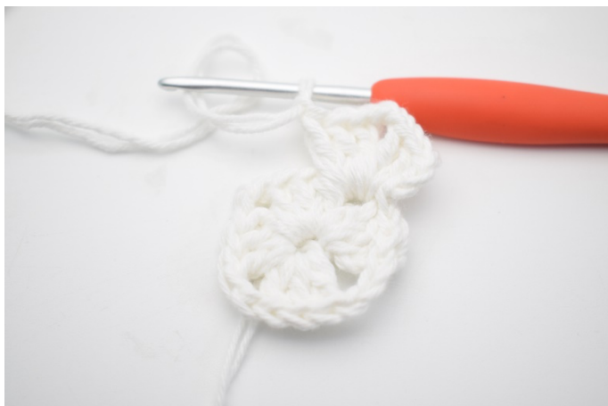
3. Ch 3, (2 dc, ch 2, 3 dc, ch 1) in the ch-space.