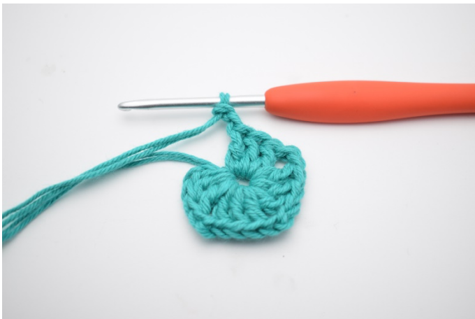
5. Repeat * to* a total of 3 times.