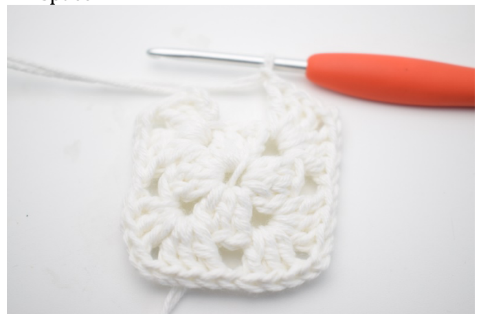
6. Repeat * to* a total of 3 times.