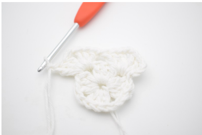
5. Like this.