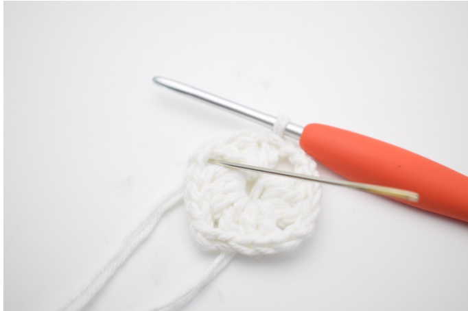
1. Sl st to the first ch-space.