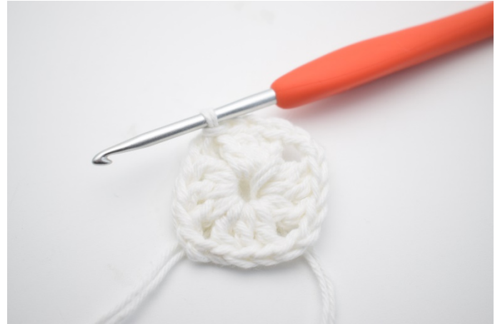
2. Like this.