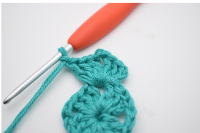
3. Ch 3, (2 dc, ch 2, 3 dc, ch 1) in the ch-space.