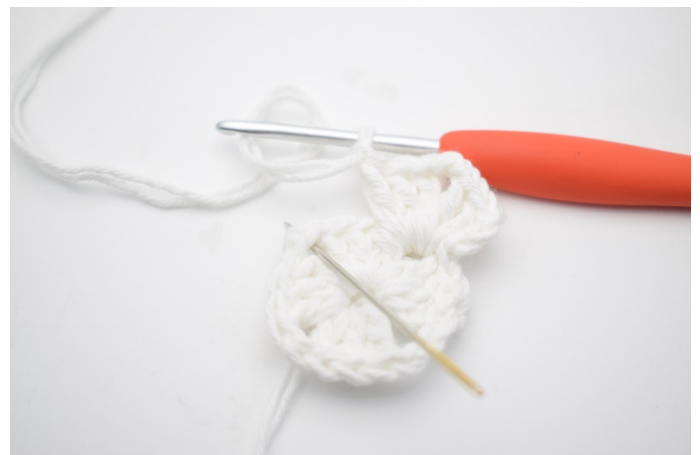
4. Work *(3dc, ch 2, 3 dc, ch 1) into the next ch-space*.