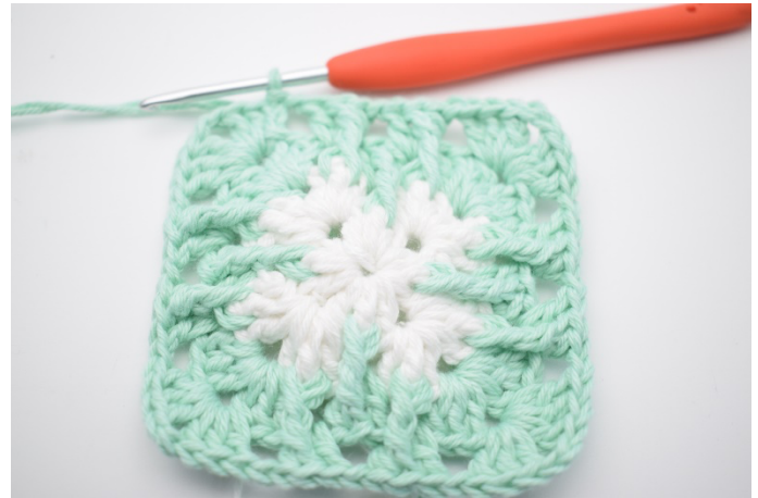
8. End with a sl st.