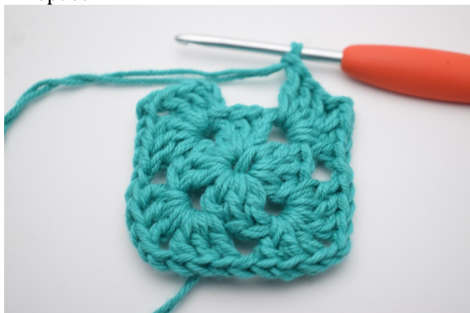
6. Repeat * to* a total of 3 times.