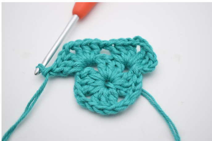
5. Like this.