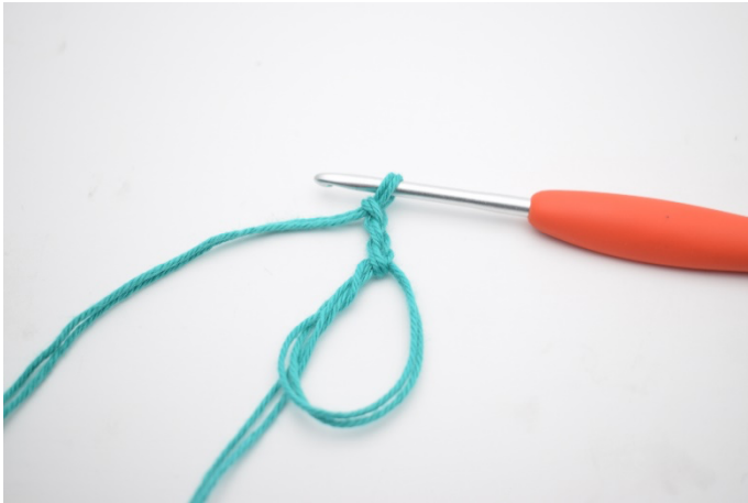
1. Begin with a magic loop. Ch 3