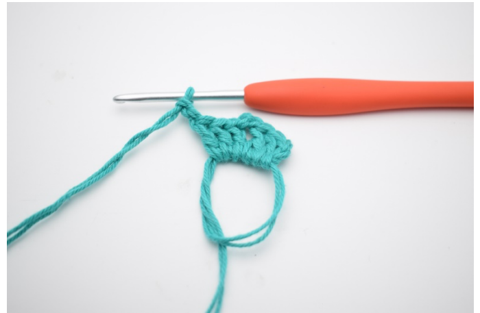
4. Work *3 dc, ch 2*