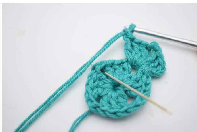
4. Work *(3dc, ch 2, 3 dc, ch 1) into the next ch-space*.