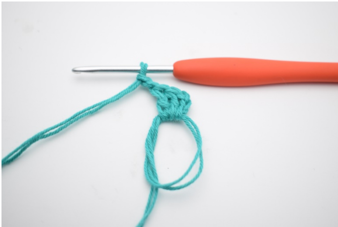
3. and ch 2.