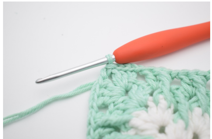
2. Like this.