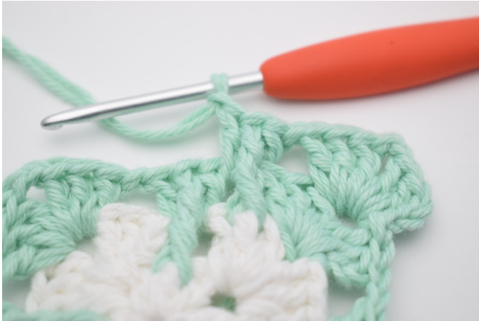
5. Like this.