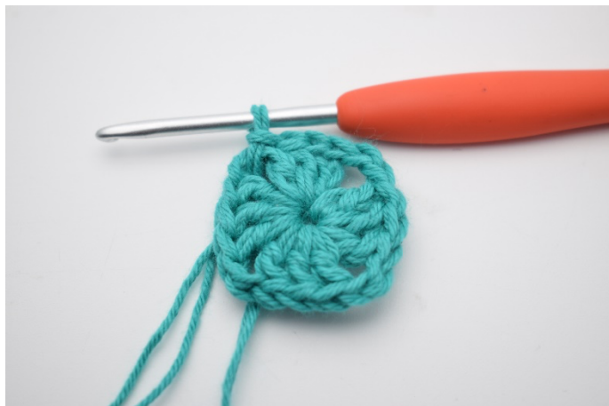
2. Like this.