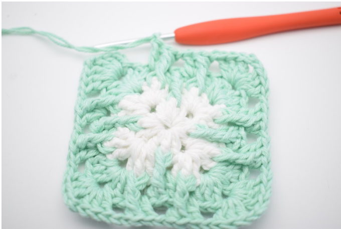
7. Work *(3dc, ch 2, 3 dc and ch 1) in the next ch-space. In the next 2 ch-spaces work (1 dc, 1 fptc around the middle st from the dc group from rnd 2, 1 dc, ch 1).* Repeat * to* a total of 3 times.