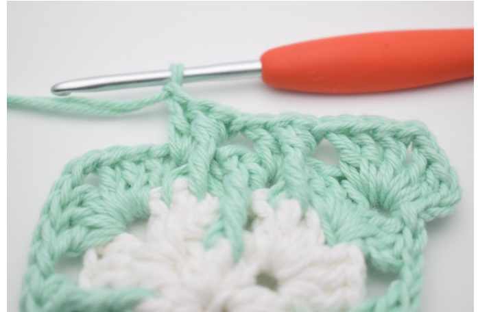
6. Repeat in the next ch-space.