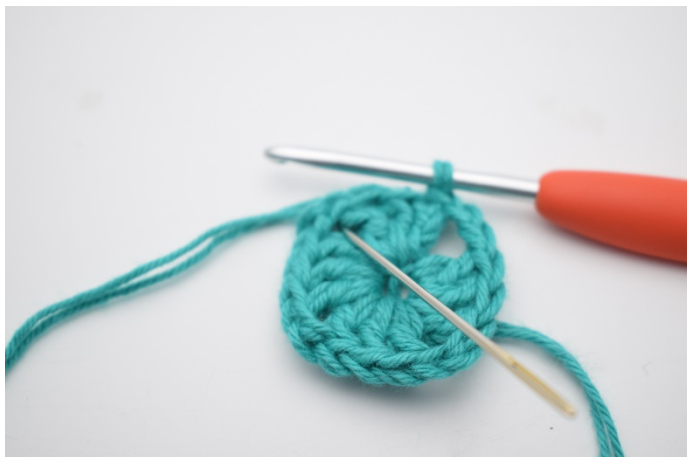
1. Sl st to the first ch-space.