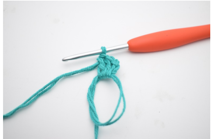
2. work 2 dc,