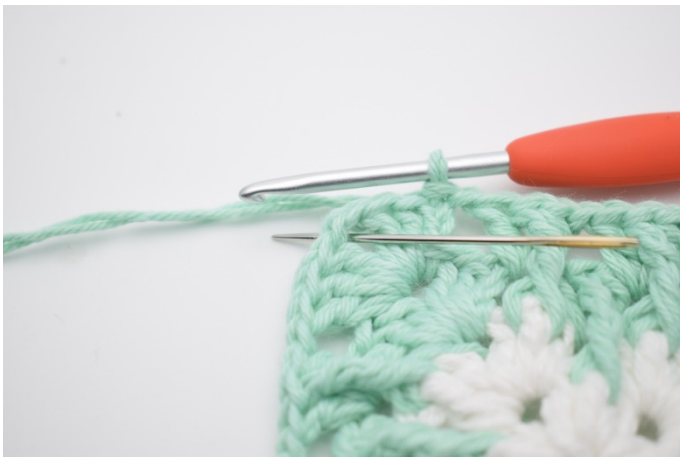
1. Sl st to the first ch-space.