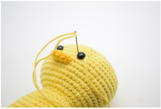
2. Press the needle down on the other side of the eye and pull a little.