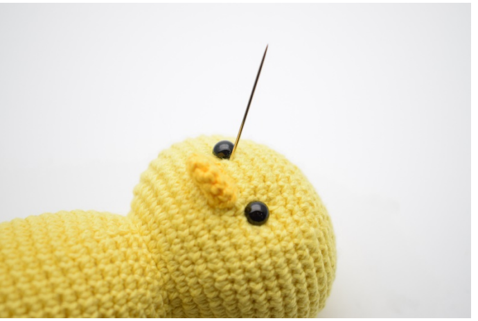
3. Pull the needle out on one side of the other eye.