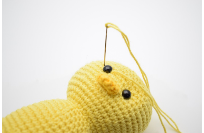
4. ...and press down on the other side of the eye.