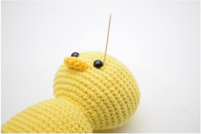
1. With yellow yarn, pull the needle out on one side of the eye.

Make indentations by the eyes in the following way: