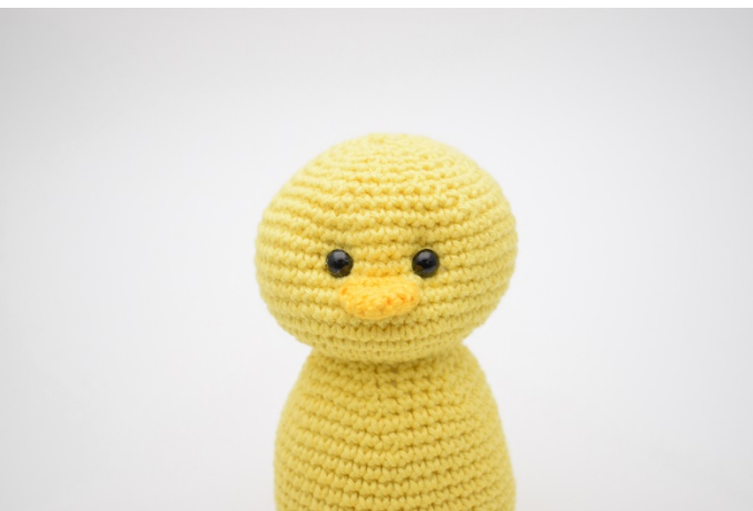
5. Pull a little on the yarn so the eyes are pulled inwards a little and indentations are made.