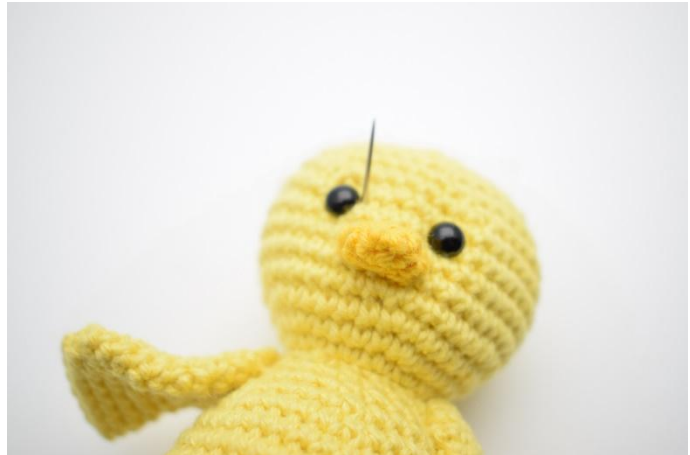
3. Pull the needle out of the side of the other eye,