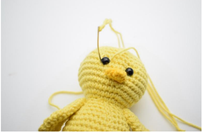
4. and down again at the other side of the eye.