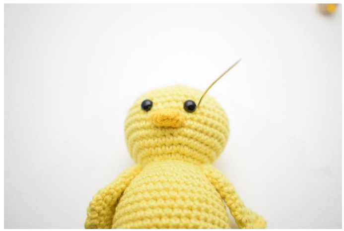
1. In yellow yarn, pull the needle out of the side of one of the eyes.