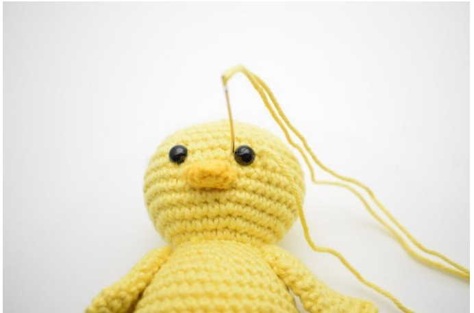
2. Insert the needle into the other side of the eye and pull a bit.