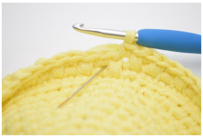
8. The needle indicates where to insert the hook for the long-sc.