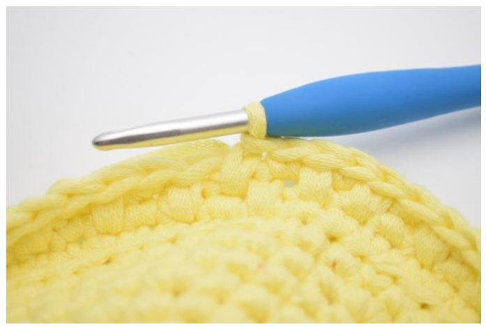
9. Like this.