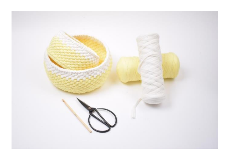
Enjoy! © Best Wishes, Hobbii.com