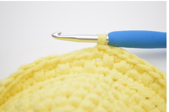
7. On the next rnd work "1 sc, 1 long-sc".