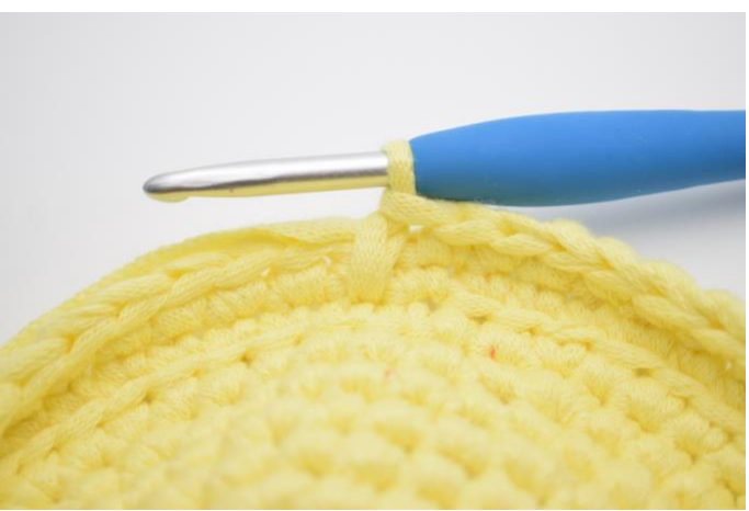
1. Like this. You now have 1 long-sc.