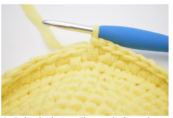
6. End with 1 long-sc. This was the first rnd.