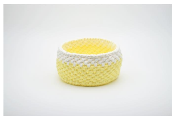
13. Cut the yarn and weave in the ends.