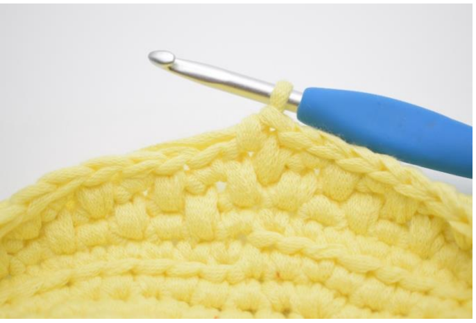
11. work "1 sc, 1 long-sc" to the end of the rnd. End with 1 sc.