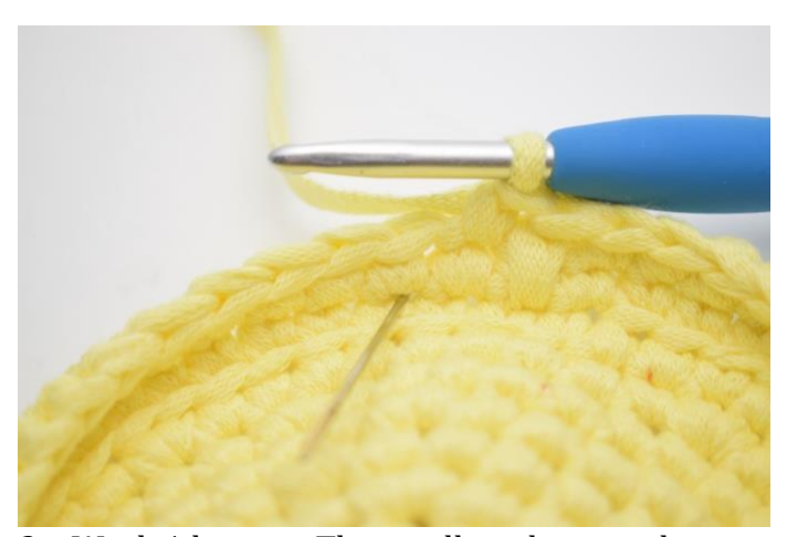
3. Work 1 long-sc. The needle indicates where to 4. Like this. insert the hook.