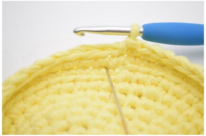
6. Now you will begin the pattern with alternating sc and long-sc. Work 1 long-sc. This means working a regular sc but into the row below where you would normally work. The needle indicates where to insert the hook.