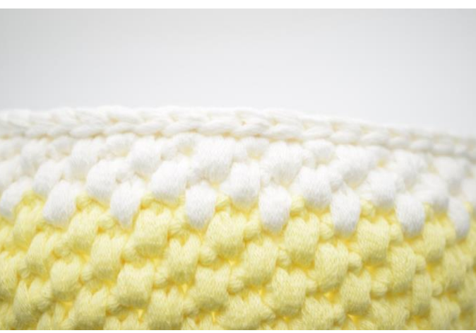
12. Continue alternating these rows as instructed in the pattern. The last 3 rnds are worked in White. End with 1 rnd of sl st.