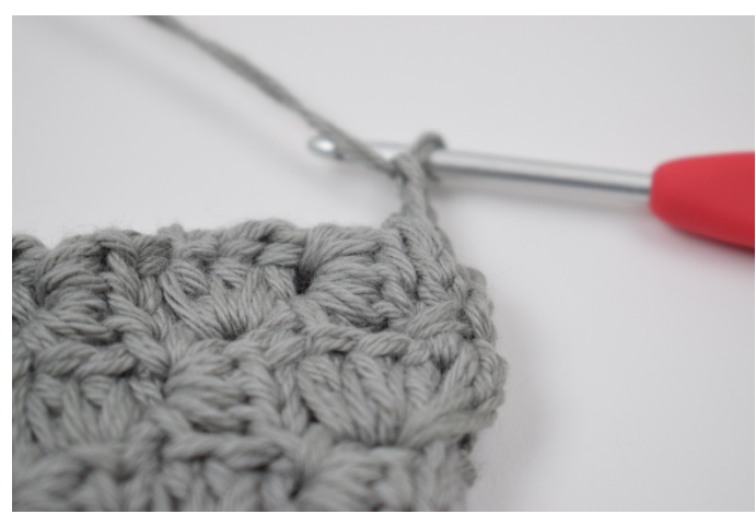
6. Ch 2.