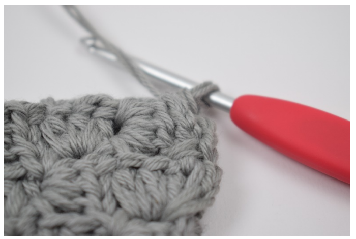
5. Crochet 1 sc in the corner.