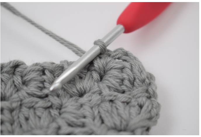
7. Crochet 1 sc in between the next 2 "tiles".