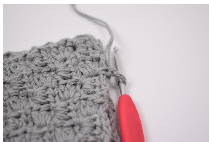
2. Ch 2.