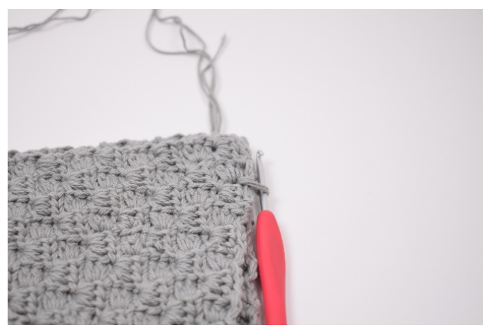
1. Place the pieces on top of each other. Begin assembling approx. 2 cm under the right top corner. Attach the yarn through both pieces in between 2 "tiles".