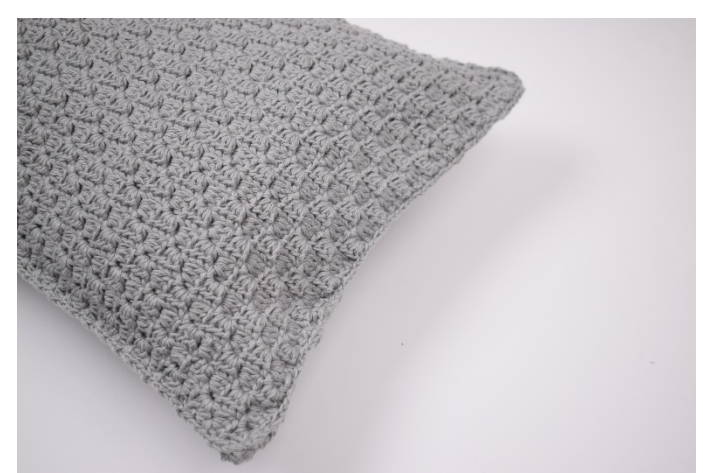
8. Repeat this around the pillow. Insert the pillow before the sides are completely closed. Finish with 1 sl st. Cut the yarn and weave in ends.