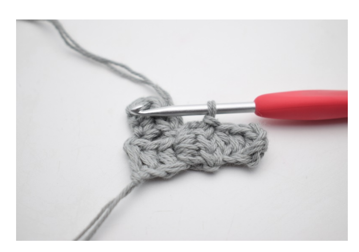
Ch 2 (replaces 1 hdc). Crochet 3 hdc in the same "space", where you just crocheted your sl st and 2 ch. Crochet 1 sl st in the left corner of the 2^{nd} "tile" from the previous row. You have made one more "tile" there are now 2 "tiles" on your row.