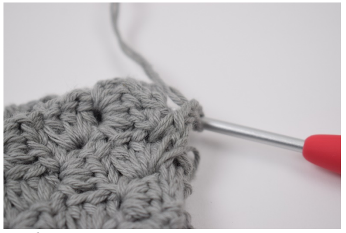
4. Ch 2.