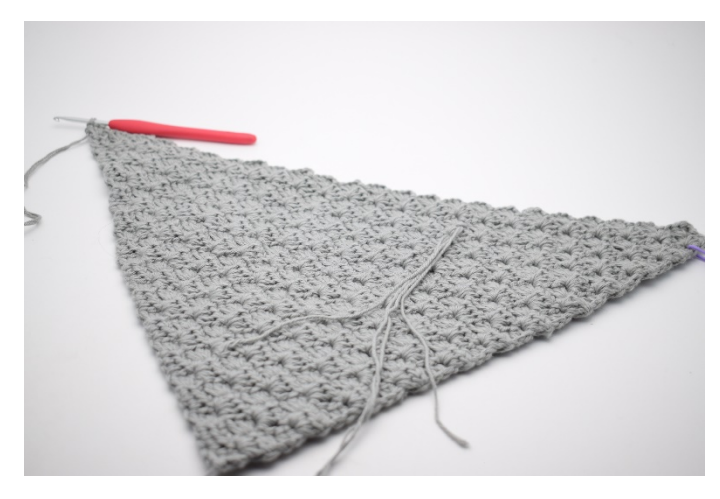
26. You still need to increase at this side.

Turn your piece with ch 5. Crochet 1 hdc in the 3^{rd} ch from the hook. Crochet 1 hdc in the next 2 ch. Crochet 1 sl st in the left corner of the 1^{st} "tile" from the previous row. Crochet the rest of the row as usual.