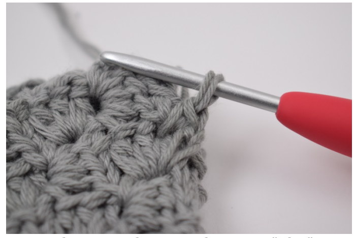
3. Crochet 1 sc in between the next 2 "tiles".