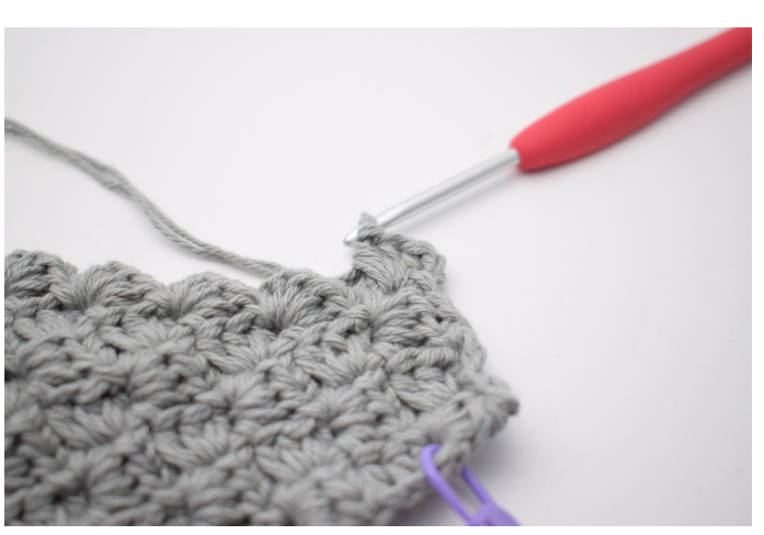
28. – 39. Repeat these rows and continue increasing on the long side until you have a total of 39 tiles.