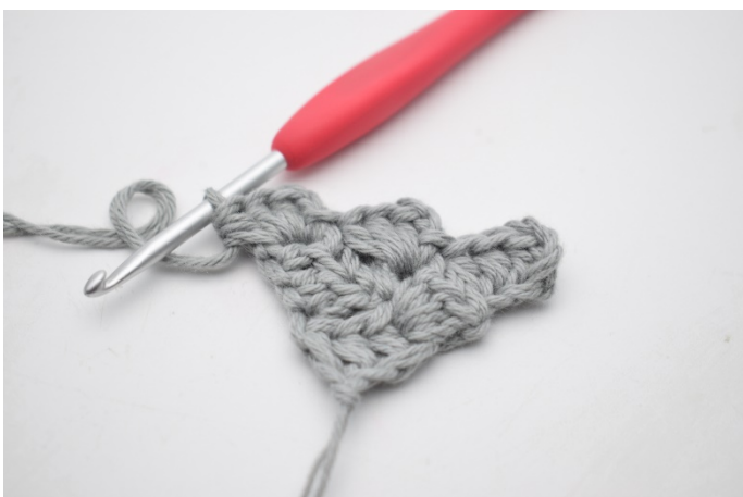
4. – 24. Repeat the rows until you have crocheted 24 tiles.