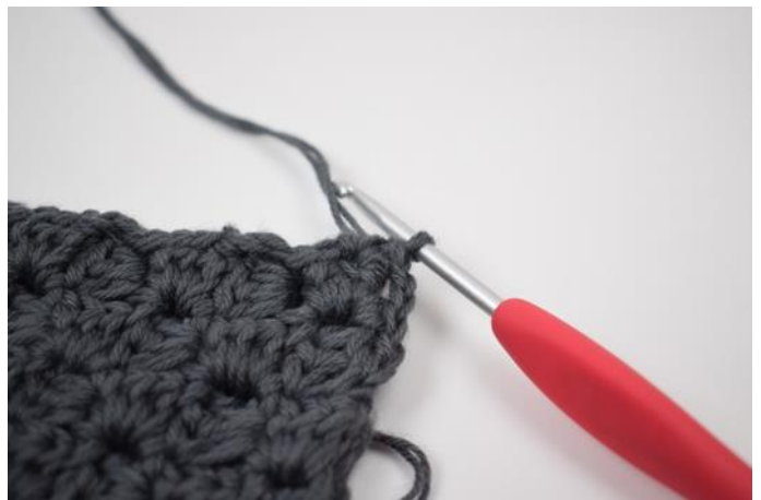
6. Work 1 sc in the corner.