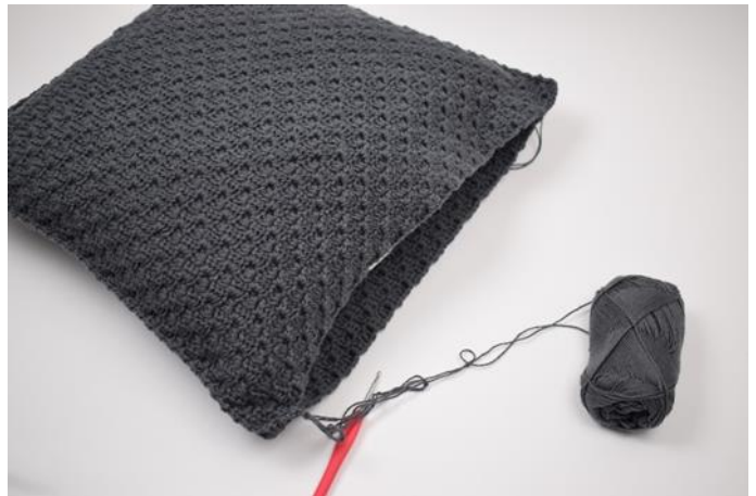
10. Insert the cushion (the filling) before you close it completely.