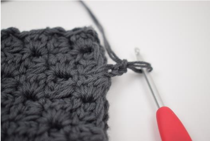
3. Ch 2.