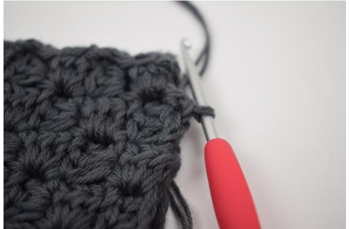
4. Work 1 sc between the next 2 "squares".