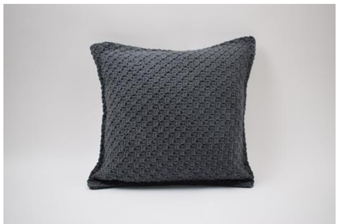
12. Cut the yarn and weave in ends.