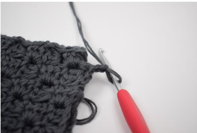
5. Ch 2.