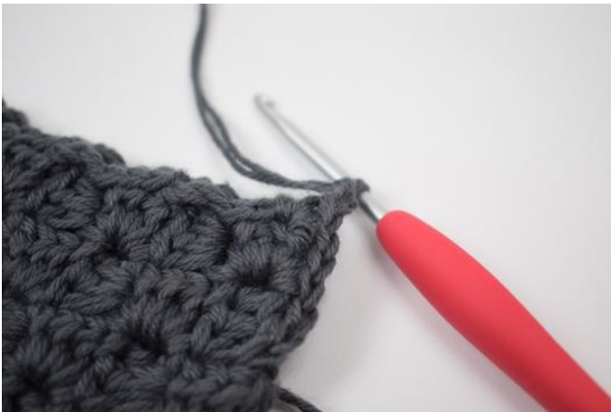
7. Ch 2.