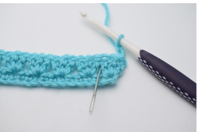
10. Work in the interspaces between the dc groups of the previous row.