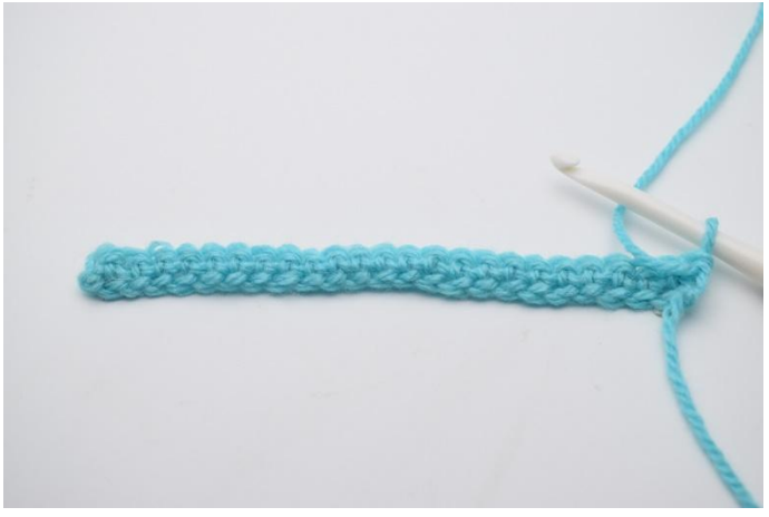
2. In the 2nd ch s from the hook you work 1 sc. Continue with sc till the end of the row.