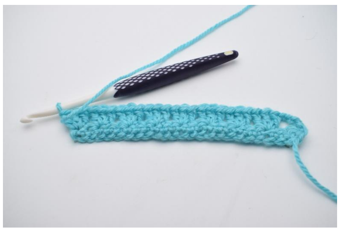
8. Repeat till the end of the row. Finish the row with 1 dc group.