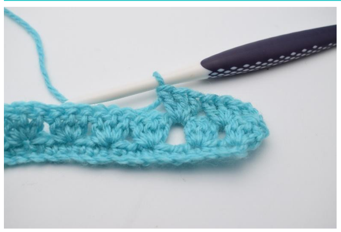
13. Work 1 dc group.