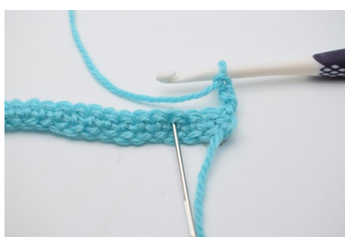
4. Skip 2 stitches