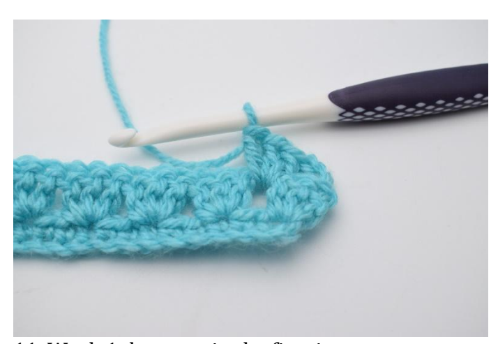
11. Work 1 dc group in the first interspace.