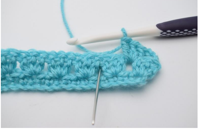
12. Next dc group is worked in the interspace between the dc groups o the previous row.