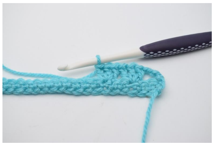
7. In the next s, work 1 dc group.