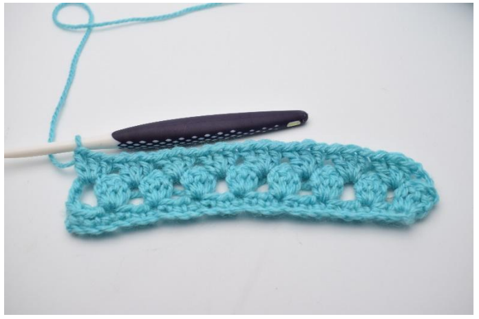
14. Repeat till the end of the row. Finish the row with 1 dc group between the interspace of the last dc group and the 3 ch sts of the previous row.