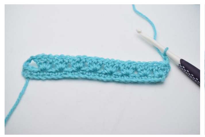
9. Turn your work by chaining 3.