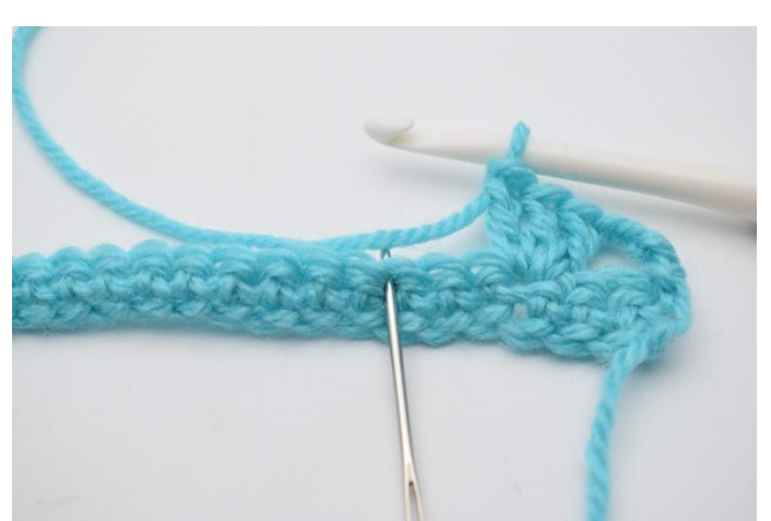
6. Skip 2 stitches.