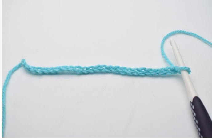
1. Start by chaining 184.