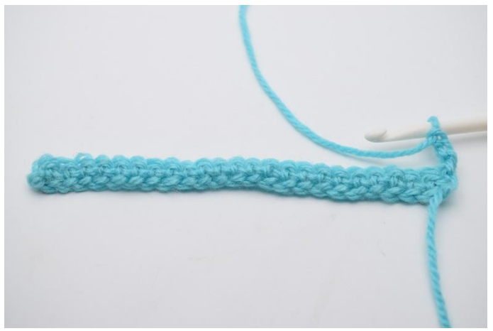
3. Turn your work by chaining 3.