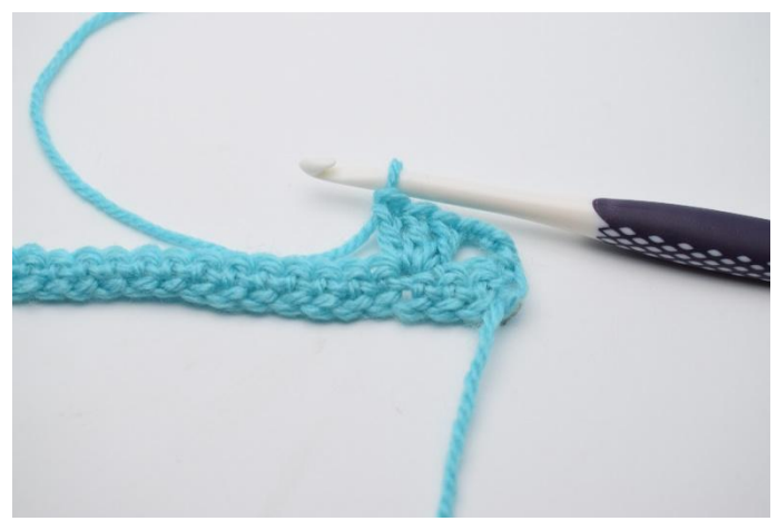
5.In the next s, work 1 dc group.