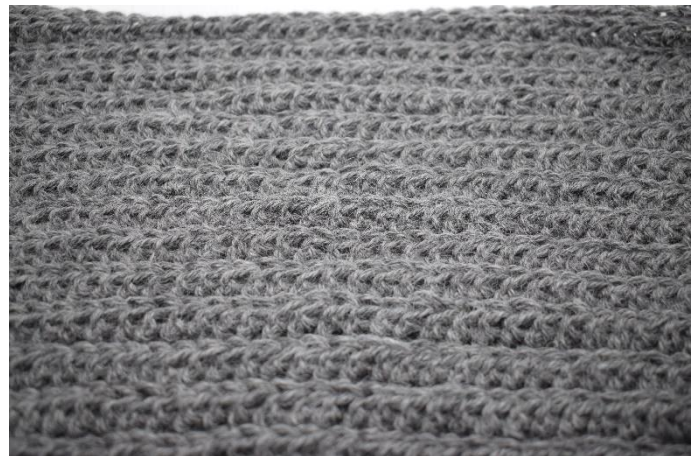
6. Continue repeating row 2 for a total of 27 times.