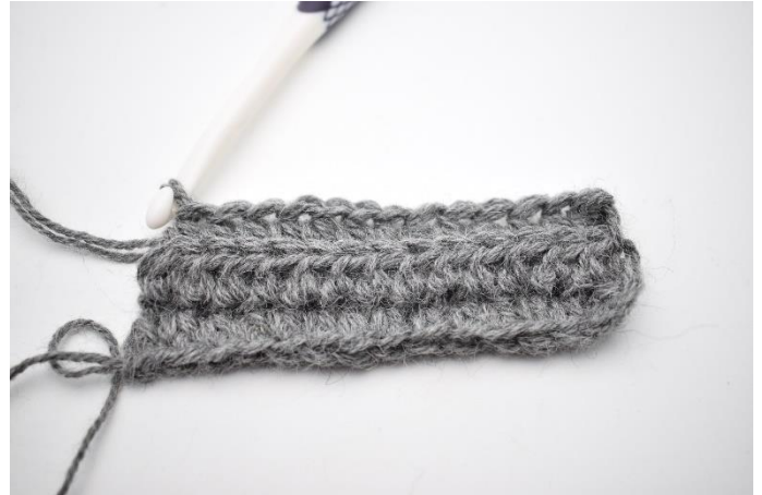
4. Repeat to the end of the row. In the last st, work 1 hdc through both the front and back loops to avoid having a hold on the edge.