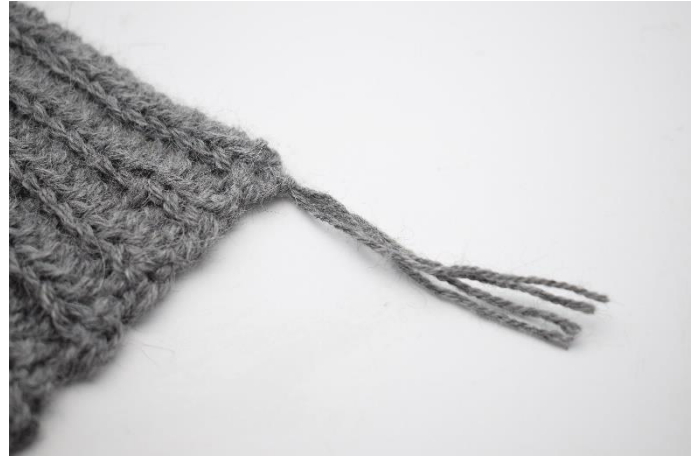
6. Pull to form a knot.