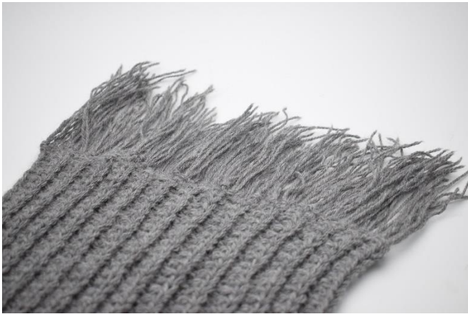
7. Repeat across the short end of the scarf.