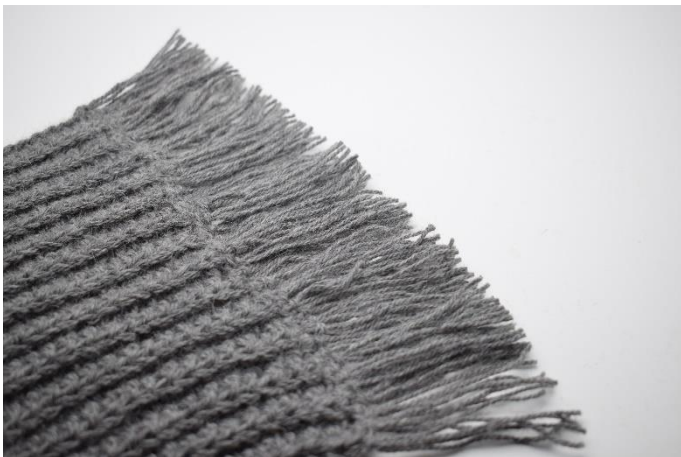
9. Repeat this process on the other end of the scarf.