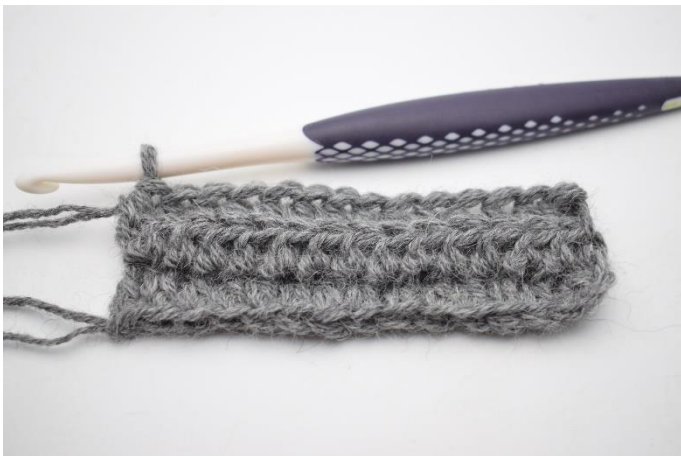
5. Like this.