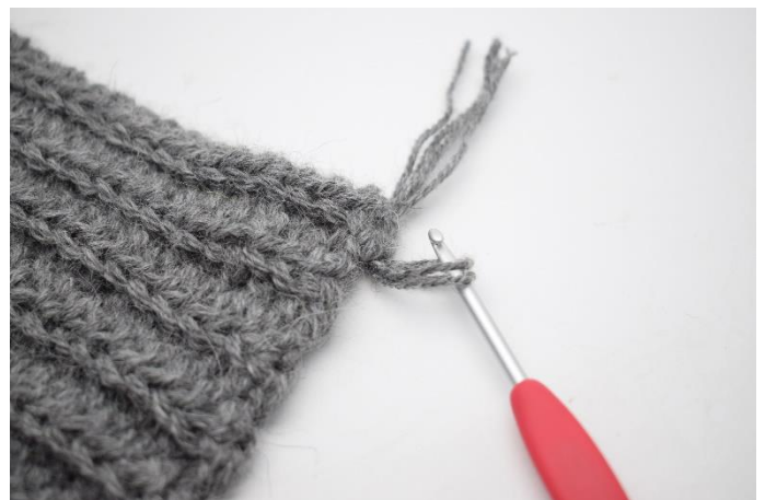
4. Pull the fringe pieces through the st using the crochet hook as shown.