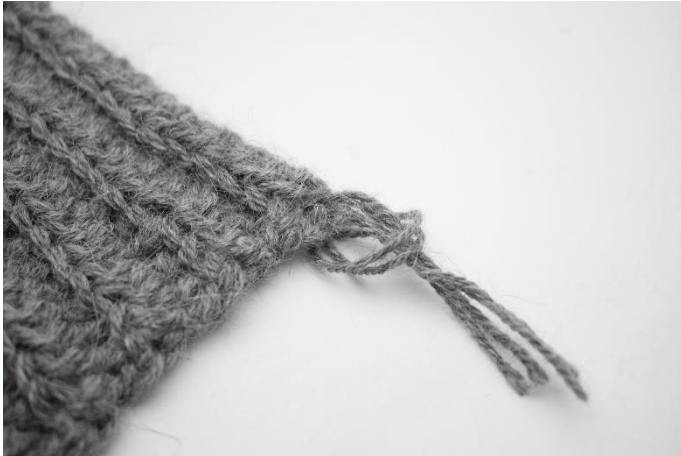
5. Pull the ends of the yarn through the loop.