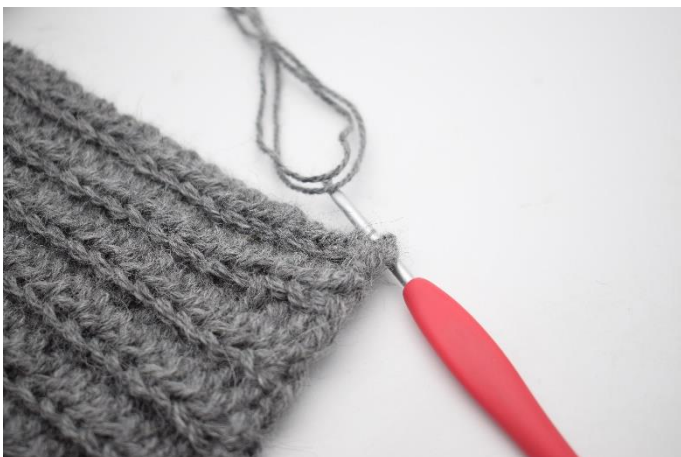
3. Using a smaller crochet hook, insert the hook in one of the sts along the edge of the scarf.