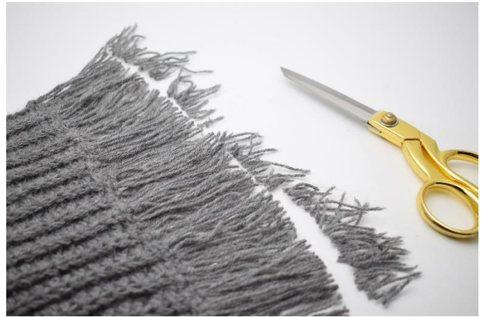
8. Trim approx. 1/2" off of the fringe to make it even.