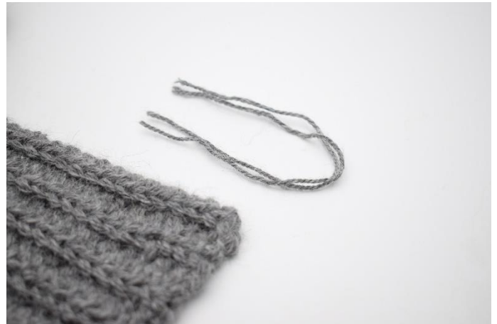
2. Fold the pieces in half.