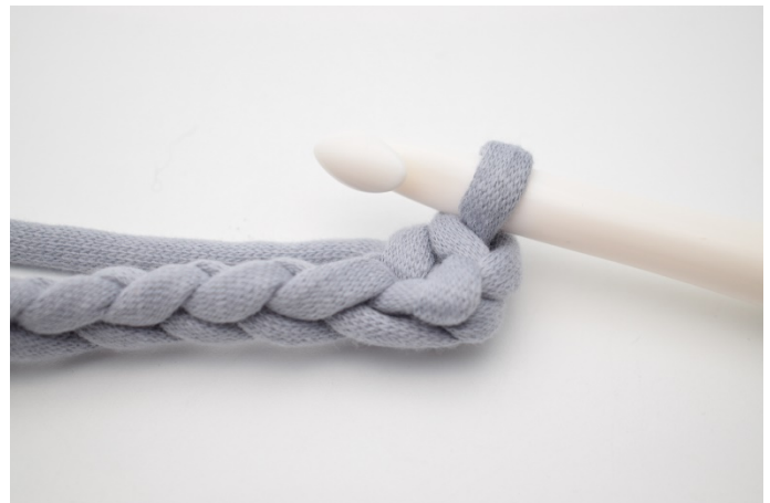
4. Like this.