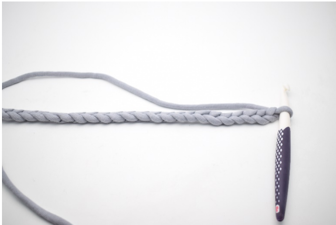
1. Ch 31.