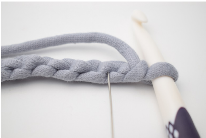
3. The row will look much neater if you work your sc's in the horizontal loops. The needle on the photo shows which loop to work your first sc.