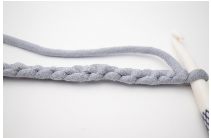
2. Turn your ch-row around to let the "backside" face up.