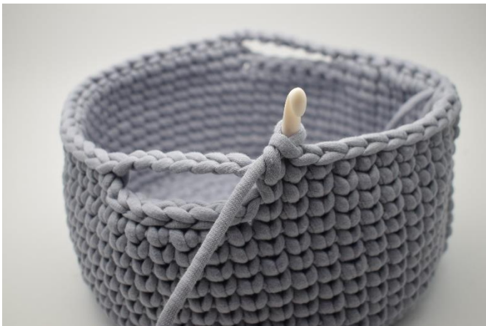
1. Ch 1 and work 1 ks in each of the first 11 st.