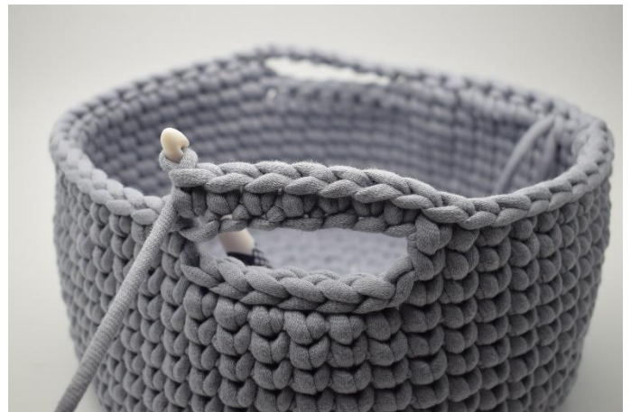
2. Work 1 sc in each of the 7 ch st from previous round.