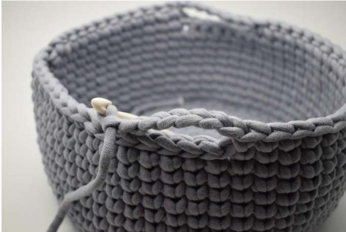
5. Ch 7 and skip the 6 sl st from previous round.