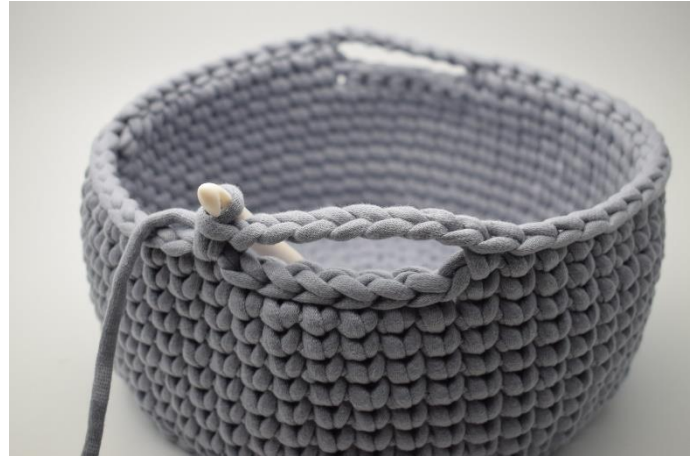
6. Like this.