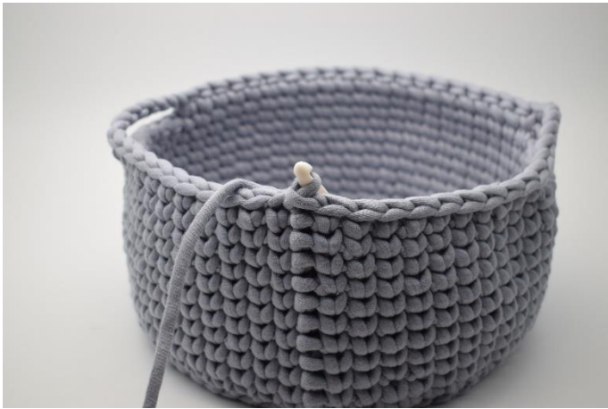
7. Work 1 ks in each of the last 10 st.