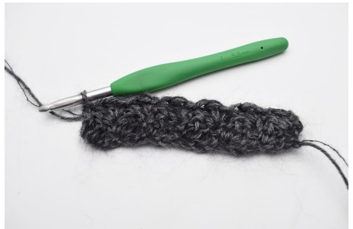
10. crochet 1sc.