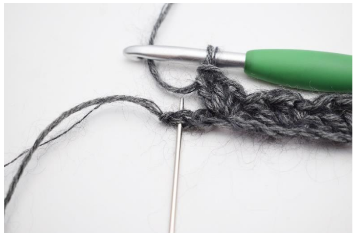
8. Miss 1 ch.