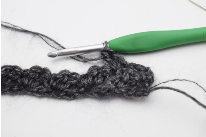
5. Crochet 1 sc and 2 dc in the next st.