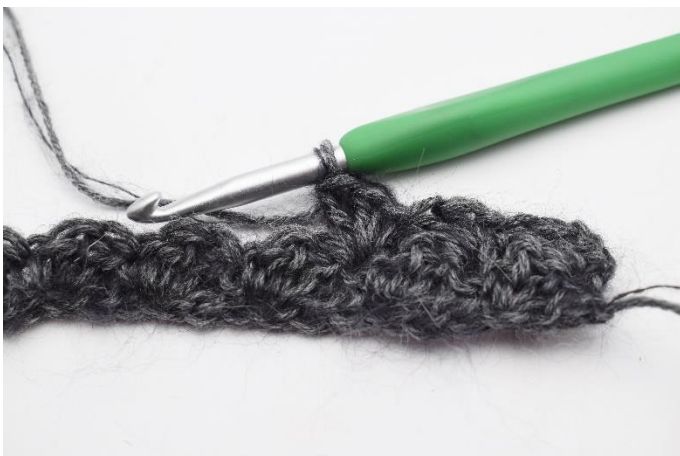
7. Crochet 1 sc and 2 dc in the next st.