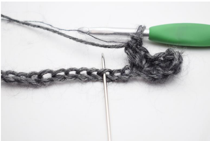
5. Miss 2 ch.