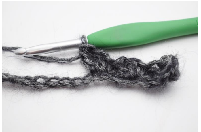
6. Crochet 1 sc and 2 dc in the next ch.