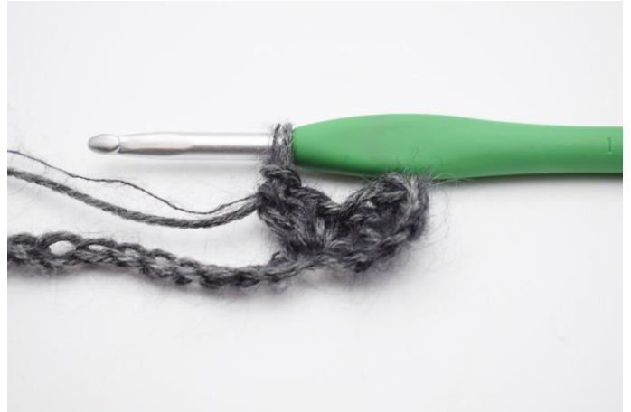
4. Crochet 1 sc and 2 dc in the next ch.