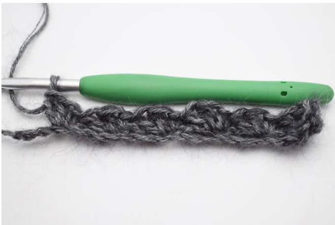
7. Miss 2 ch, crochet 1 sc and 2 dc in the next ch. Repeat until you have 2 ch left of the row.