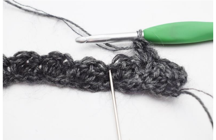
6. Miss 2 st,