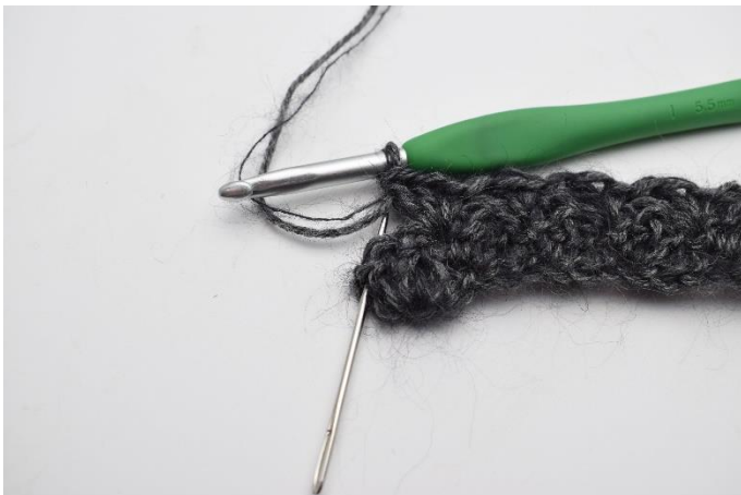
9. In your turning st, (here the needle shows your turning st from the previous row)