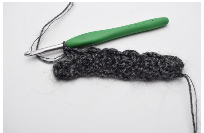
8. "Miss 2 st, crochet 1 sc and 2 dc in the next st". Repeat from " to " until the end of the row.