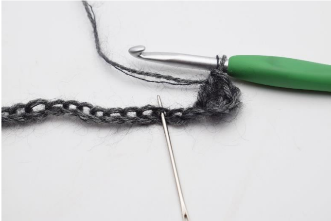
3. Miss 2 ch.