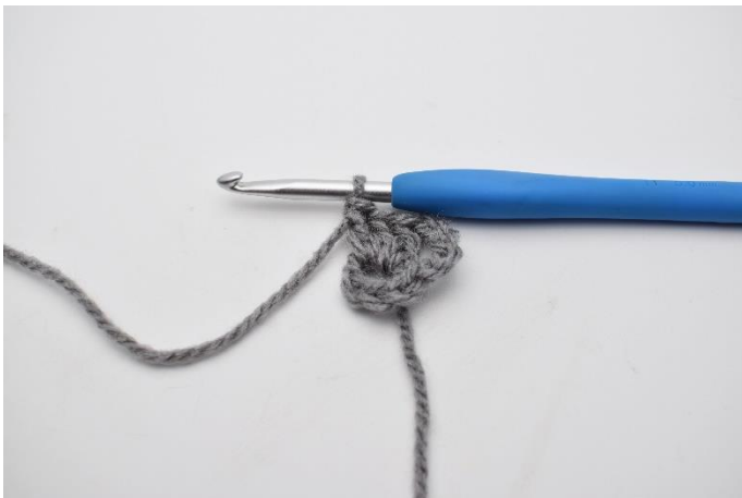
3. Crochet 3 dc into the ring.