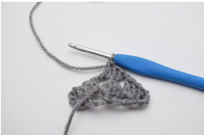
11. Crochet 1 dc cluster.