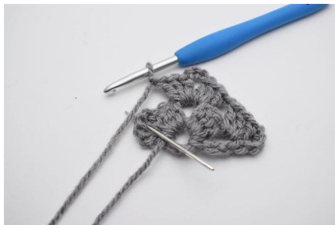
14. Ch 1. The next cluster is made in the ch-space shown by the needle.