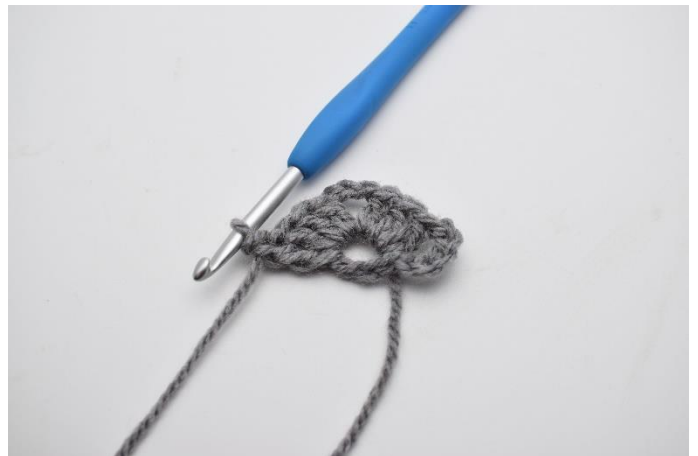
6. Ch 1 and crochet 1 tr into the ring.