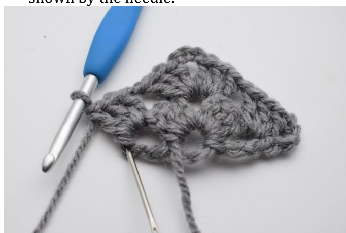
16. Ch 1. The needle now shows the 4 th chain in the previous row.