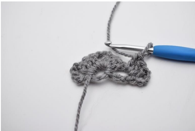
9. Crochet 1 dc cluster.