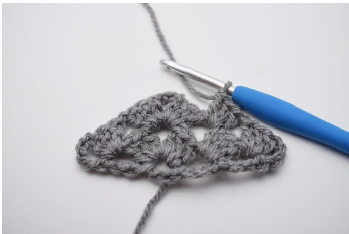
22. Crochet 1 dc cluster.