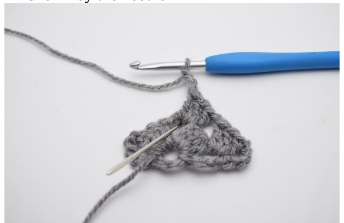
12. Ch 3. You will crochet into the same ch-space as before.