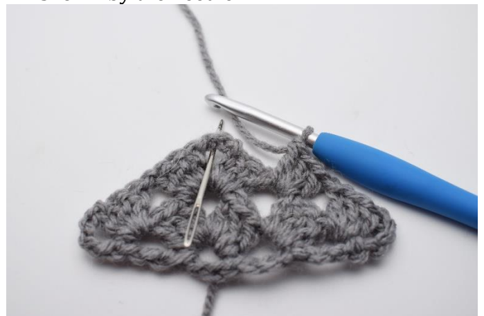
23. Ch 1. The next cluster is made in the ch-space shown by the needle