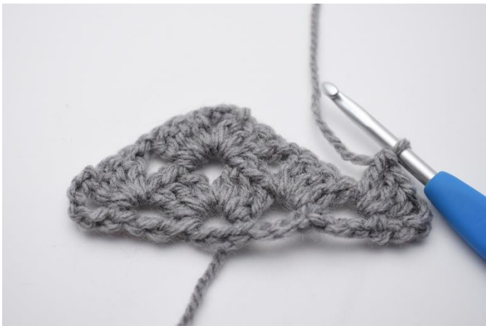
20. Crochet 1 dc cluster.