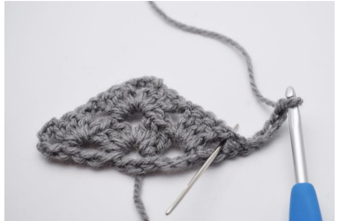
19. The next cluster is made in the ch-space shown by the needle.