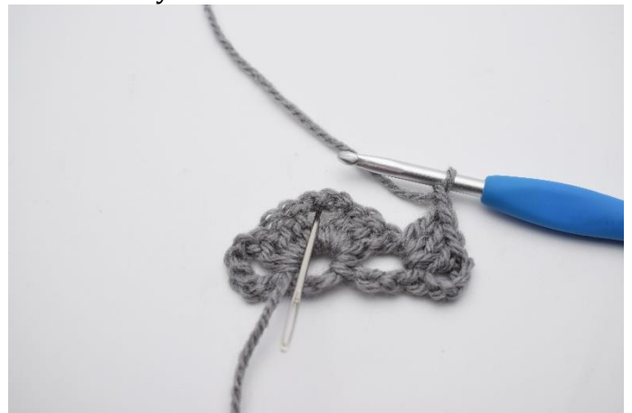
10. Ch 1. The next cluster is made in the ch-space shown by the needle.