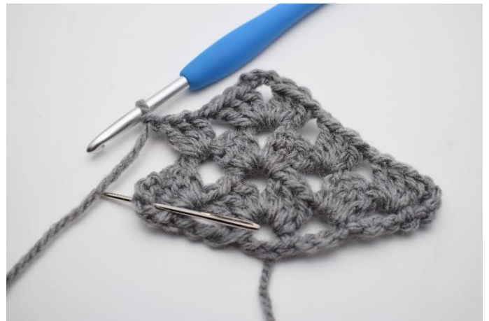
27. Ch 1. The next cluster is made in the ch-space shown by the needle