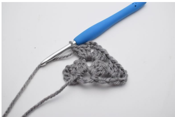
13. Crochet 1 dc cluster.