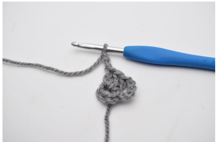
4. Ch 3.