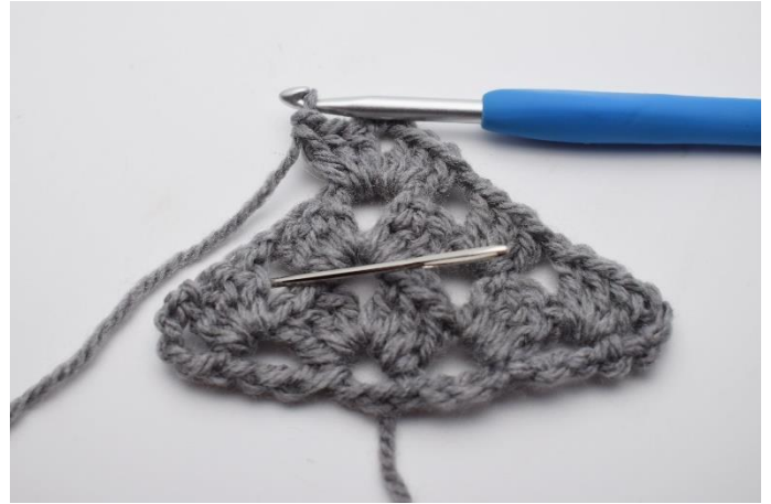
25. Ch 1. The next cluster is made in the ch-space shown by the needle