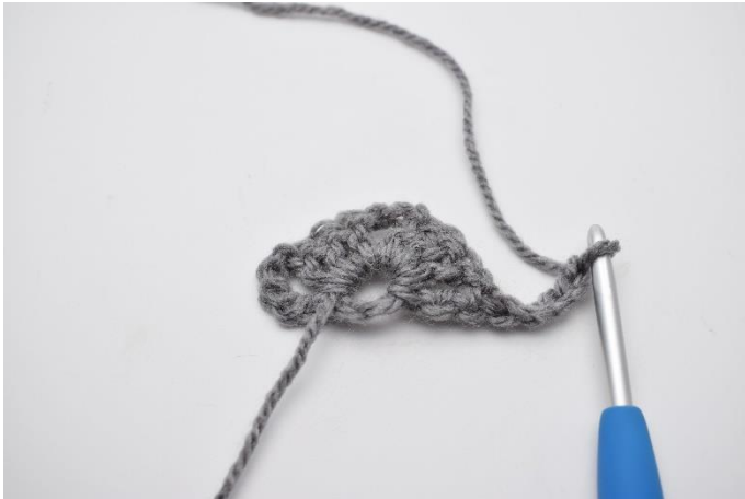
7. Ch 5 and turn the work.