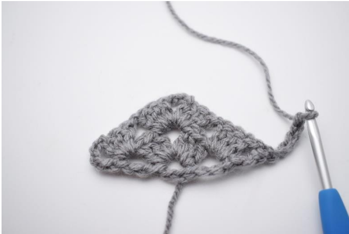
18. Ch 5 and turn the work.