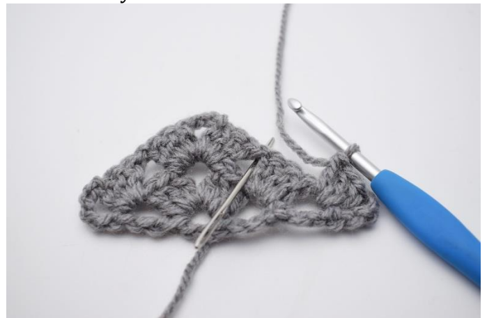
21. Ch 1. The next cluster is made in the ch-space shown by the needle.