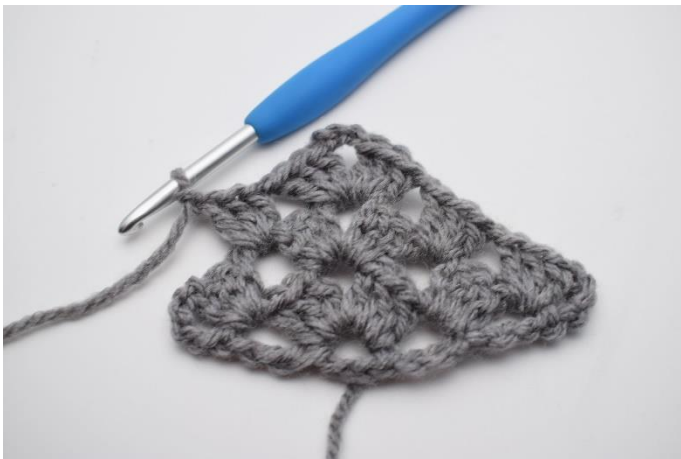
26. Crochet 1 dc cluster.