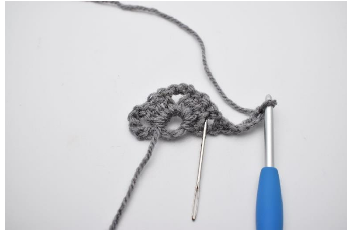
8. The next cluster is made in the ch-space shown by the needle.