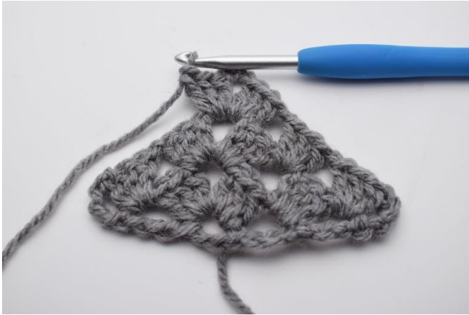
24. Crochet 1 dc cluster, ch 3, 1 dc cluster in the ch-space.