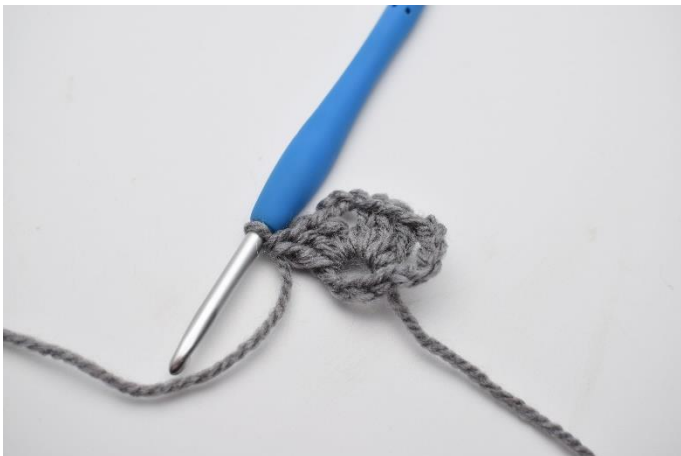
5. Crochet 3 dc into the ring.