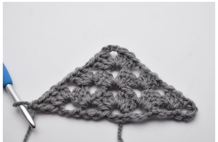
29. Ch 1 and crochet 1 tr in the 4 th ch from the previous row.