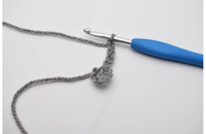
2. Ch 5.