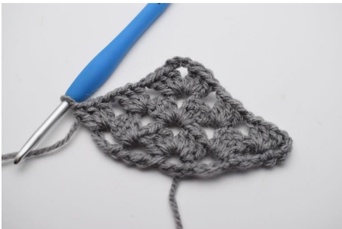
28. Crochet 1 dc cluster.