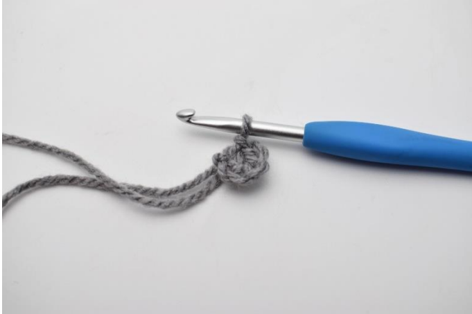
1. Ch 6, and join with a slip stitch to make a ring.