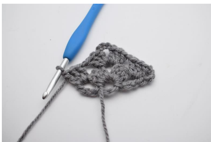
15. Crochet 1 dc cluster.