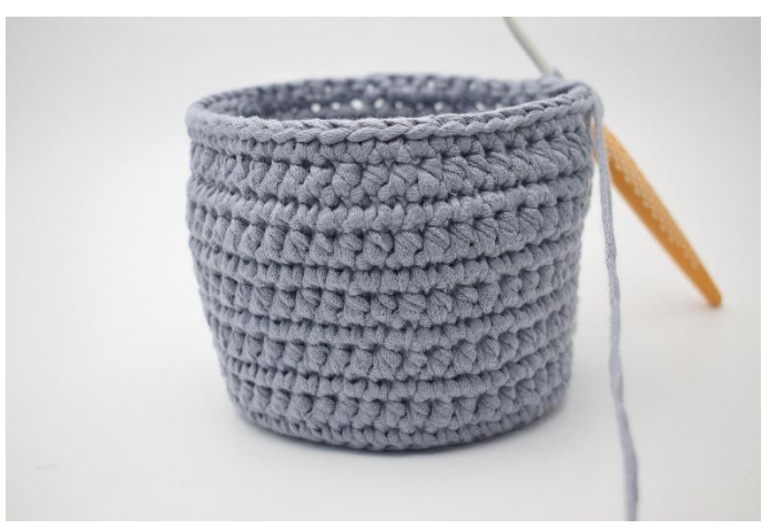
8. Repeat these 2 rnds until you reach the desired height of the basket as described in the pattern.