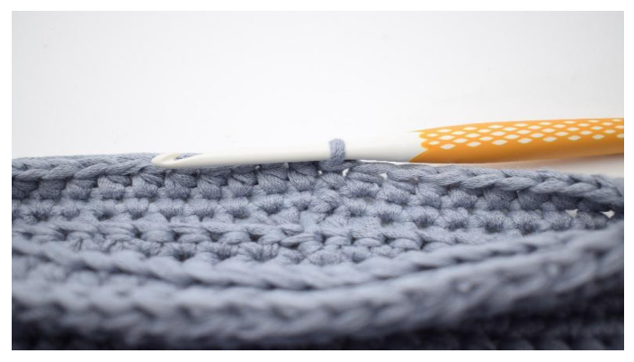
13. Ch 1, Work hdc in each st to the end of the rnd. End with a sl st in the first hdc.