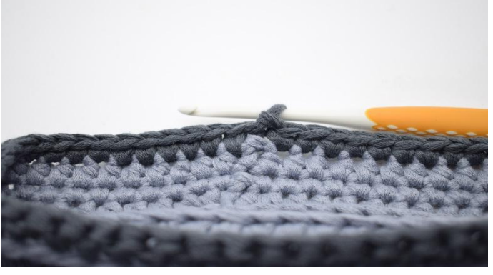
14. Change to a second color. Ch 1. Work sc in each st to the end of the rnd. End with a sl st in the first sc. Cut yarn and weave in the ends.