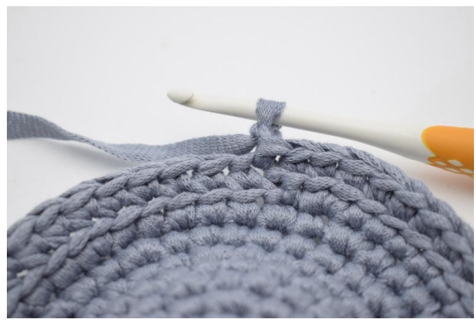
3. Work sc in the BL of each st to then end of the rnd and end with a sl st.