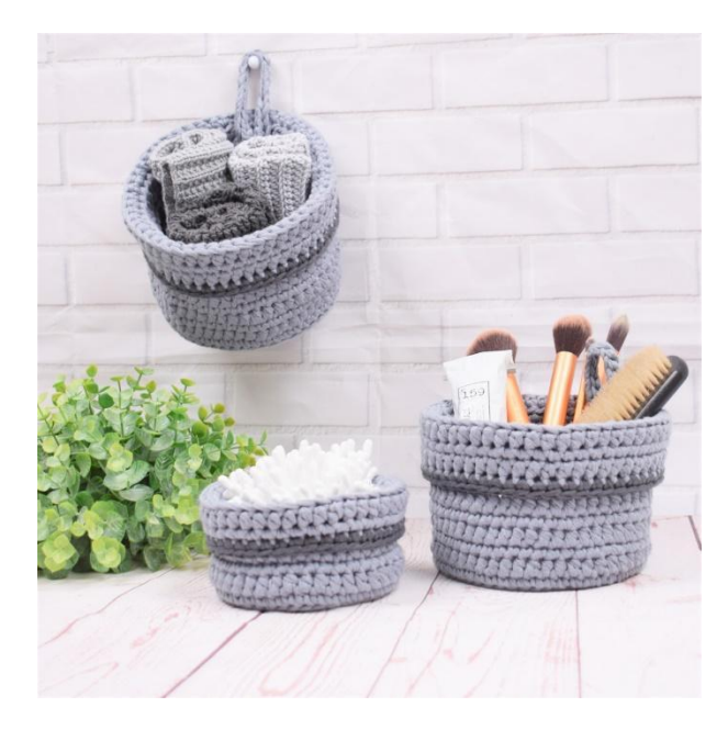
Enjoy! ⊚ Best Wishes, Hobbii.com