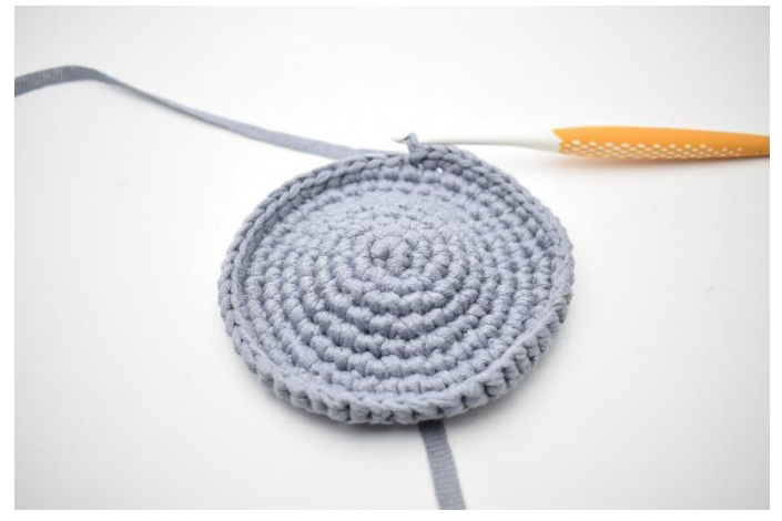
1. Here is what the base will look like at the end of rnd 9, ending with a sl st.