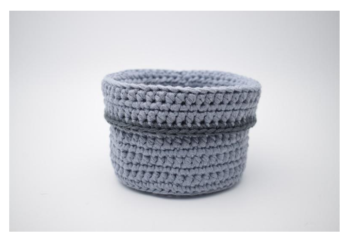
15. Fold the edge of the basket over and attach the hanging loop.