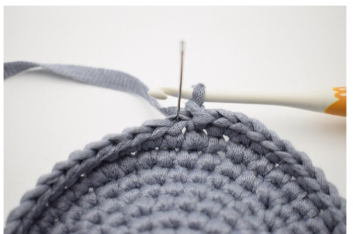
2. Ch 1 and work a sc in the BL. The needle is indicating where to insert the hook.