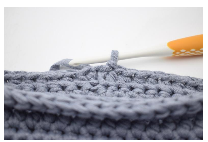
11. End with a sl st.