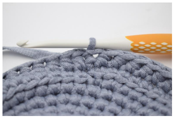
5. Work hdc in each st to the end of the rnd. End 6. Ch 1. with a sl st in the first hdc.