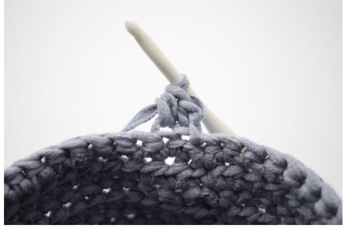
10. Ch 1, work hdc in the BL of each st to the end of the rnd.