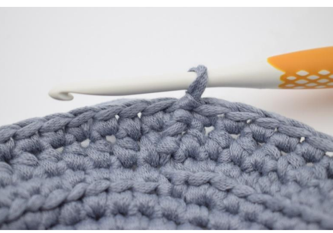
7. Work sc in each st to the end of the rnd. End with a sl st in the first sc.