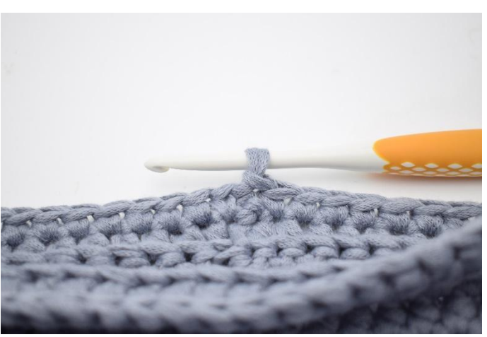
12. Ch 1, Work sc in each st to the end of the rnd. End with a sl st in the first sc.