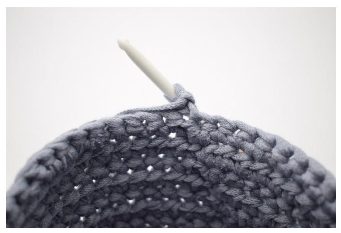
9. Turn the basket, so you are now working from the inside to the outside.