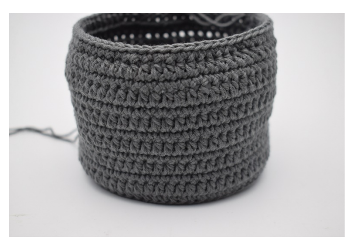
9. Repeat these 2 rnds until you reach the desired height of the basket as described in the pattern.