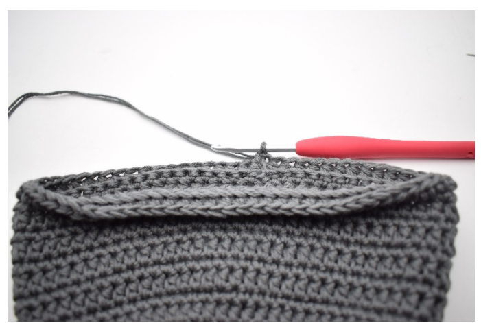
12. End with a sl st.