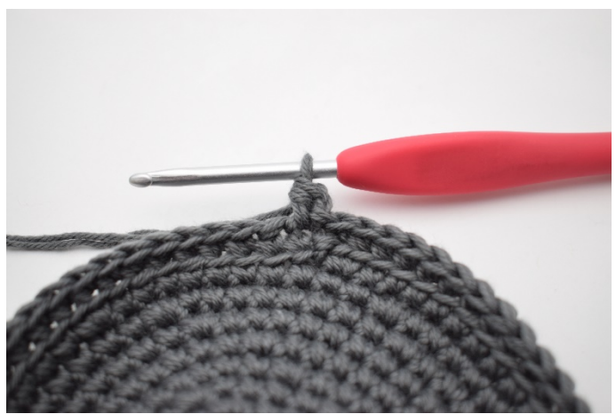
5. Work 1 hdc.