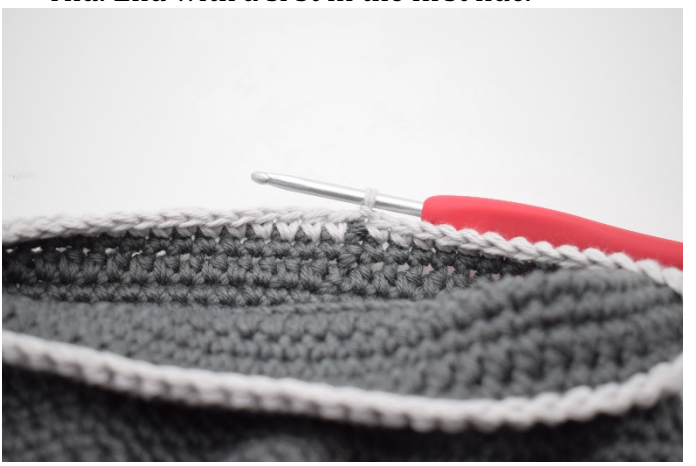
17. Change to a second color. Ch 1. Work sc in each st to the end of the rnd. End with a sl st in the first sc. Cut yarn and weave in the ends.