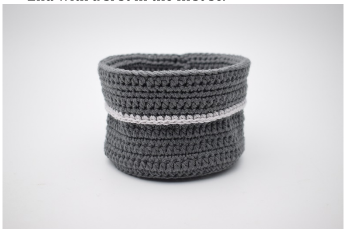
18. Fold the edge of the basket over and attach the hanging loop.