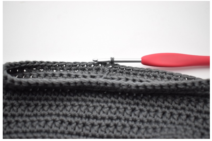
13. Ch 1, Work sc in each st to the end of the rnd. End with a sl st in the first sc.