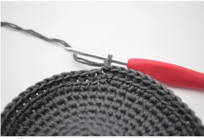
4. Ch 1.