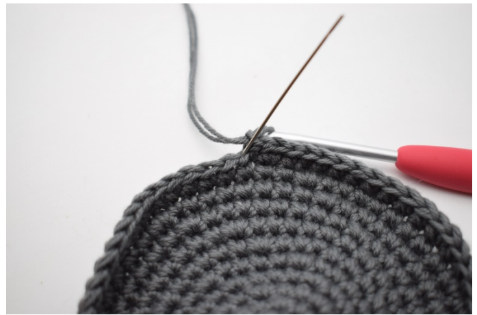
2. Ch 1 and work a sc in the BL. The needle is indicating where to insert the hook.