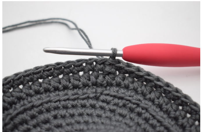
8. Work sc in each st to the end of the rnd. End with a sl st in the first sc.