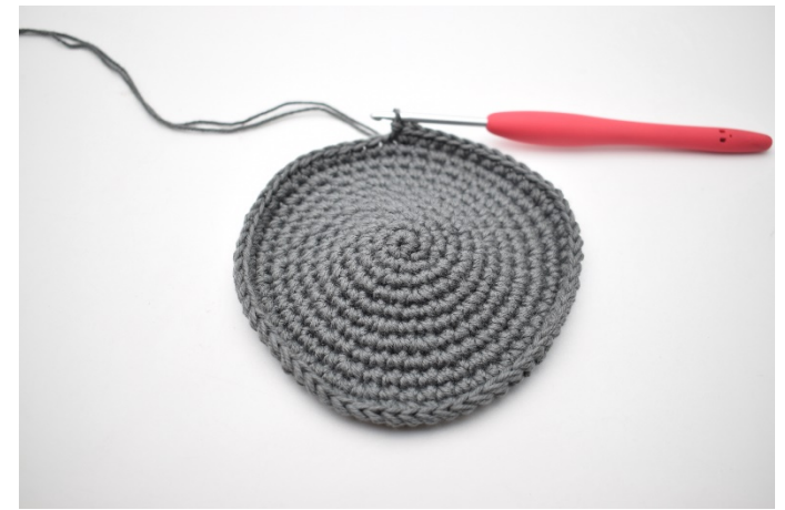
1. Here is what the base will look like at the end of rnd 11, ending with a sl st.