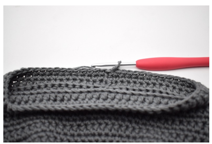
14. Ch 1, Work sc in each st to the end of the rnd. End with a sl st in the first sc.