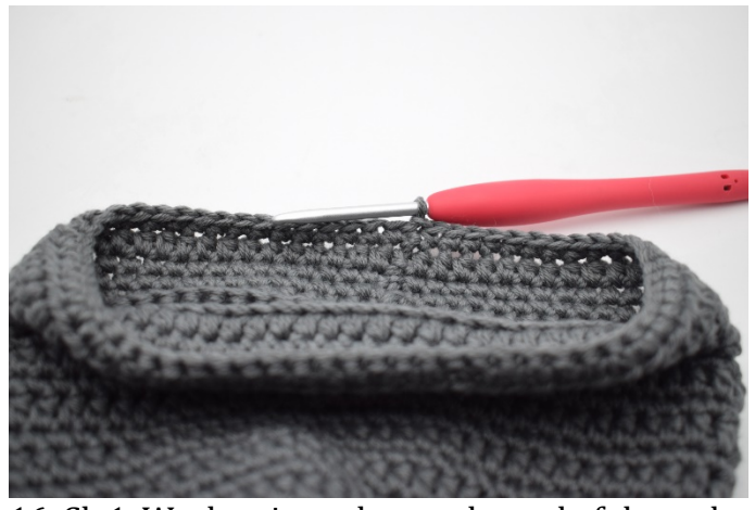
16. Ch 1, Work sc in each st to the end of the rnd. End with a sl st in the first sc.