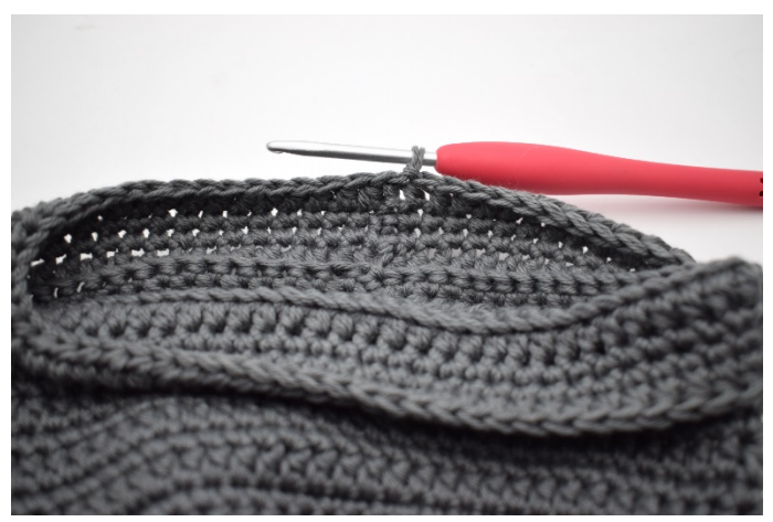
15. Ch 1, Work hdc in each st to the end of the rnd. End with a sl st in the first hdc.