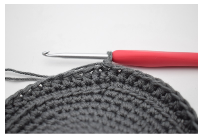
7. Ch 1.