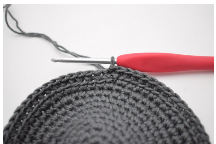
3. Work sc in the BL of each st to then end of the rnd and end with a sl st.