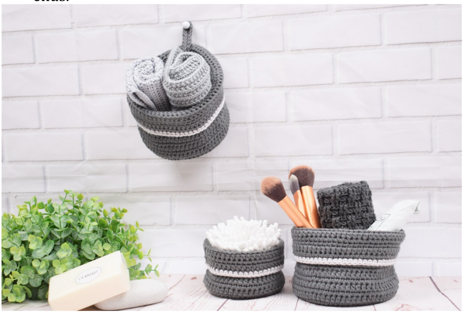
Enjoy! © Best Wishes, Hobbii.com