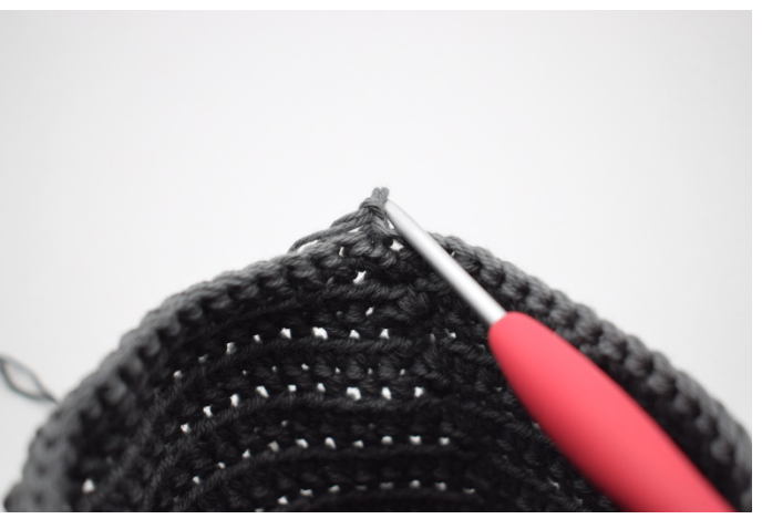
10. Turn the basket, so you are now working from the inside to the outside.