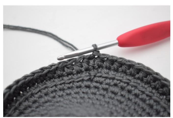
6. Work hdc in each st to the end of the rnd. End with a sl st in the first hdc.