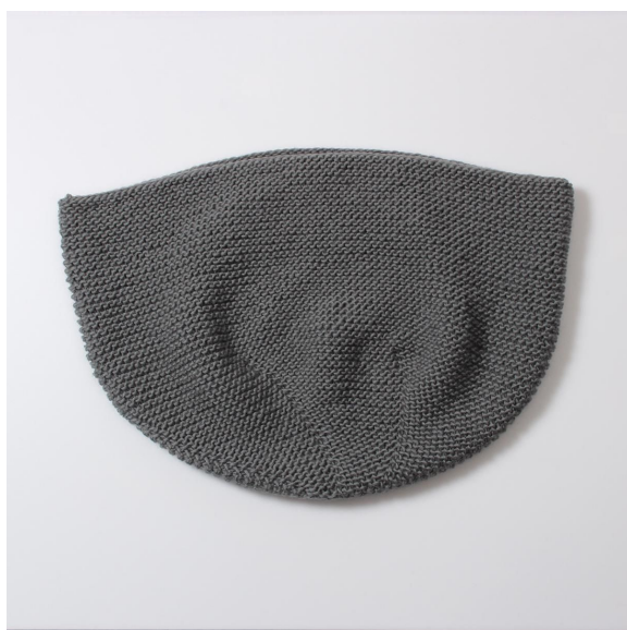
Basket before washing