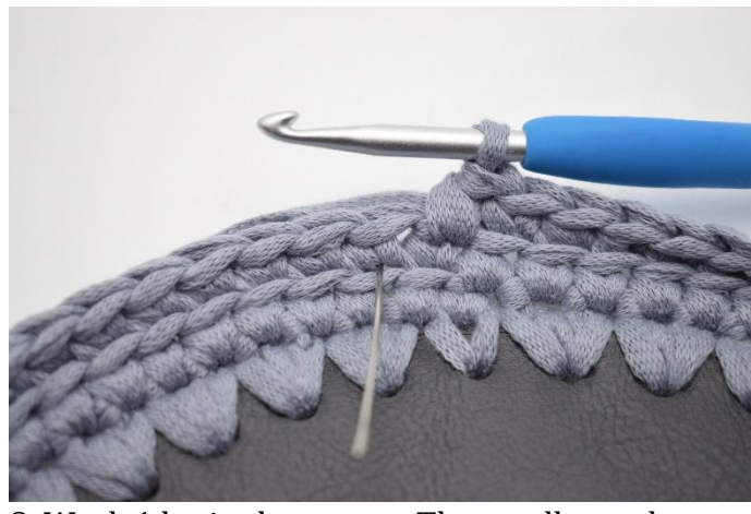
8. Work 1 lsc in the next st. The needle marks where your lsc should be worked.