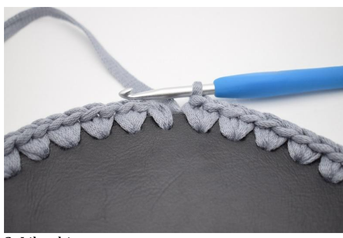
2. Like this.