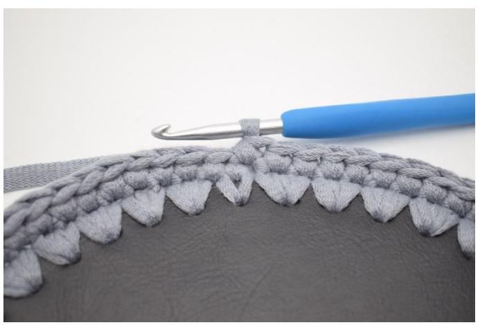
3. Work 1 round of sc