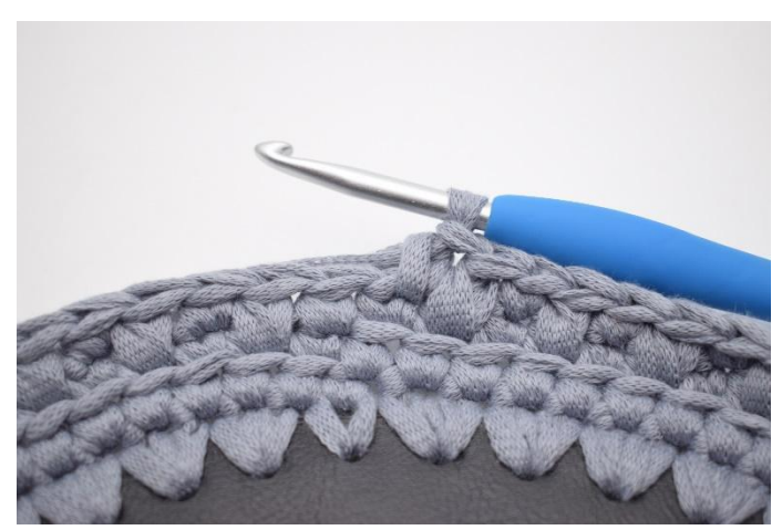
13. Repeat the round of alternating between sc and lsc. Finish the round with 1 sc.