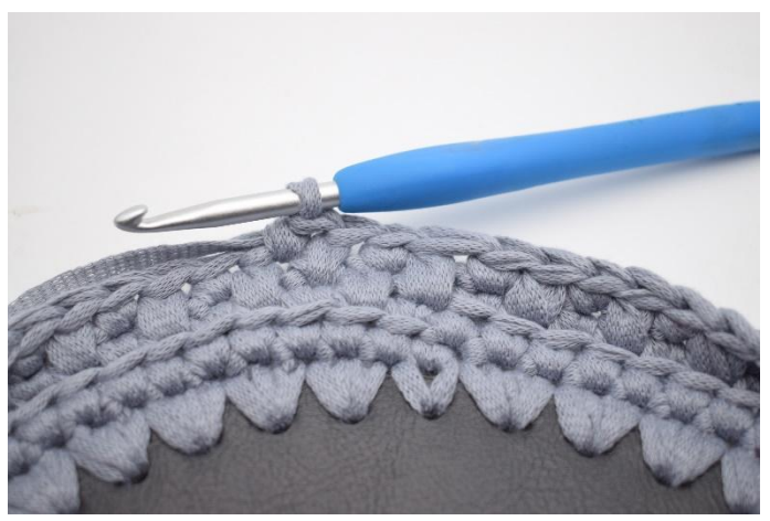
19. Work 1 sc in the next st.