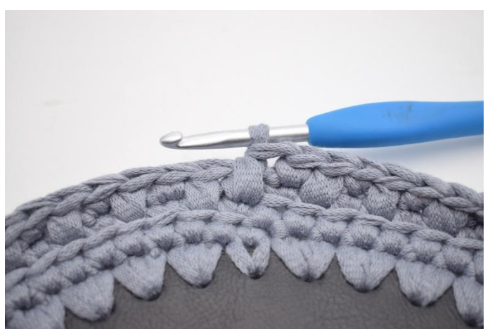
15. Like this.