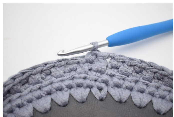
16. Work 1 sc in the next st.