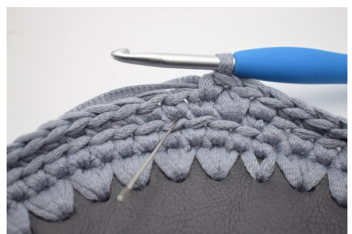
11. Work 1 lsc in the next st. The needæe marks where your lsc should be worked.