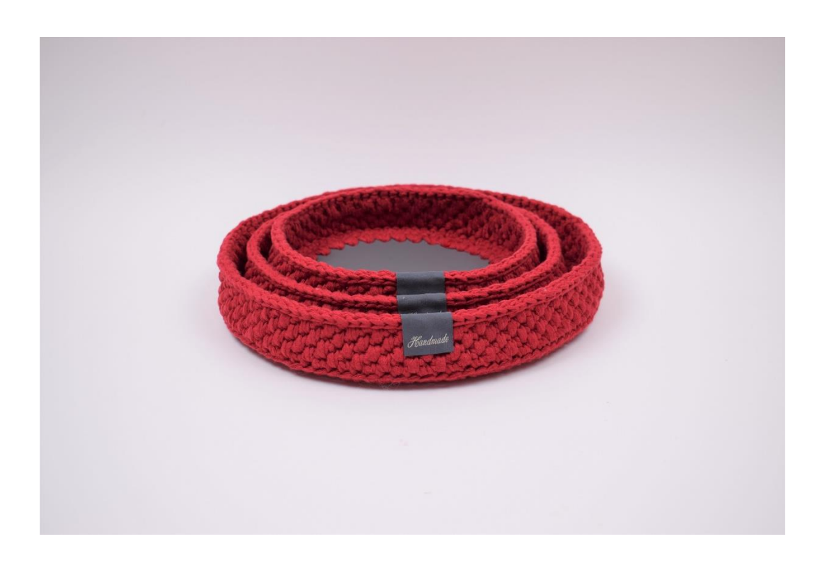
Happy crocheting ☺ Love Hobbii.com

Glue or sew the "handmade" label onto the tray