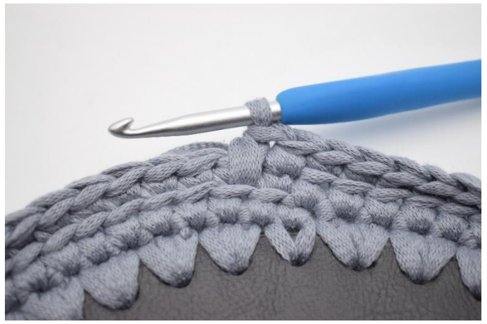
9. Like this. Now, you have worked 1 sc and 1 lsc.