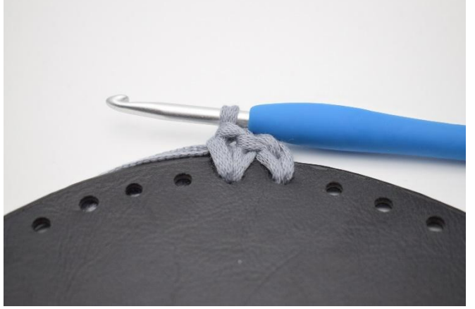
1. Work sc in each hole of the base as described in the pattern.