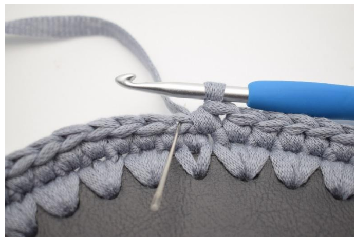
4. Now, work sc in blo. The needle marks where your sc should be worked.