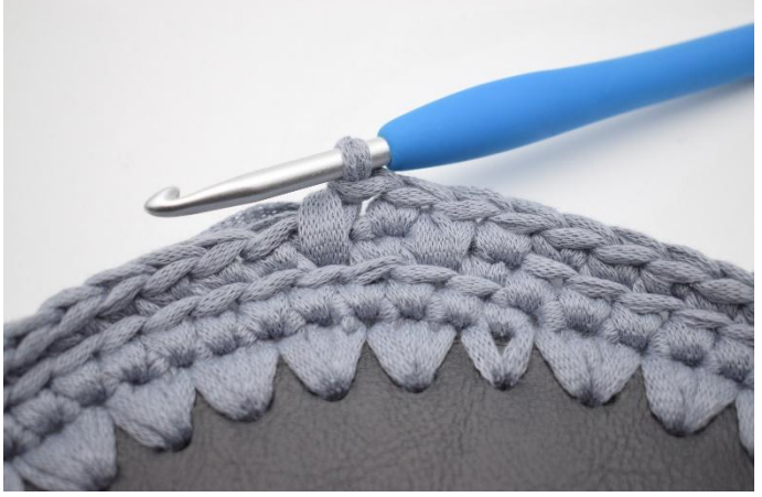
12. Like this.