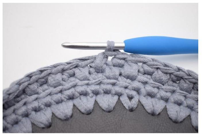
18. Like this.