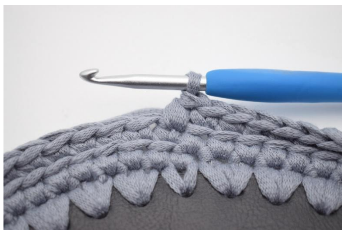
7. Now, alternate between sc and lsc. Start with a sc.