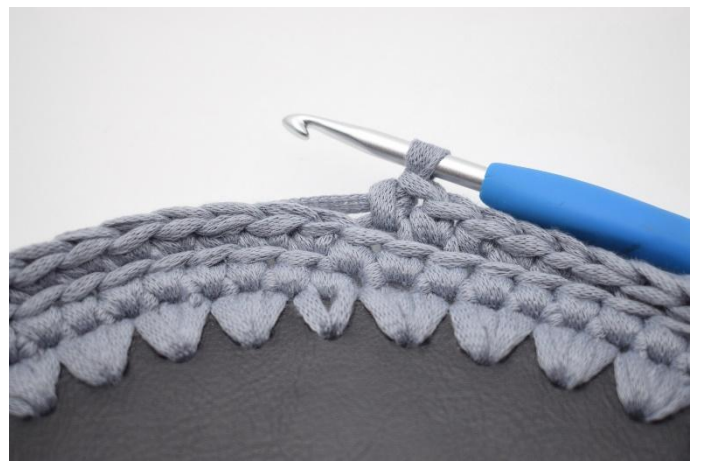
6. Repeat the round of sc in blo.