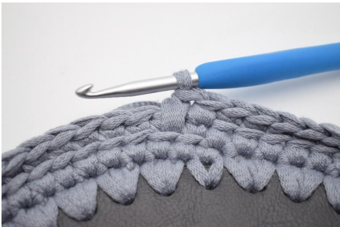
9. Like this. Now, you have worked 1 sc and 1 lsc.