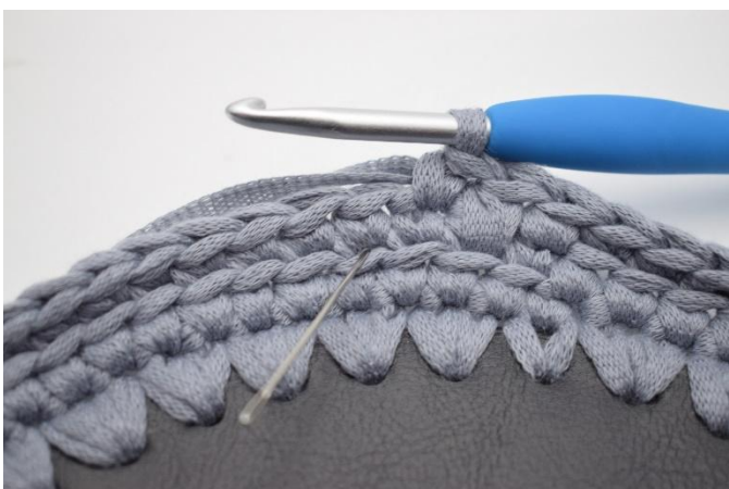
11. Work 1 lsc in the next st. The needle marks where your lsc should be worked.