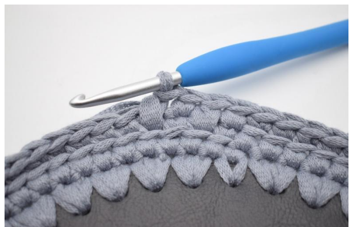
12. Like this.