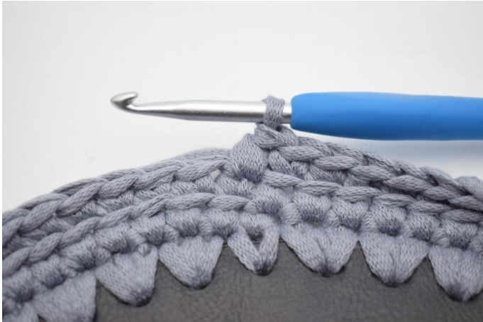
7. Now, alternate between sc and lsc. Start with a sc.